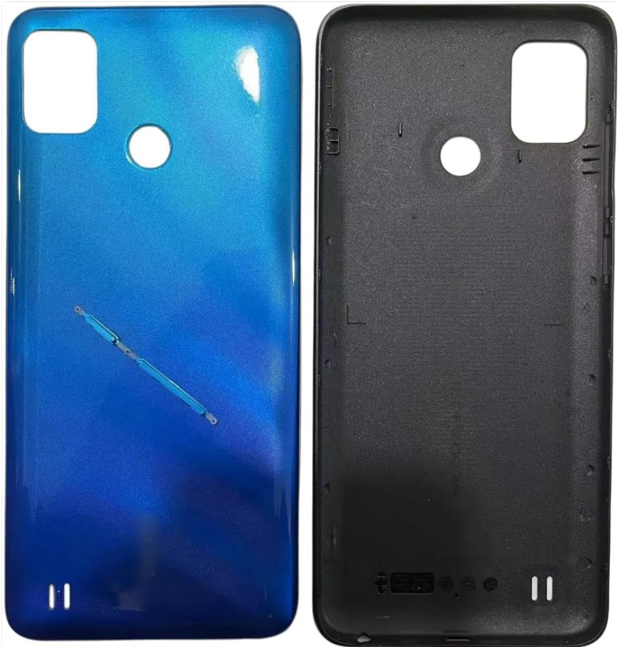
Figure 2.1: Front view of the blue back cover and internal view of the black back cover. This image illustrates the external