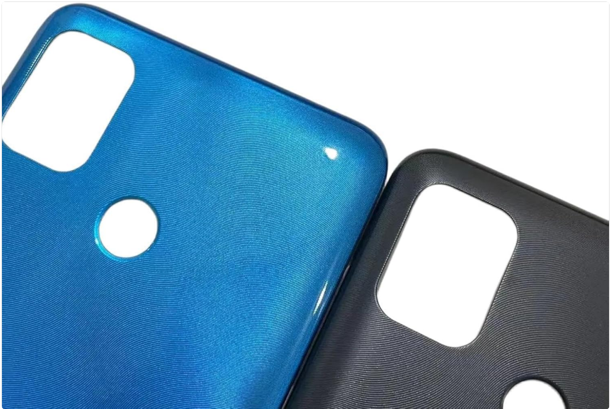
Figure 3.1: Close-up view of the camera and fingerprint sensor cutouts on both the black and blue back covers. This detailed image highlights the precision of the cutouts for critical phone components.