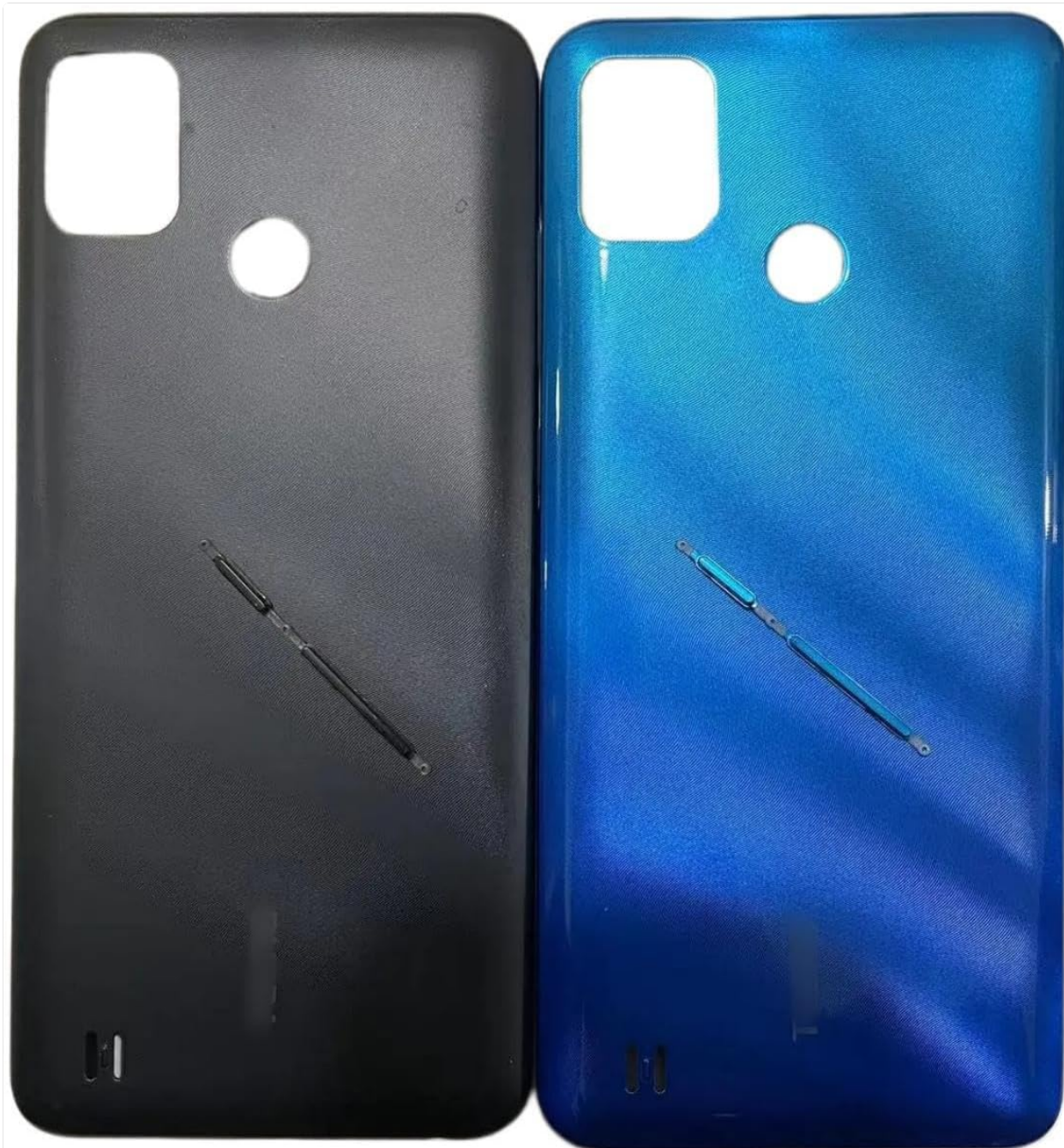
Figure 1.1: SHOWGOOD replacement back battery covers in black and blue. This image displays both color variants of the back cover, highlighting their external appearance and design, including the camera cutout and fingerprint sensor area.