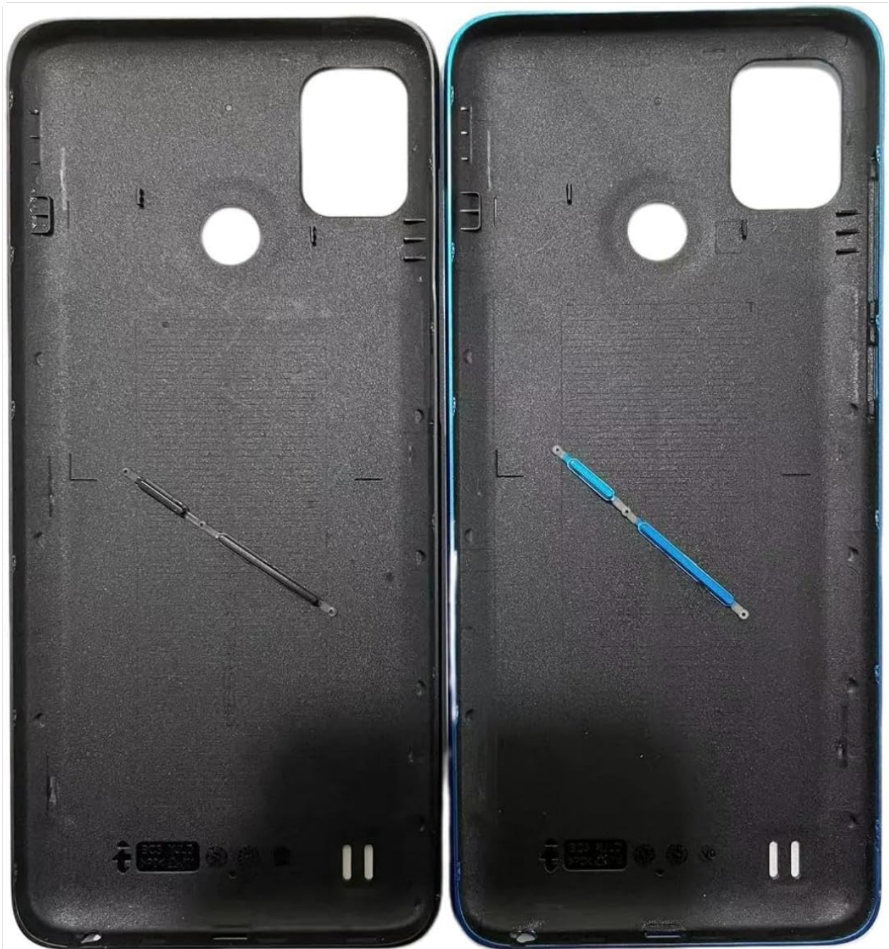
Figure 2.3: Internal view of both black and blue back covers. This image clearly shows the internal molding, structural supports, and cutouts for components like the camera and fingerprint sensor on both replacement covers.