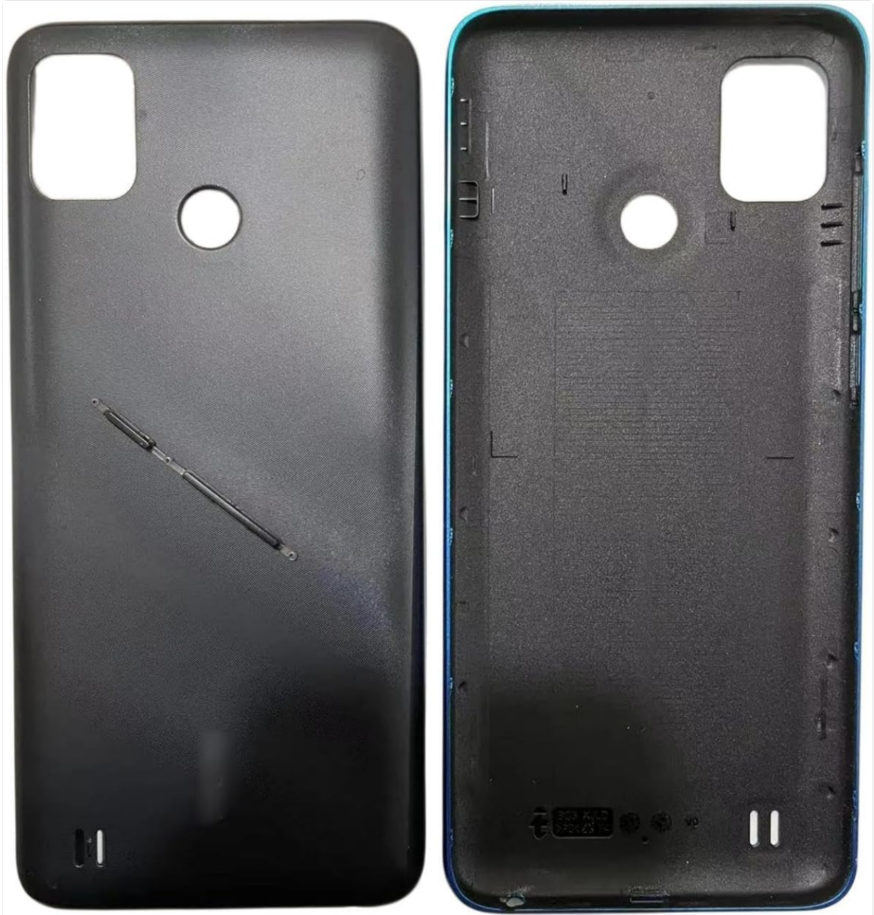
Figure 2.2: Front view of the black back cover and internal view of the blue back cover. Similar to Figure 2.1, this image provides a complementary view of the two color variants, showing both their external and internal aspects.

finish of one cover and the internal structure, including mounting points and adhesive areas, of the other.