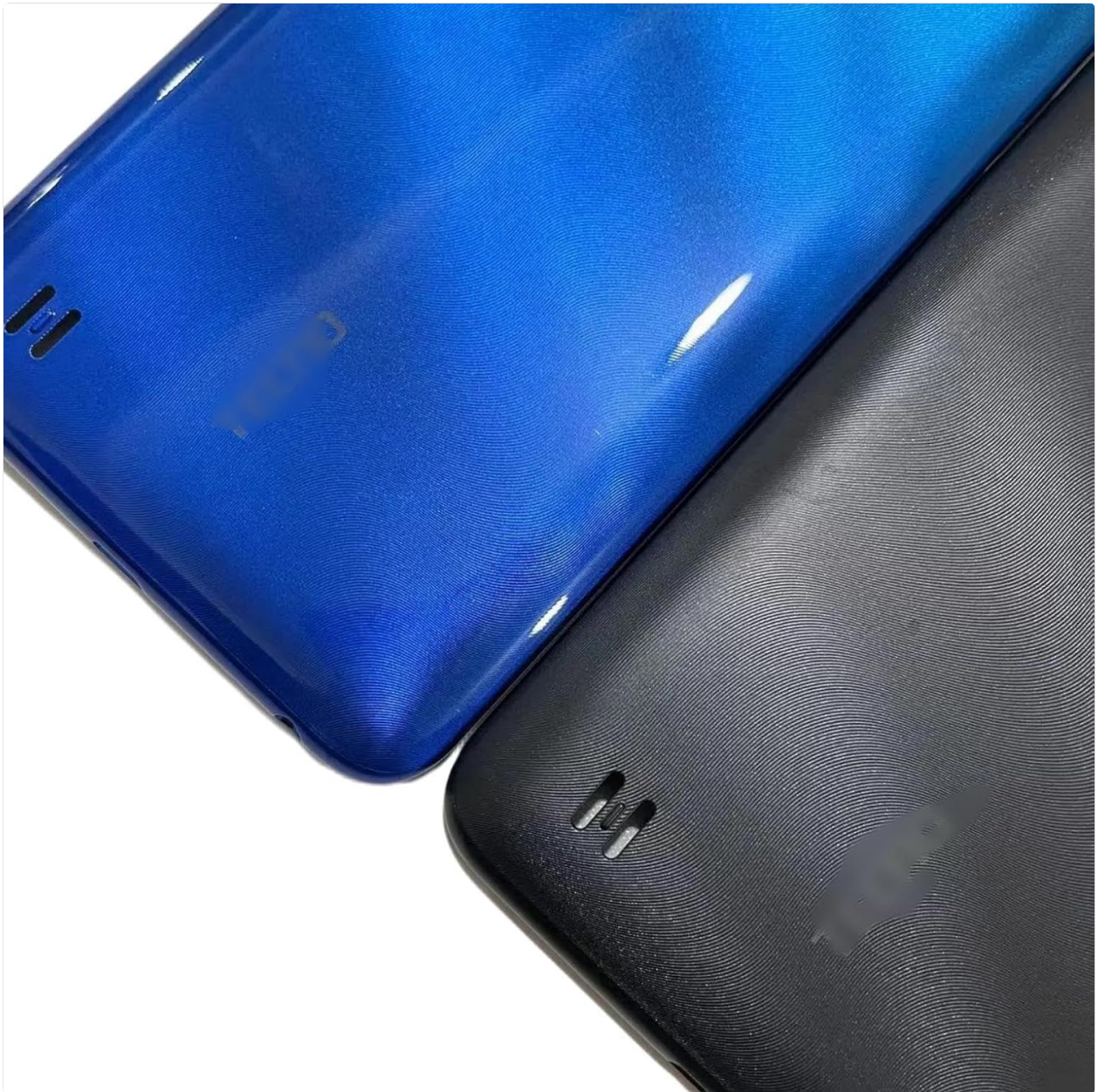
Figure 3.2: Close-up view of the bottom speaker and charging port area on both the black and blue back covers. This image provides a detailed look at the bottom edge design and cutouts.