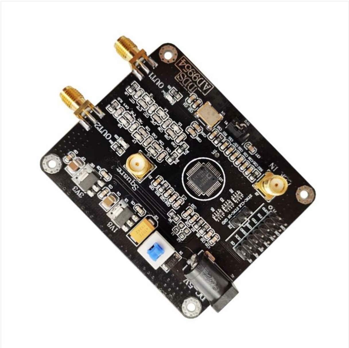
Figure 3.2: Detailed top view of the AD9954 module, showing the 'Square' marking which indicates a dedicated square wave output or selection. Also visible are the 1V8 and 3V3 voltage regulators, essential for the module's operation.