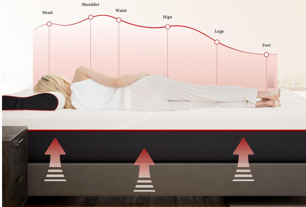
Image: Mattress support for various sleep positions.