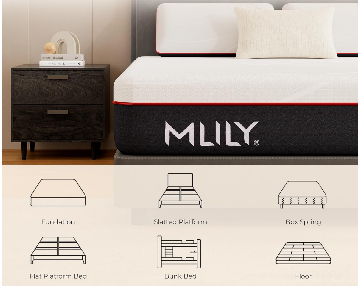
Image: Mattress compatibility with different bed bases.