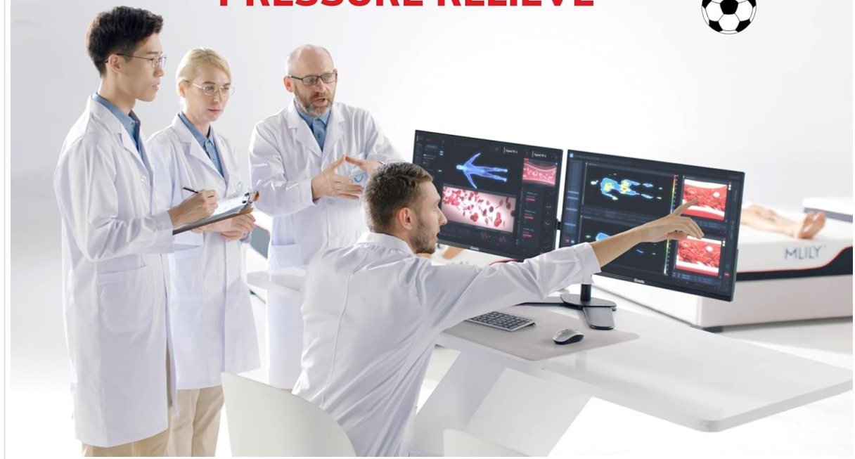
Image: Pressure relief demonstration.

Your browser does not support the video tag.