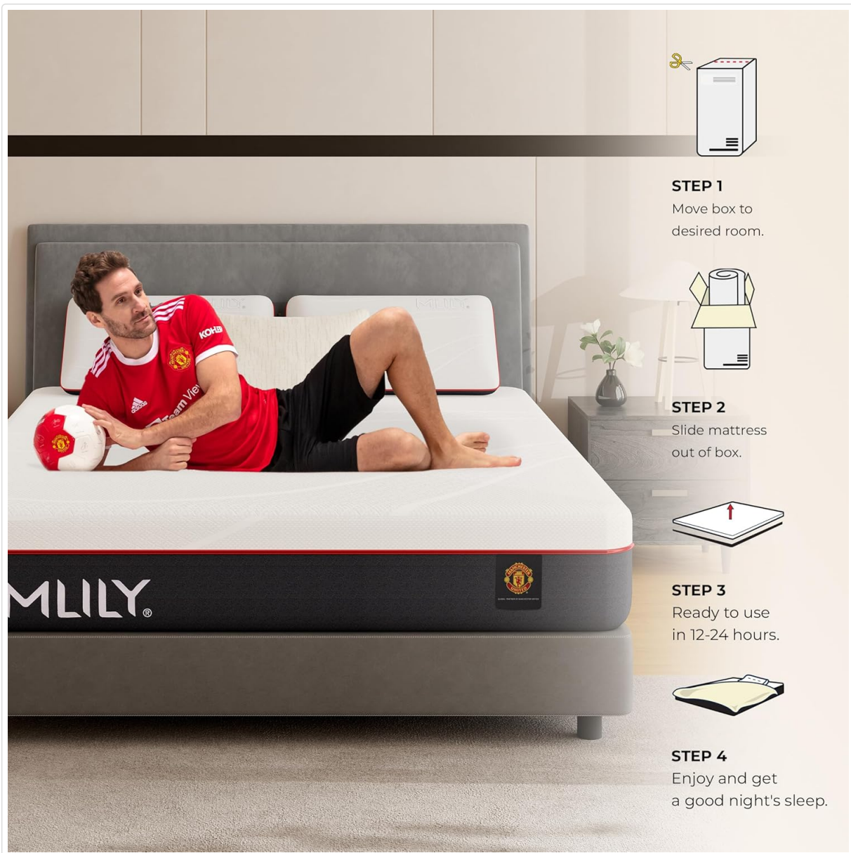
Image: Visual guide for mattress unboxing and expansion.

Important Note: While the mattress will expand quickly, it is recommended to allow 24-48 hours for it to reach its full comfort potential and for any new mattress odor to dissipate. This mattress is compatible with various bed bases, including foundations, slatted platforms, box springs, flat platform beds, and bunk beds.