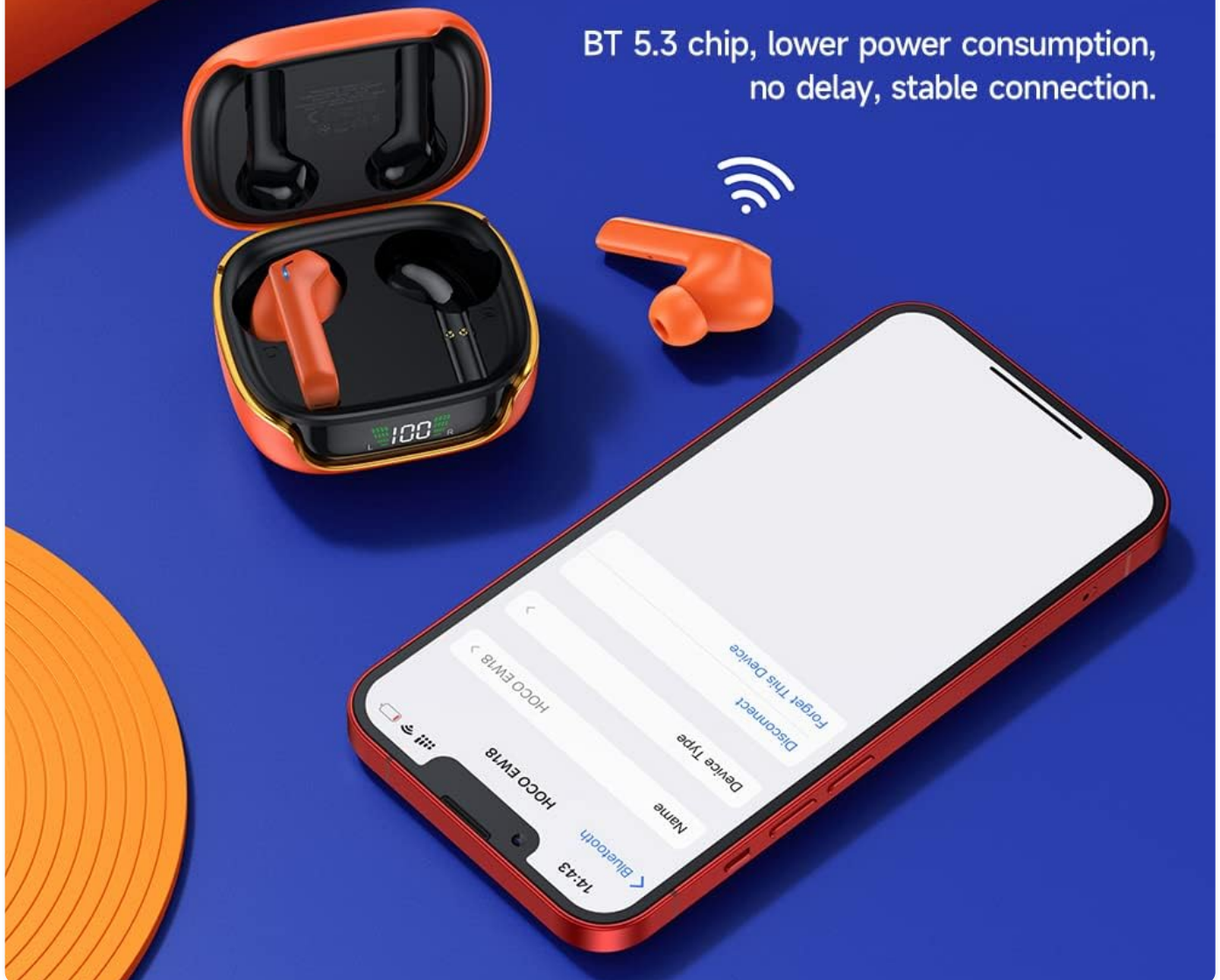
Image: A visual representation of the Hoco earbuds establishing a wireless connection using Bluetooth 5.3 technology, highlighting stable and low-power consumption.

BT 5.3 chip, lower power consumption, no delay, stable connection.