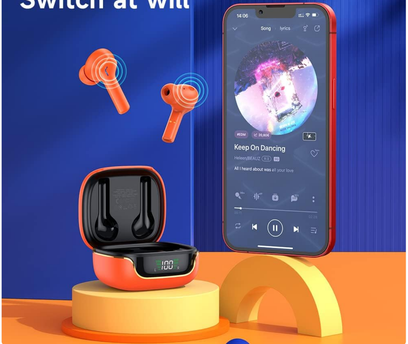
Image: The earbuds and charging case next to a smartphone, illustrating the automatic pairing feature and the ability to switch between devices seamlessly.