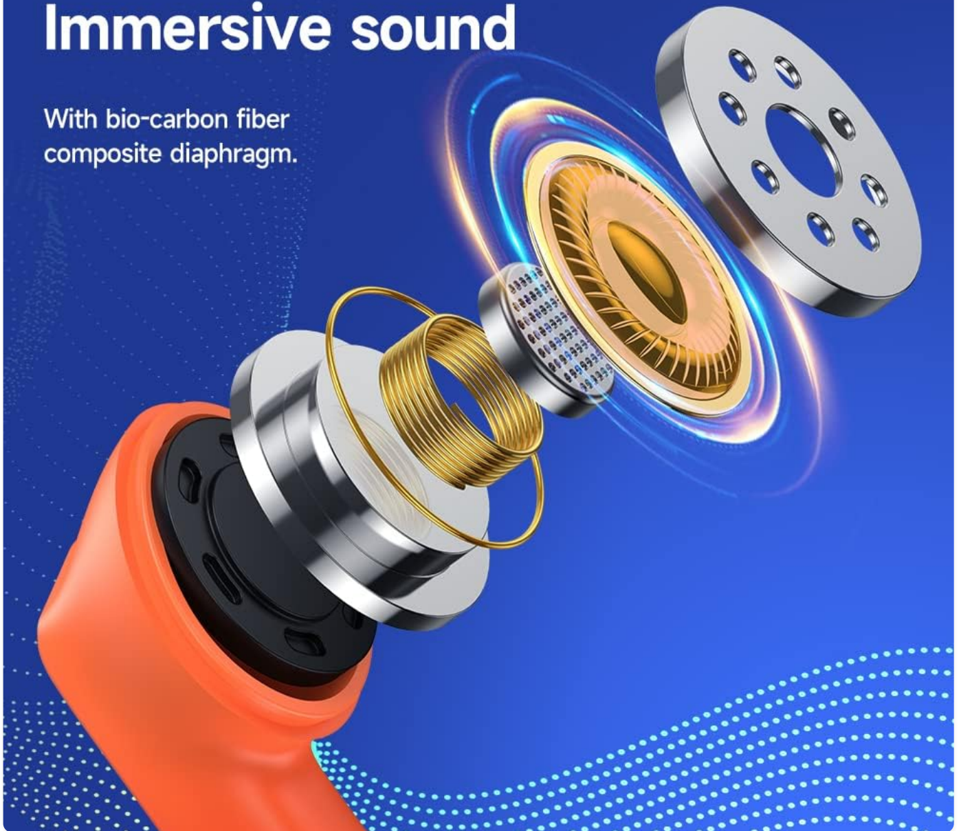
Image: An exploded view illustrating the 13mm moving coil driver and bio-carbon fiber composite diaphragm, designed for immersive sound quality.

With bio-carbon fiber composite diaphragm.