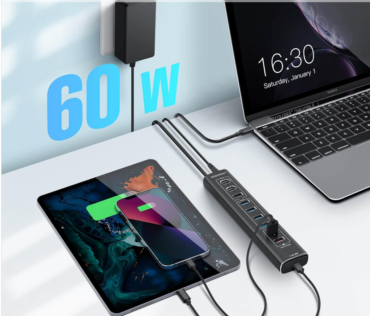
Image: A visual representation of the SuperSpeed Data Transfer capabilities, detailing 10Gbps for USB-C 3.2 and USB-A 3.2, and 5Gbps for USB-A 3.0.