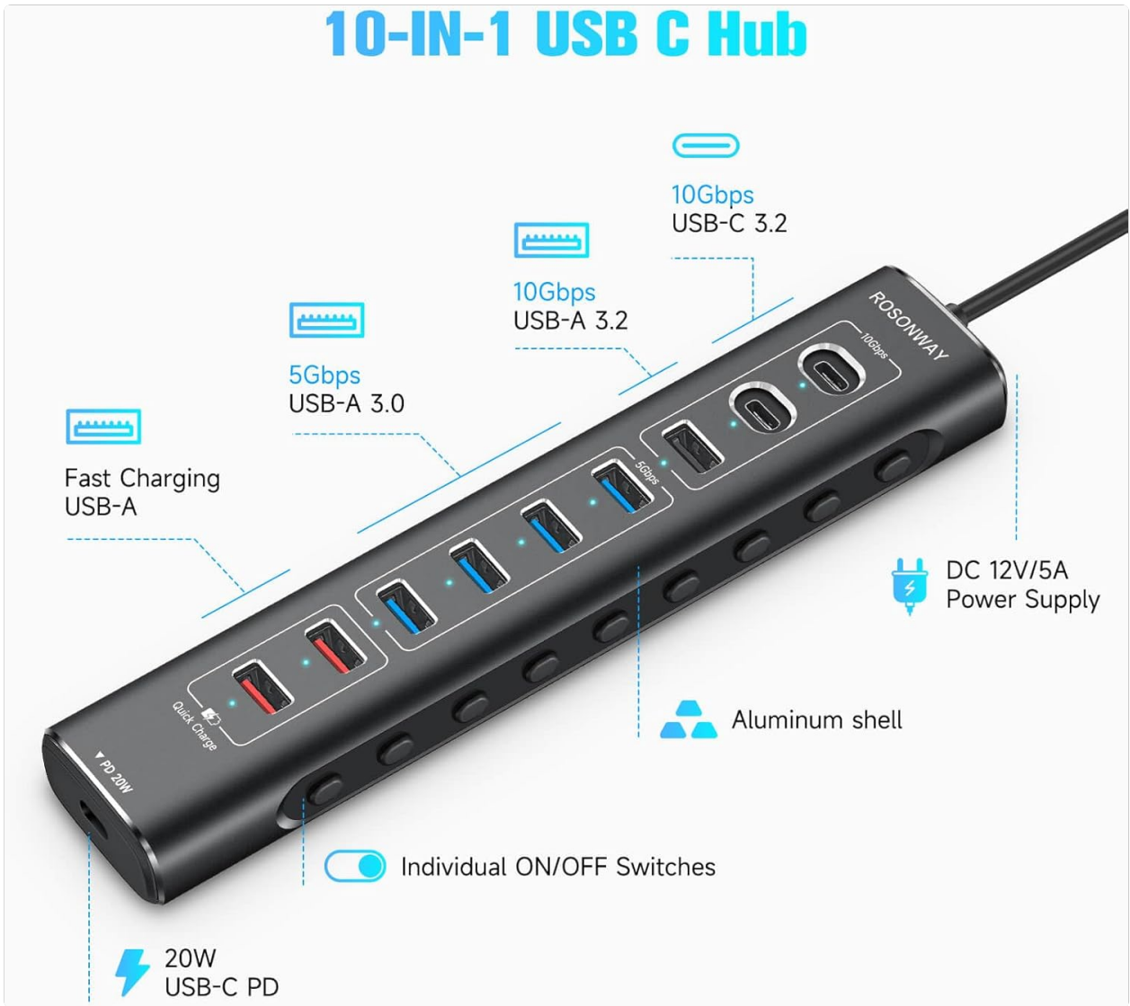
Image: An overview of the Rosonway 10-Port USB Hub, highlighting its 10-in-1 functionality with different port types and power input.