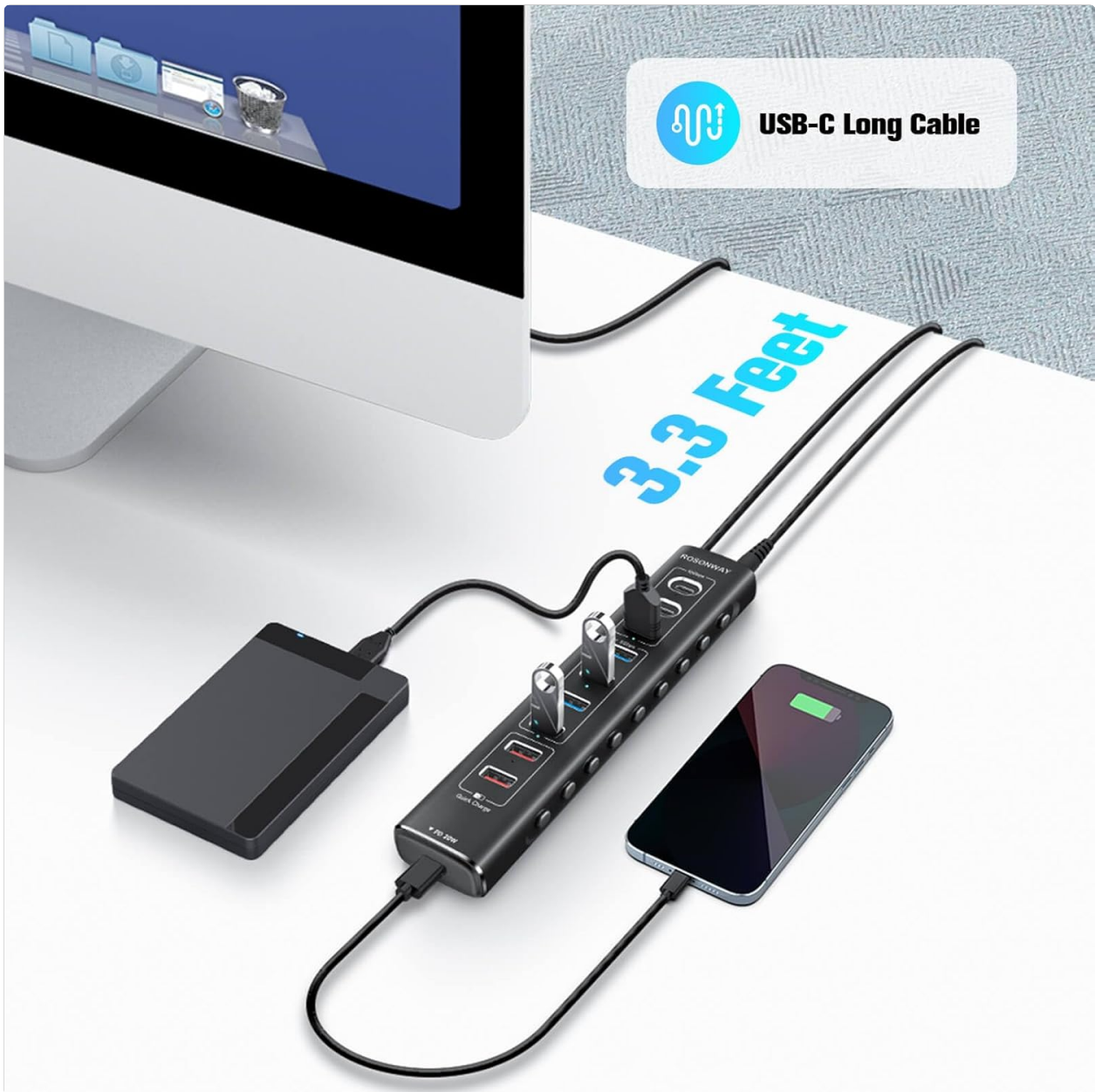
Image: The Rosonway USB Hub connected to a power outlet and charging multiple devices, illustrating its 3 fast charging ports and the 60W power adapter.