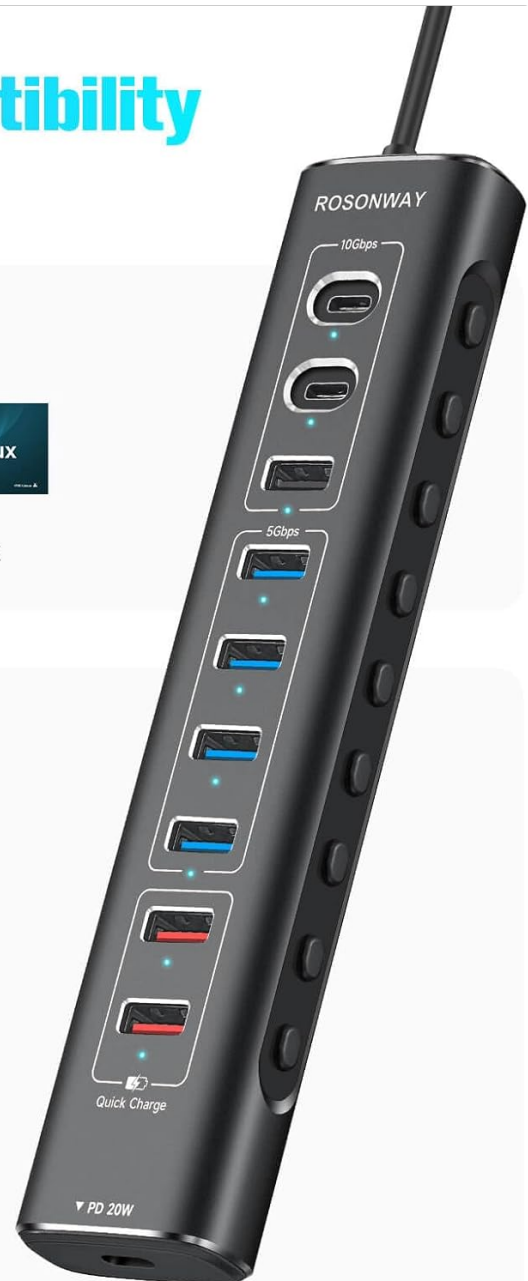
Image: A visual guide to the wide compatibility of the Rosonway USB Hub, listing supported operating systems and various devices.