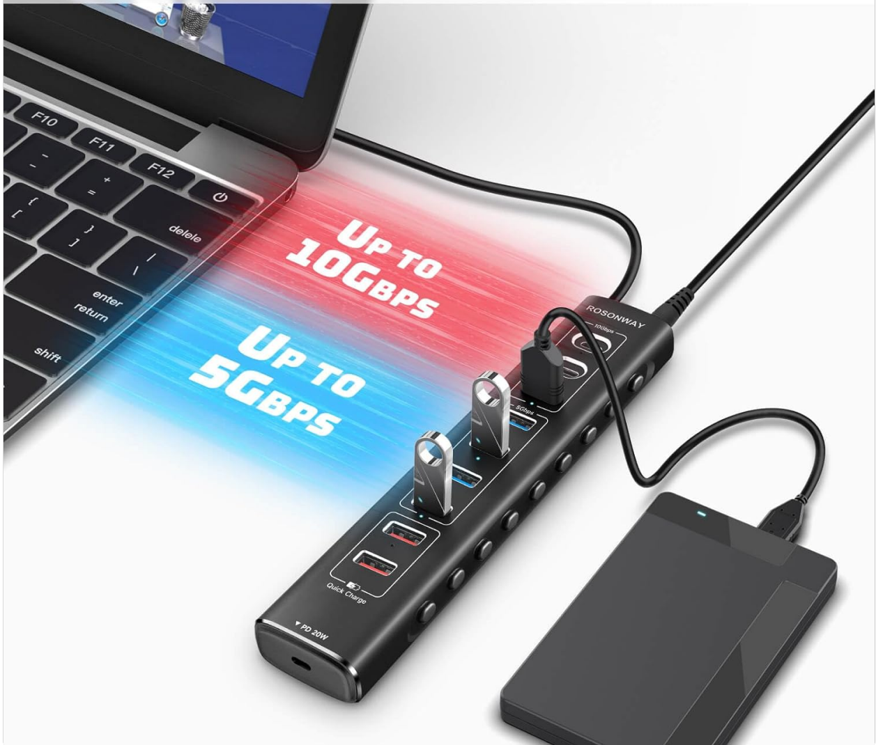
Image: The Rosonway USB Hub facilitating fast data transfer between a laptop and an external hard drive, showing speeds up to 10Gbps and 5Gbps.