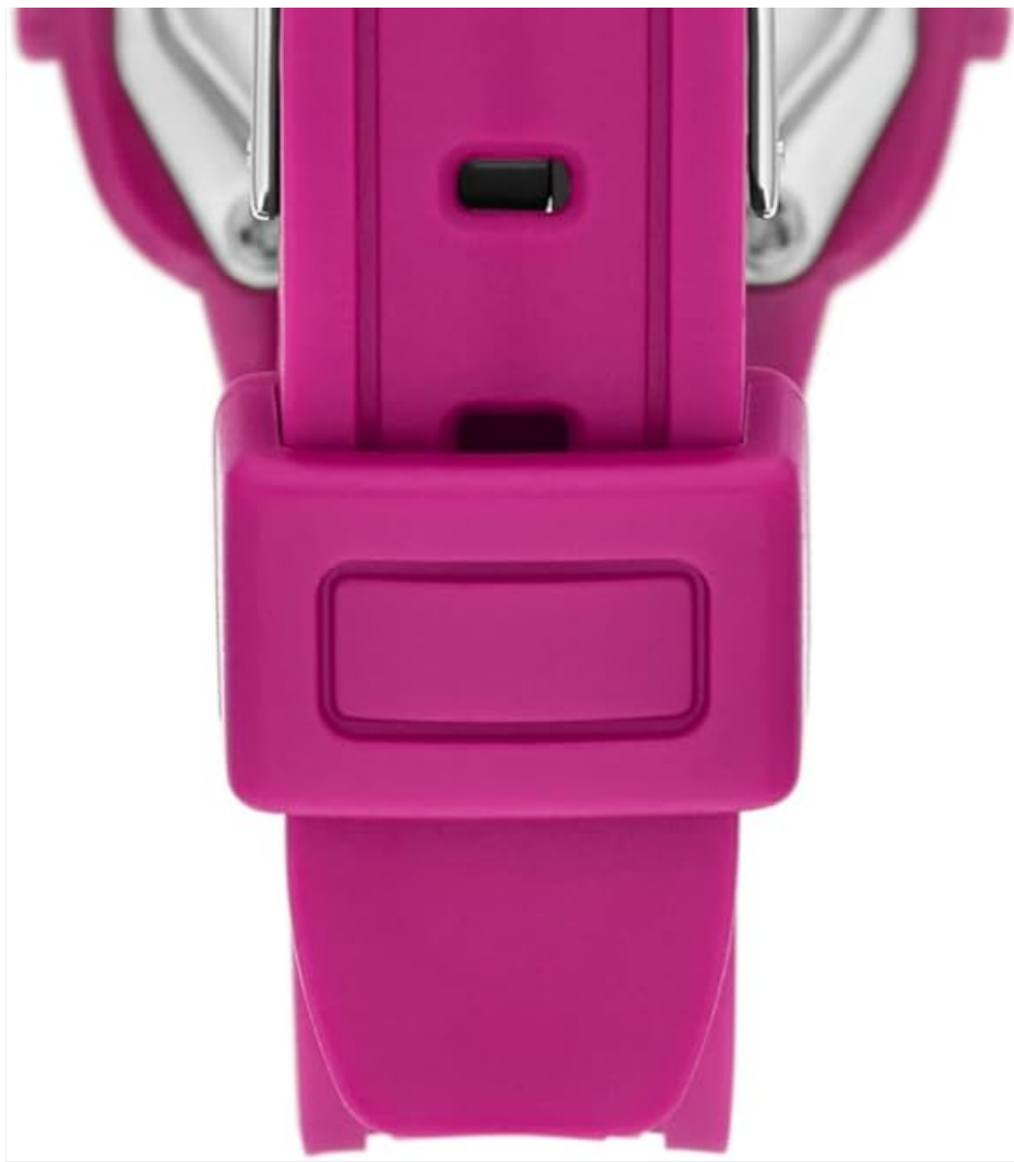
Figure 4: Rear view of the watch, showing the stainless steel case back and the buckle closure on the silicone band.