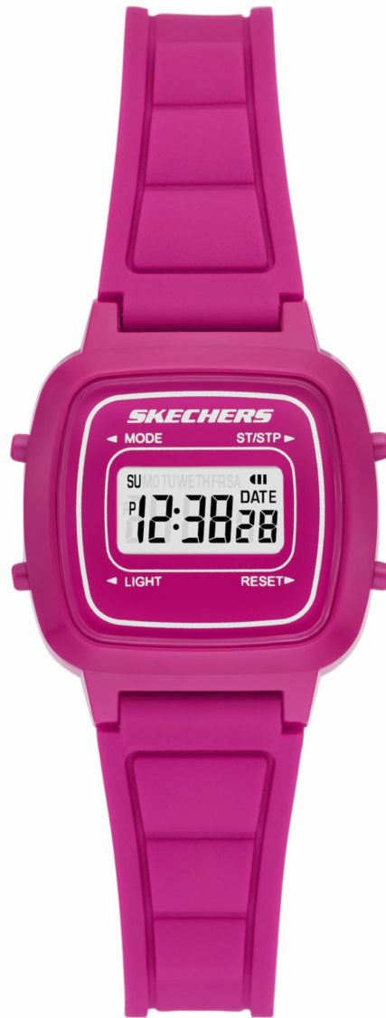
Figure 1: Front view of the Skechers Alta Digital Chronograph Watch, showcasing the digital display and overall design.