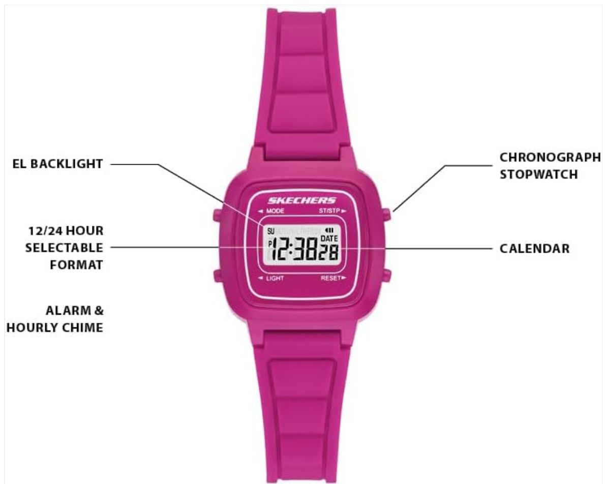
Figure 2: Detailed view of the watch face, indicating the functions of each button: MODE, ST/STP (Start/Stop), LIGHT, and RESET.