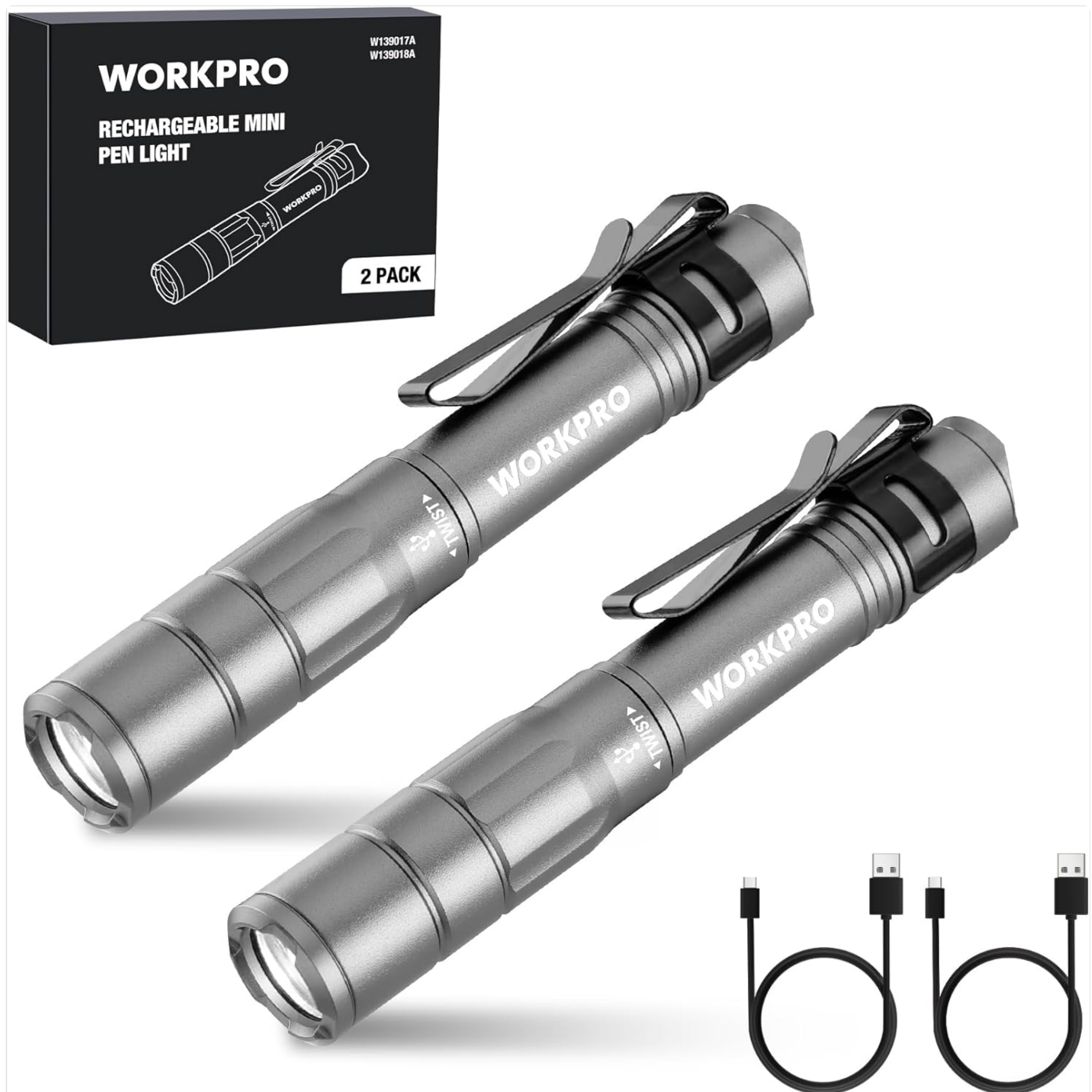
Figure 1: WORKPRO Rechargeable Pen Light (2-Pack) with included accessories.