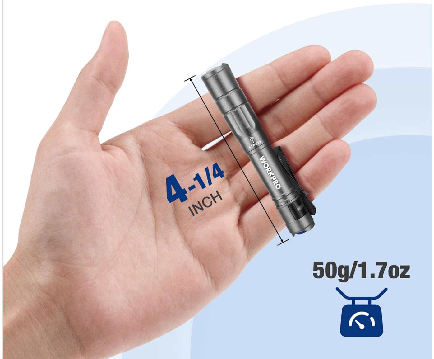
Figure 6: The compact size of the pen light, ideal for pocket carry.