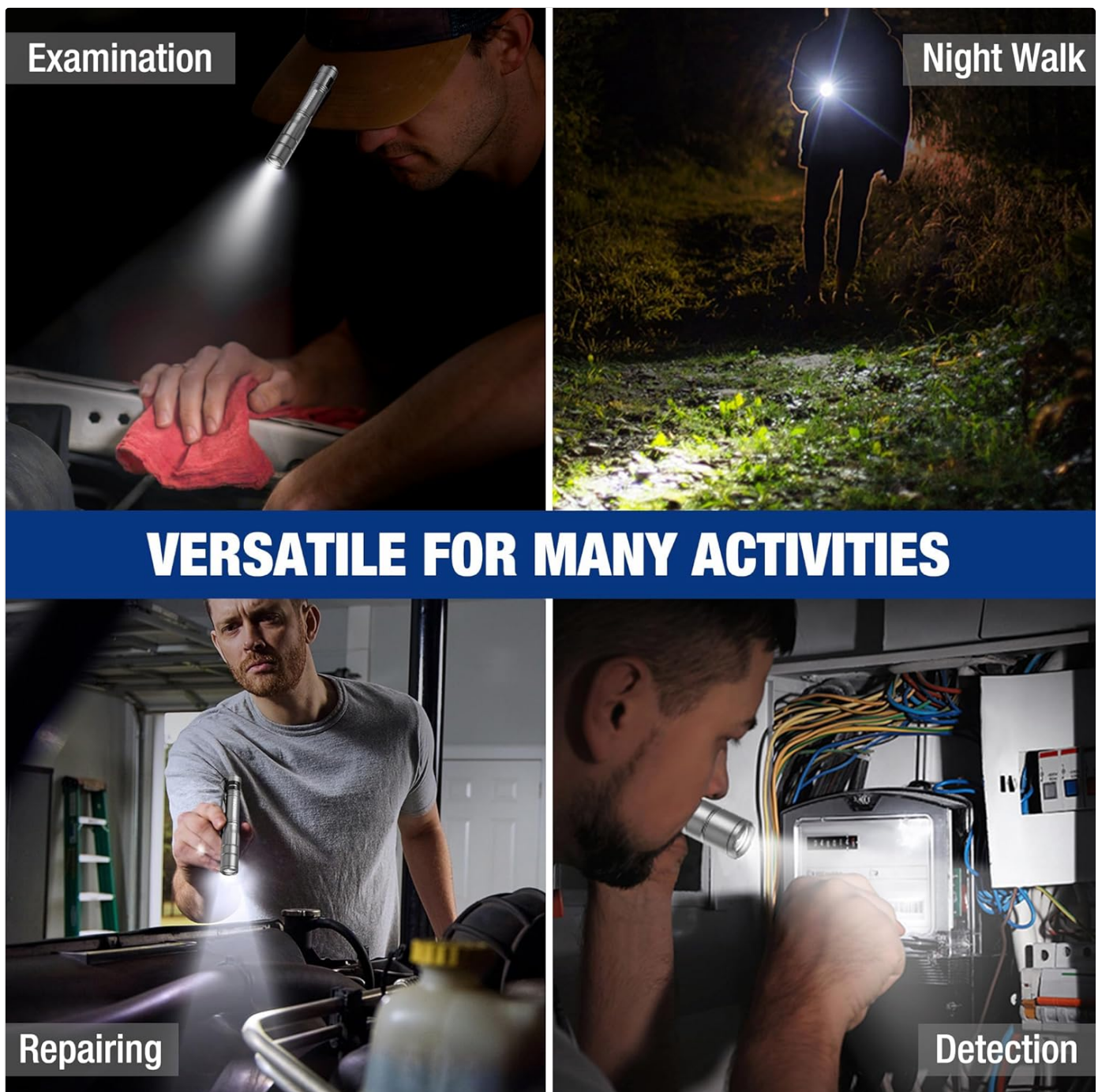
Figure 7: The pen light's versatility across different activities.