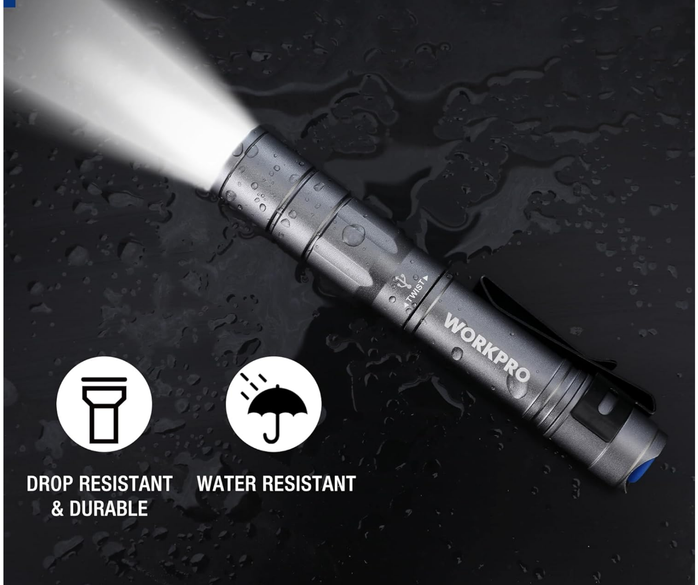
Figure 8: The pen light's premium aluminum material and water resistance.

MADE OF PREMIUM AVIATION-GRADE ALUMINUM ALLOY