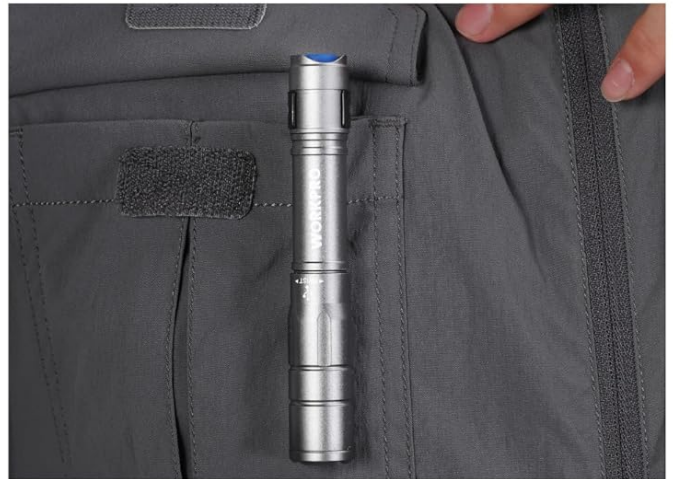
Figure 5: Examples of using the dual-direction clip for hands-free operation.