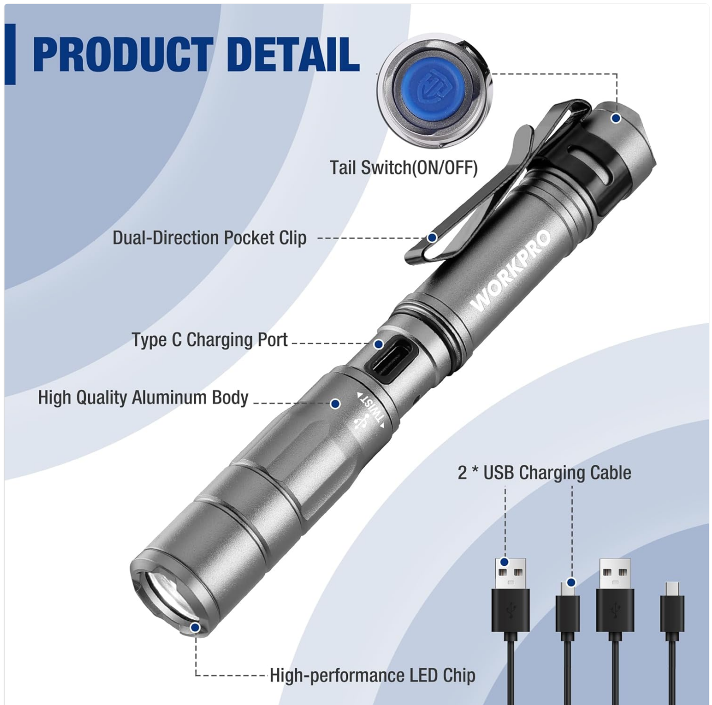
Figure 3: Product details highlighting the Type-C charging port location.