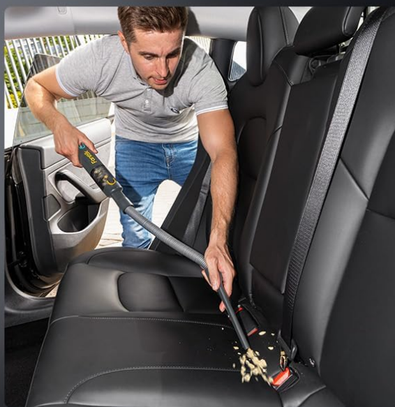
Image: Demonstrates the multi-function accessories of the Fanttik Slim V8 Mate, including the flexible hose for reaching under seats and the pet brush for fabric surfaces.