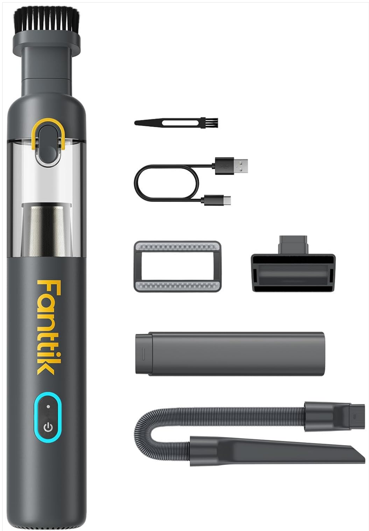
Image: Fanttik Slim V8 Mate with all included accessories.