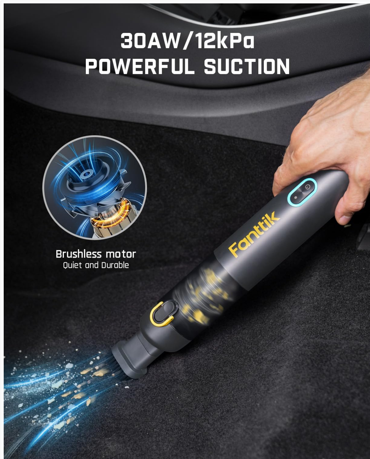
Image: A man using the Fanttik Slim V8 Mate with the flexible hose attachment to clean debris from the trunk of a car.