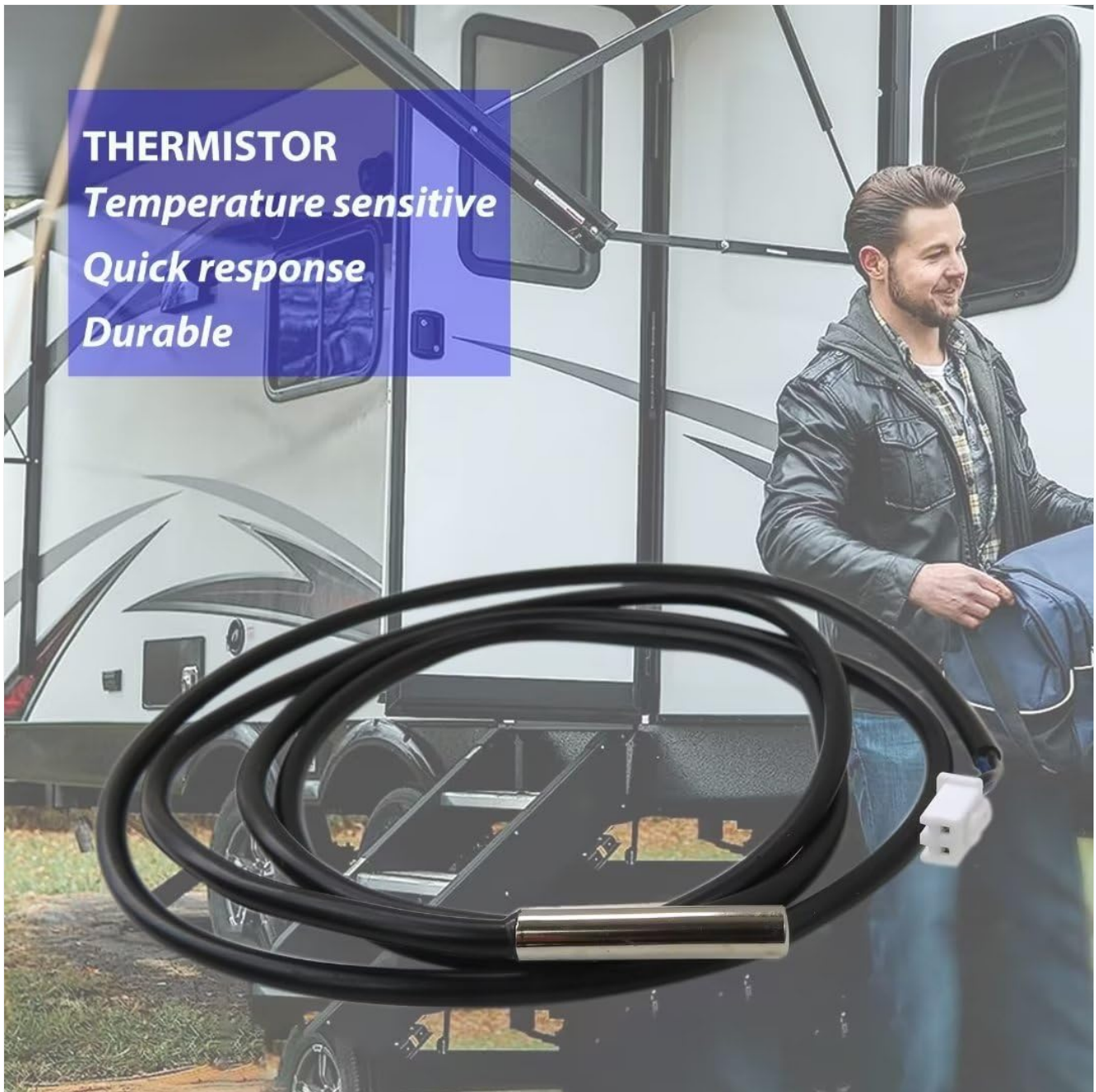
Figure 3.4: Key features of the thermistor, emphasizing its temperature sensitivity, quick response, and durable design.