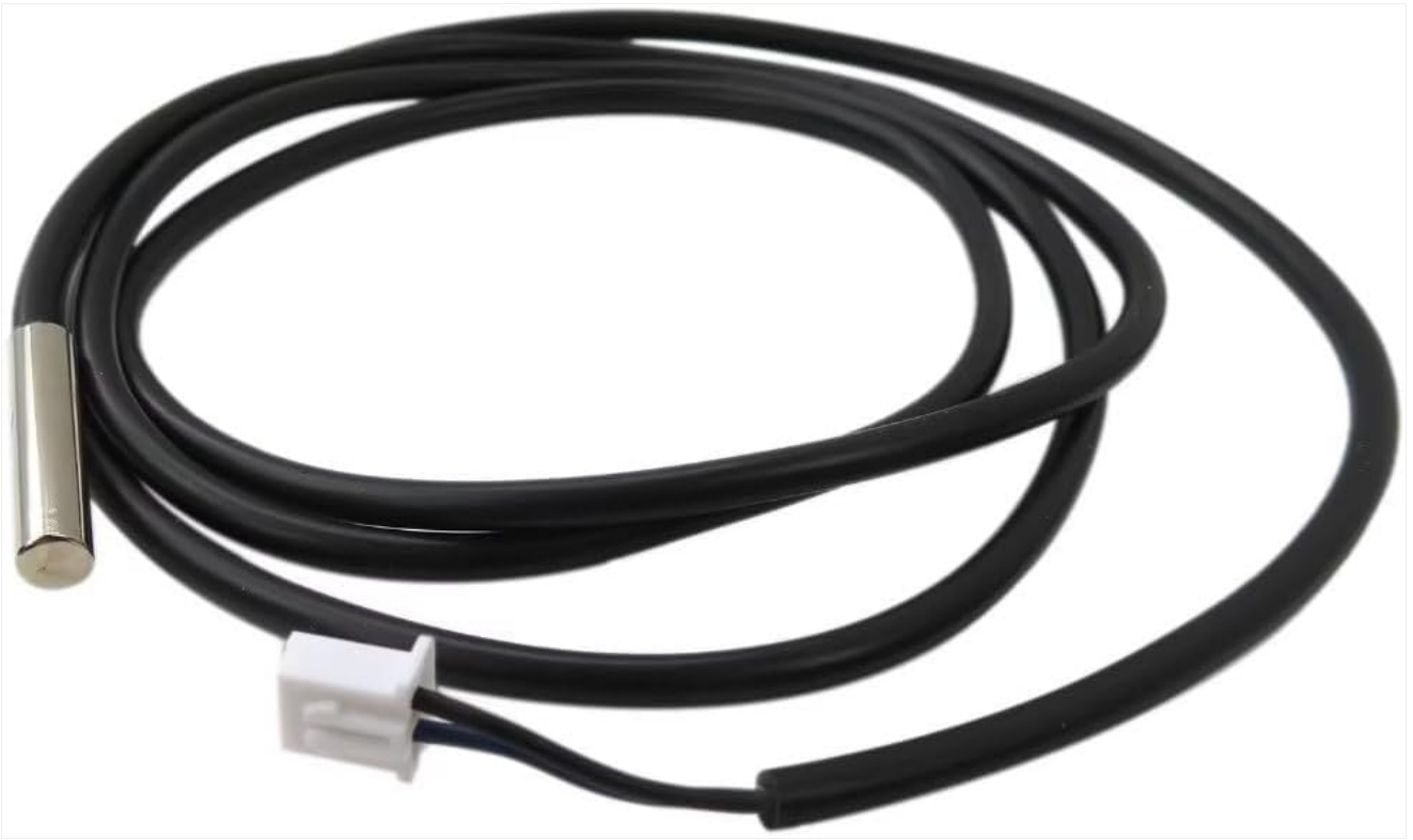
Figure 3.1: The complete Umbrella Thermistor Repair Kit, featuring the thermistor probe, cable, and connector.