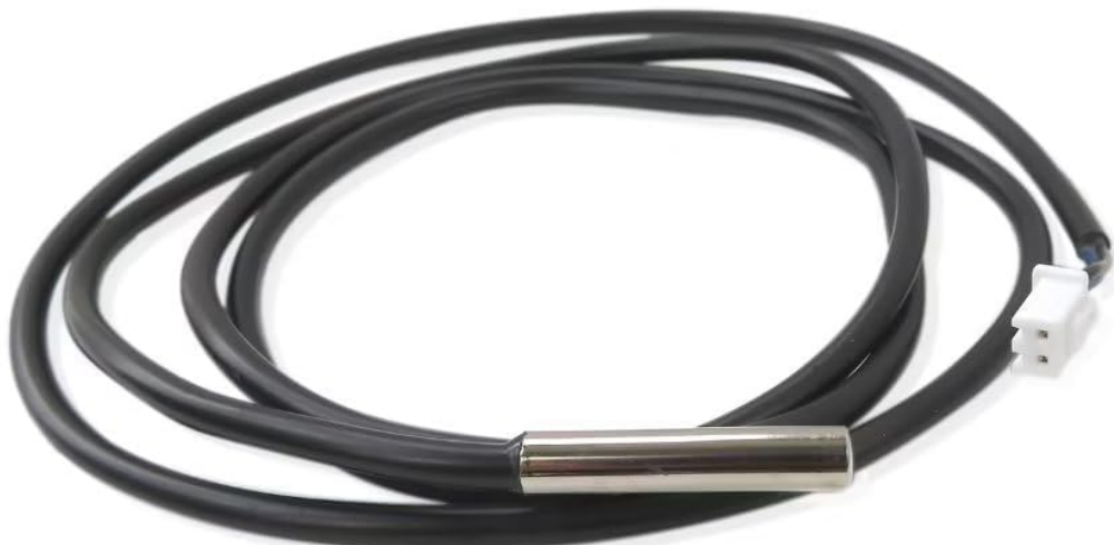
Figure 4.1: Visual confirmation of the thermistor repair kit's compatibility with various Waeco and VERA VERB models.

These fridge units require only a single thermistor cable replacement as provided (OEM)