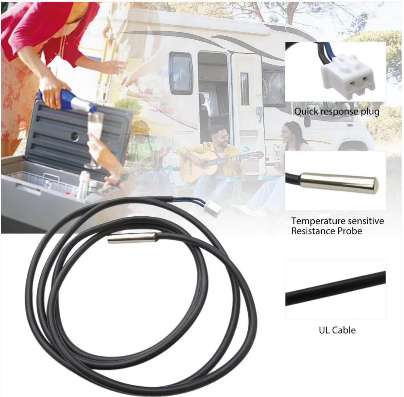
Figure 3.3: Detailed view highlighting the quick response plug, temperature sensitive resistance probe, and UL cable construction.