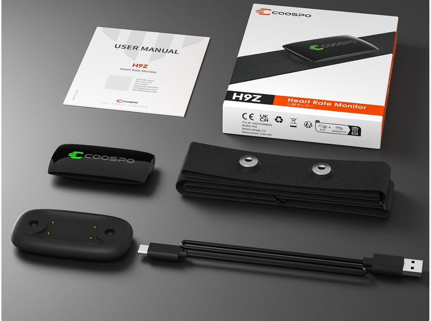
Image: Contents of the COOSPO H9Z package, showing the heart rate sensor, chest strap, charging cable, and user manual.