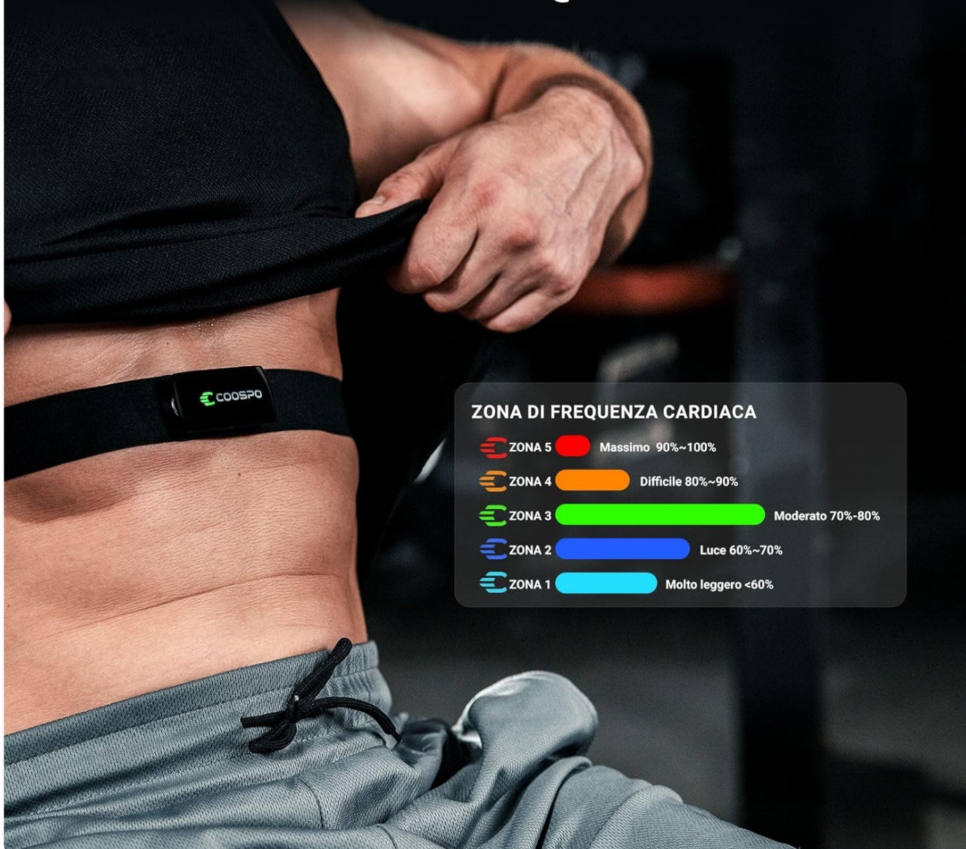
Image: Illustration of the COOSPO H9Z's heart rate zone function, showing how the LED color changes based on training intensity.