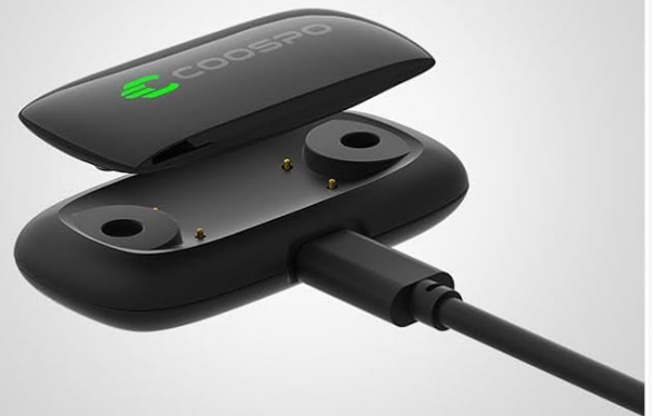
Image: Visual representation of the COOSPO H9Z's IP67 waterproof rating and its rechargeable battery feature.

*Per la ricarica utilizzare un adattatore di alimentazione da DC 5V o la porta USB del computer.