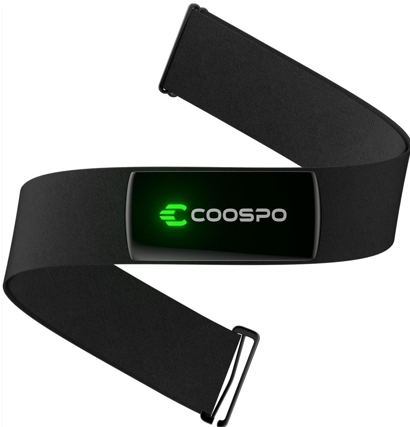
Image: The COOSPO H9Z Heart Rate Monitor, illustrating the sensor attached to the chest strap, ready for use.