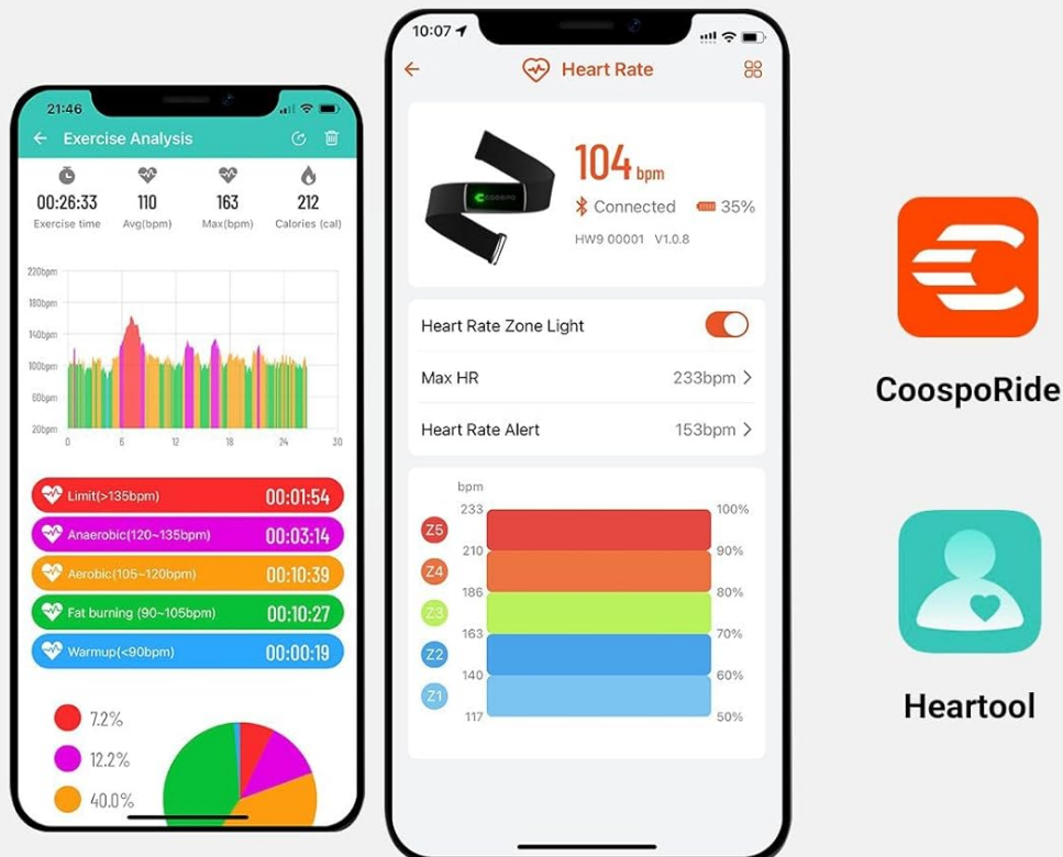
Image: Screenshots demonstrating the user interface of the Coosporide and Heartool apps, showing how they support the COOSPO H9Z.

È possibile impostare la vibrazione e la funzione LED tramite l'app coosporide.