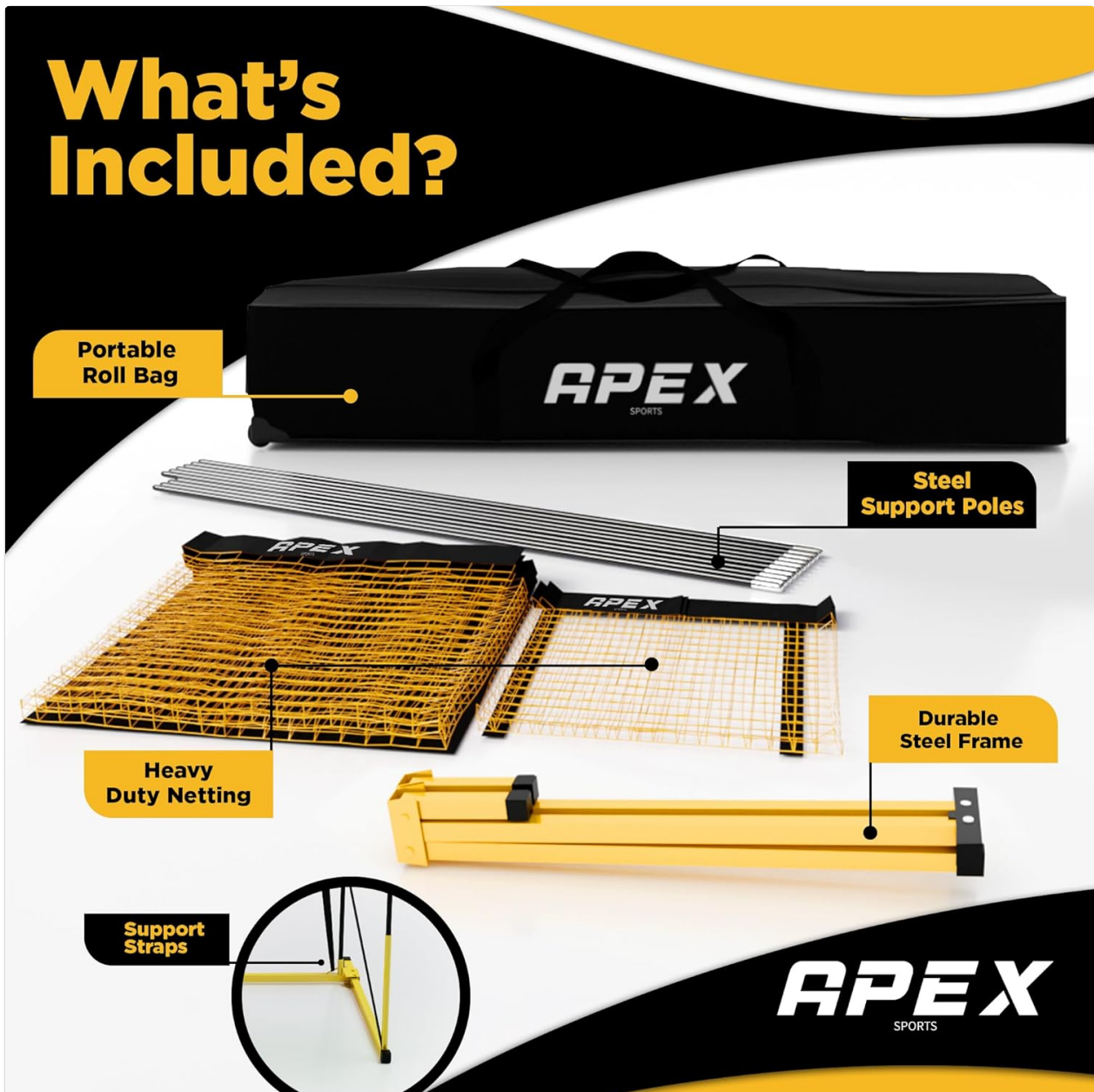
Image 3.1: All components included in the Apex Sports Volleyball Training Net System package. This includes the portable roll bag, steel support poles, heavy-duty netting, durable steel frame, and support straps.