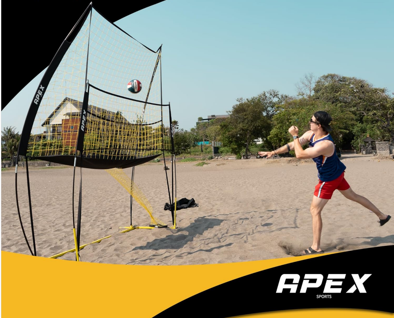
Image 5.2: A man practices spiking a volleyball into the Apex Sports Training Net System on a beach, showcasing the net's ability to handle powerful hits and its suitability for various training scenarios.

Leave the competition in the rearview & never miss a spike again!