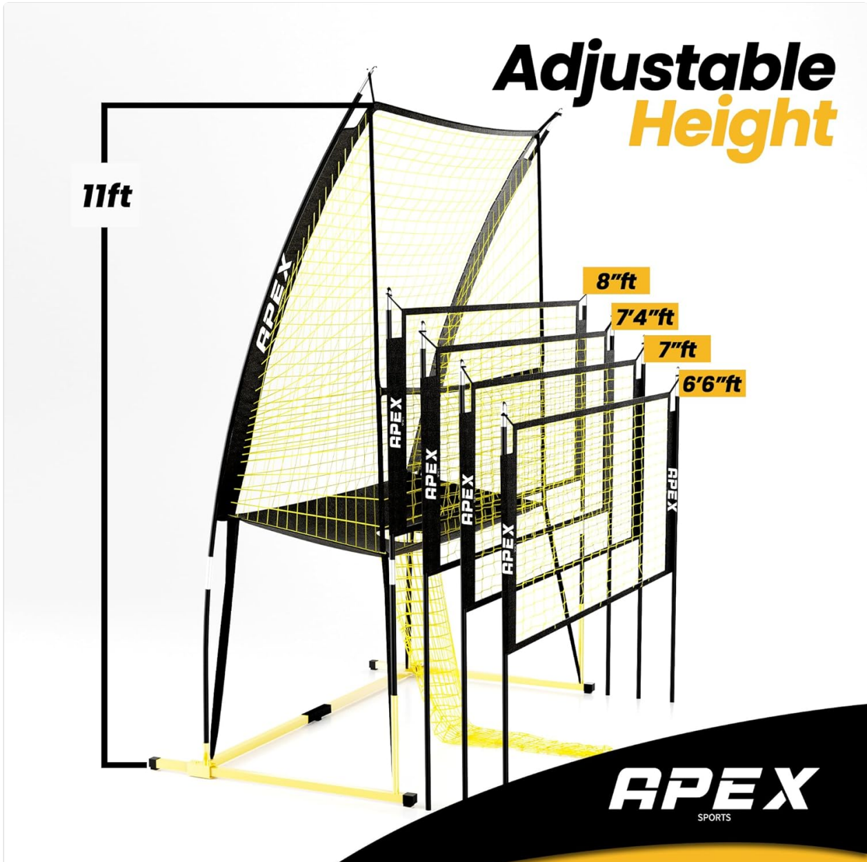
Image 4.1: The adjustable height mechanism allows for training at 8 feet, 7 feet 4 inches, and 6 feet 6 inches, catering to different skill levels and practice needs.

Your browser does not support the video tag.