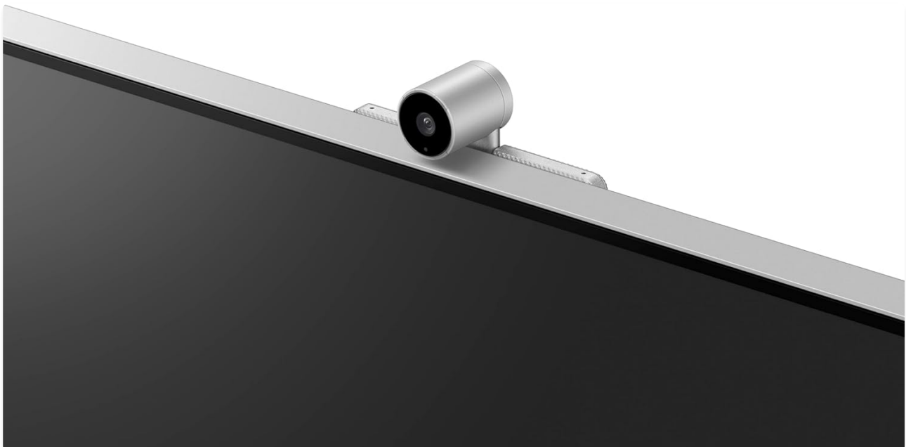
Figure 2: Close-up of the detachable 4K SlimFit Camera magnetically attached to the top of the monitor.

The 4K SlimFit Camera magnetically attaches to the top center of the monitor. It can be tilted up and down to adjust the viewing angle.