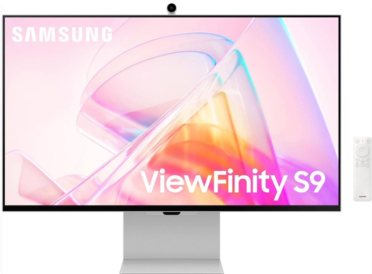
Figure 1: Front view of the Samsung ViewFinity S9 Monitor with its stand and remote control.

The 4K SlimFit Camera magnetically attaches to the top center of the monitor. It can be tilted up and down to adjust the viewing angle.