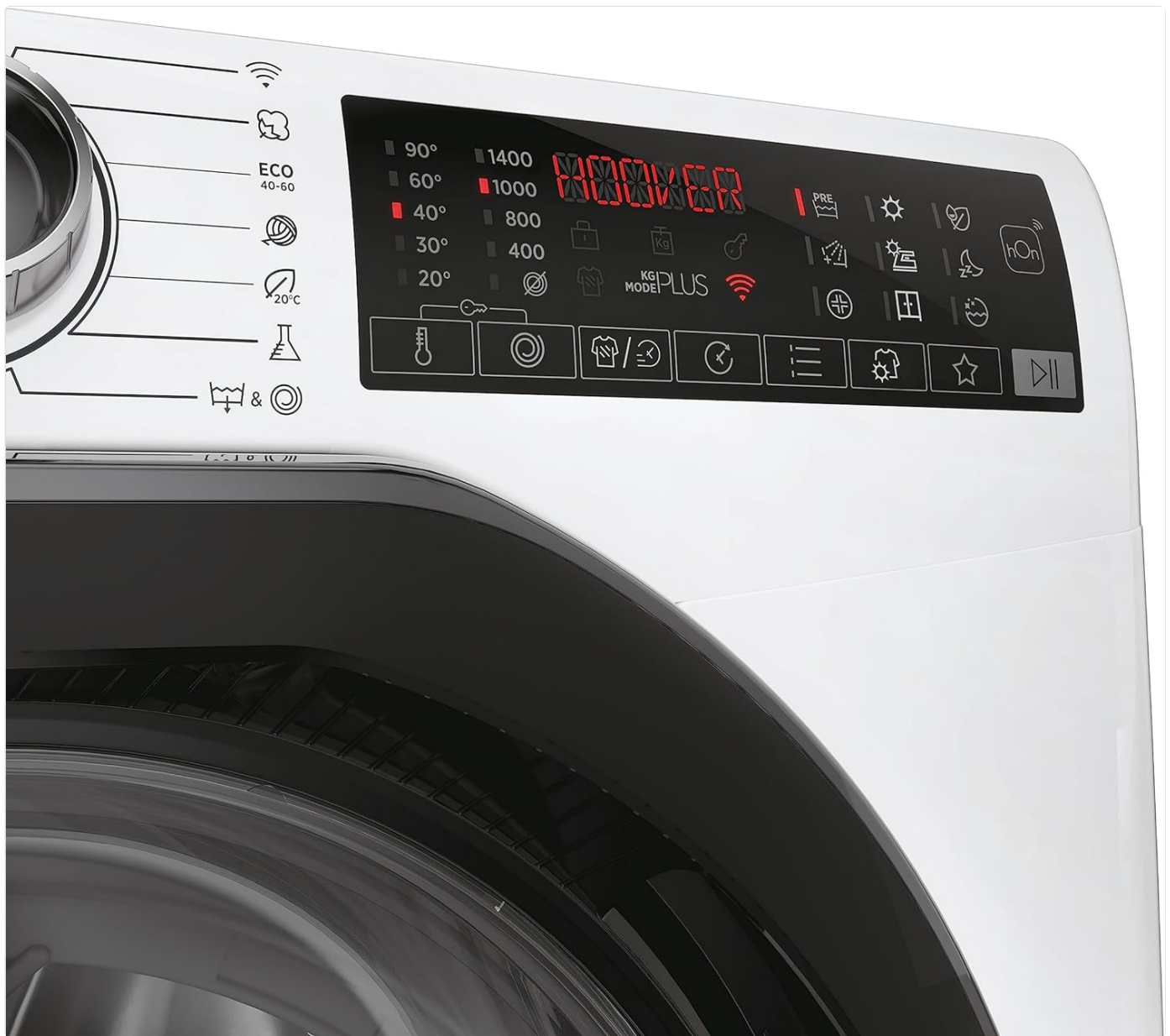
Figure 4.1: Close-up of the digital touch display and program selector dial. The display shows program information and remaining time, while the dial allows selection of various wash and dry cycles.

The appliance features a large digital touch display and a program selector dial. Use the dial to choose your desired program and the touch display for additional options and settings.