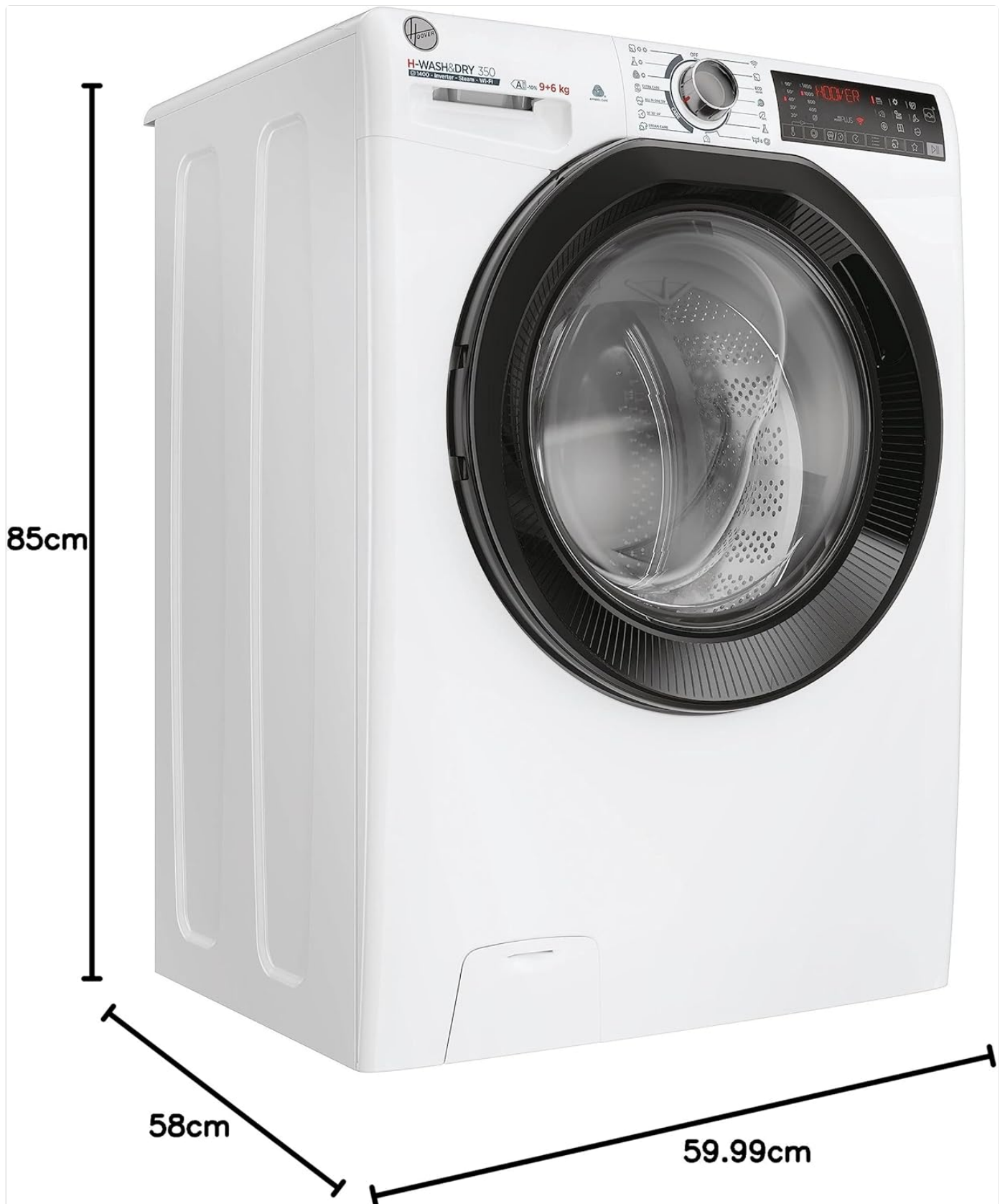
Figure 3.1: Product dimensions for installation planning. The appliance measures 85 cm (height) x 60 cm (width) x 58 cm (depth).