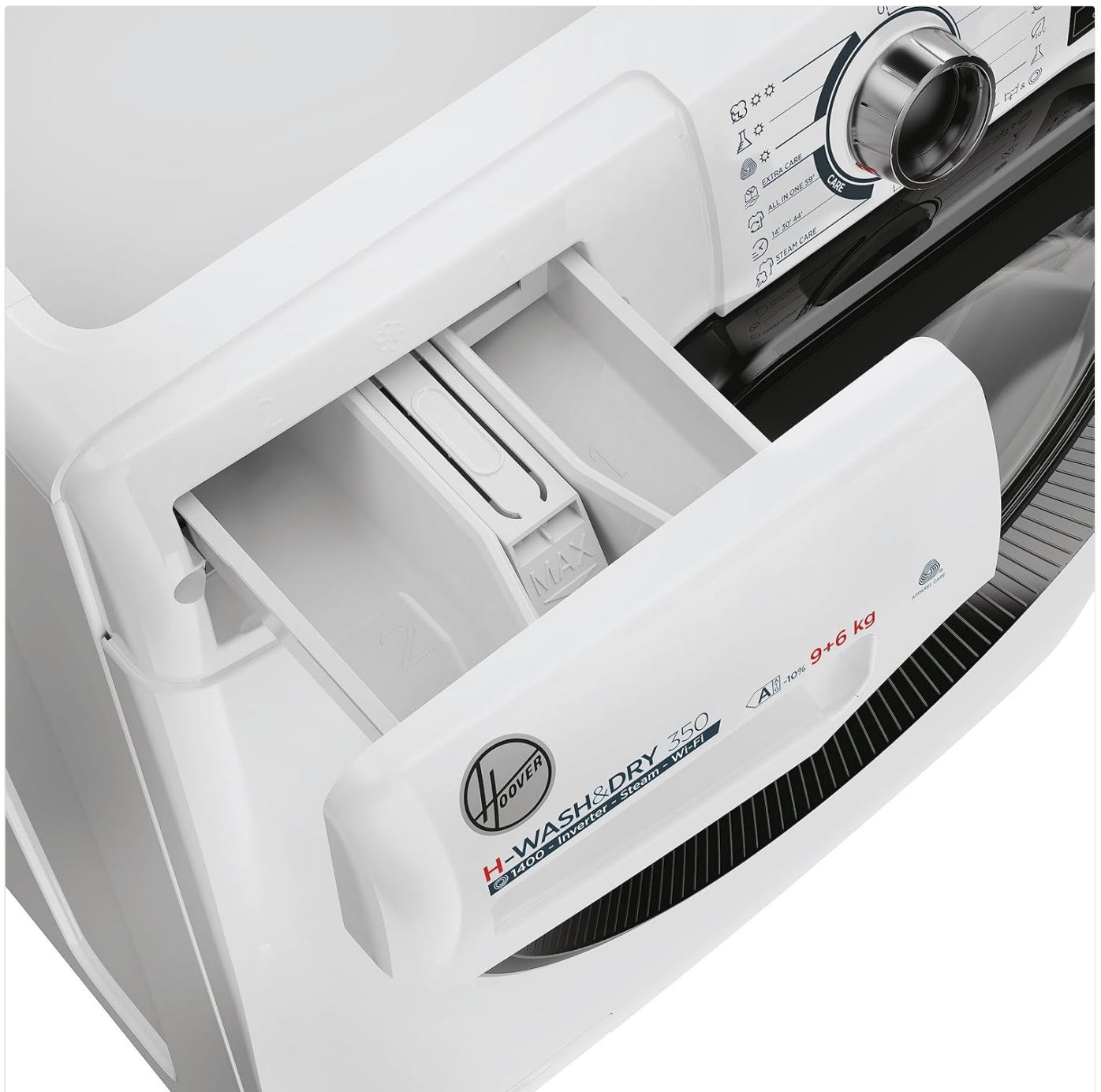
Figure 4.3: The detergent dispenser drawer, clearly showing compartments for detergent and additives. The drawer slides out for easy filling.

Pull out the detergent dispenser drawer. Add the appropriate amount of detergent to the main wash compartment and any fabric softener or pre-wash additives to their respective compartments. The appliance features a dual-compartment dispenser.