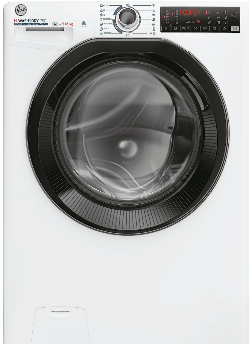
Figure 1.1: The Hoover H-WASH&DRY 350 H3DPS4966TAMB6-S washer dryer, a combined laundry appliance.

Welcome to the instruction manual for your new Hoover H-WASH&DRY 350 H3DPS4966TAMB6-S washer dryer. This appliance is designed to provide efficient and versatile solutions for your washing and drying needs. With a washing capacity of 9 kg and a drying capacity of 6 kg, it can handle large laundry loads. Key features include the Active Steam function for refreshing clothes and simplifying ironing, a BPM Inverter ECO-Power motor for quiet and efficient operation, the Mix-Power System, and smart functionality via WiFi and Bluetooth through the hOn app.