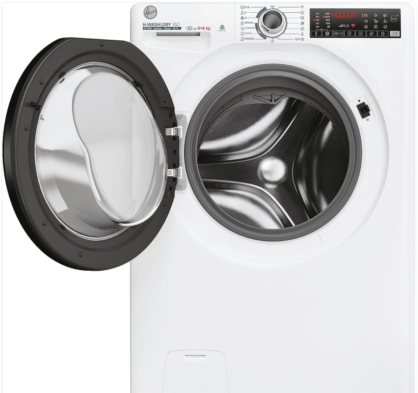
Figure 4.2: The washer dryer with its door open, revealing the spacious drum for loading laundry. The door opens wide for easy access.

Open the door and load your laundry into the drum. Do not overload the machine. For optimal results, ensure there is enough space for clothes to tumble freely. The maximum wash capacity is 9 kg, and the maximum dry capacity is 6 kg.