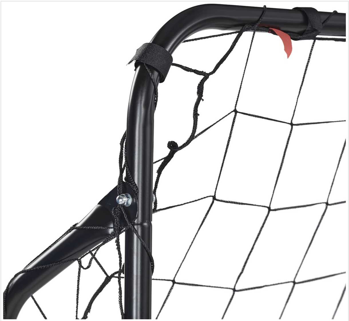
Image 4.1: Detail of how the net is attached to the goal frame using Velcro straps.