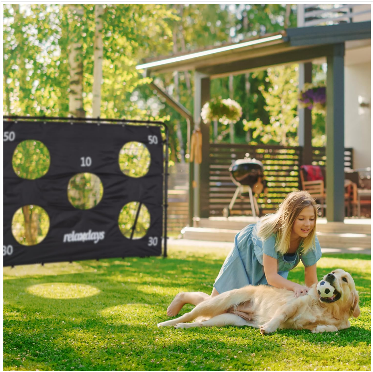
Image 5.2: The target wall provides an engaging way to practice shooting skills.