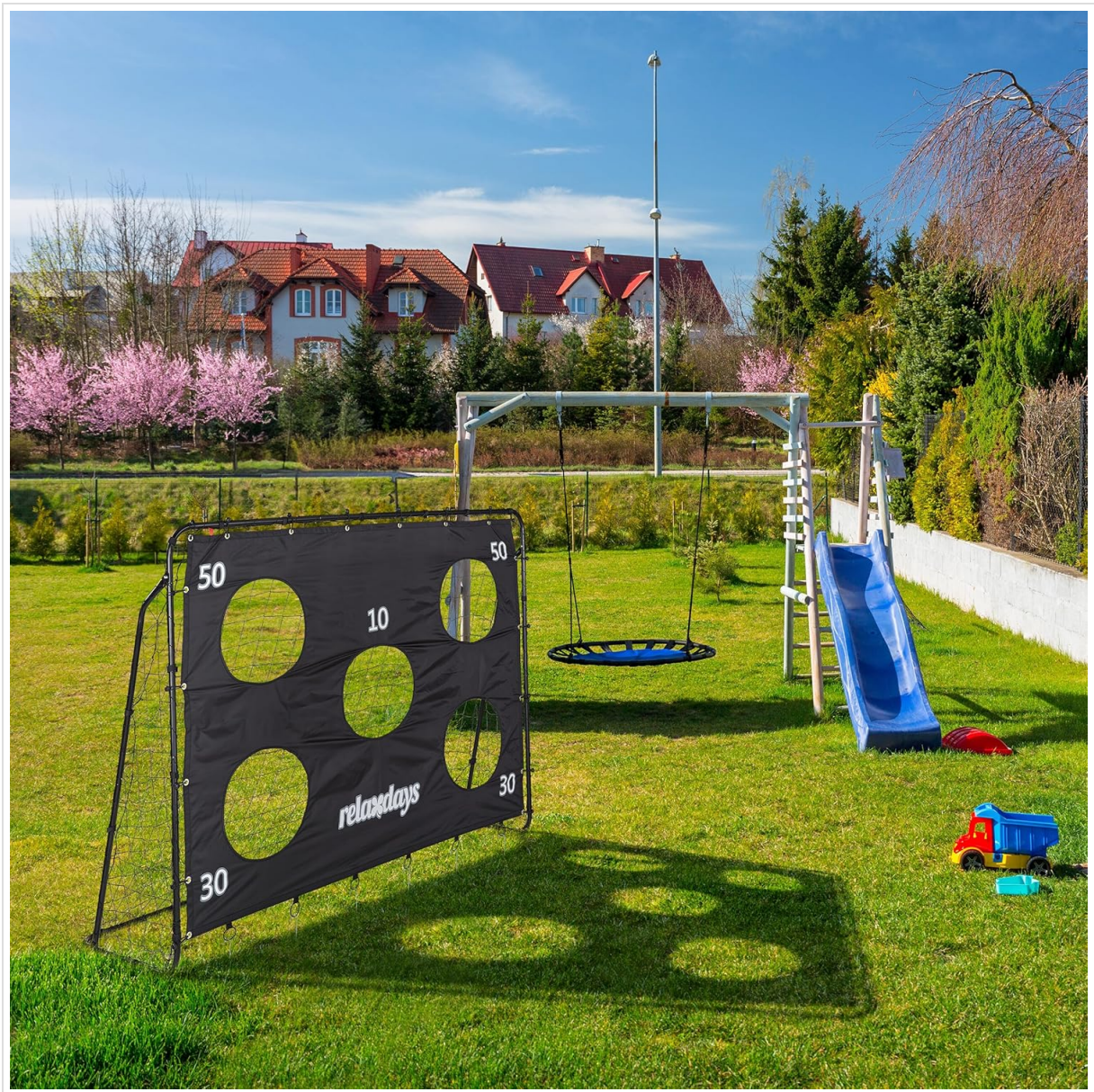
Image 1.1: The Relaxdays Football Goal with Target Wall in a garden setting, ready for use.