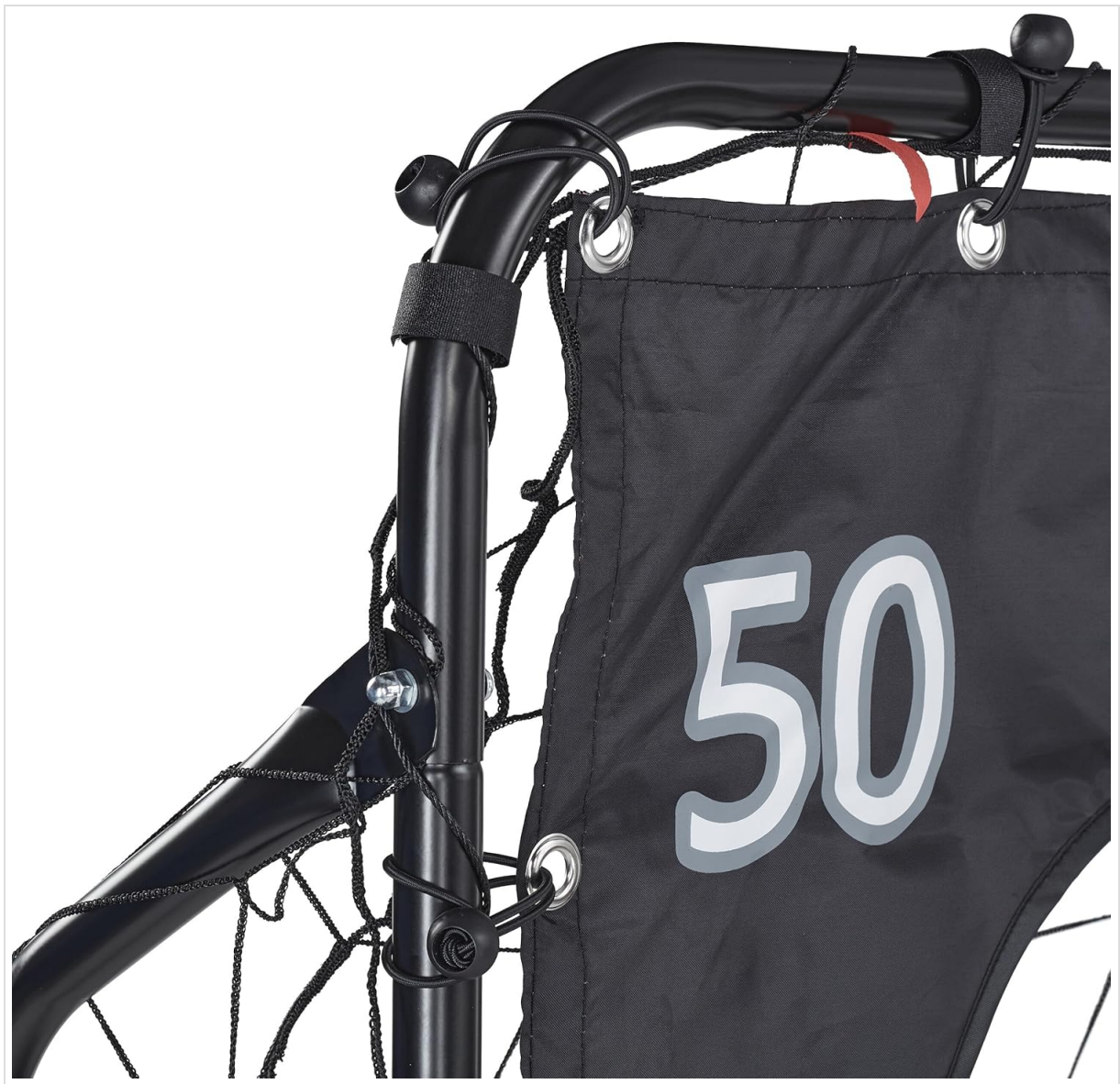
Image 4.2: Detail of how the target wall is attached to the goal frame.