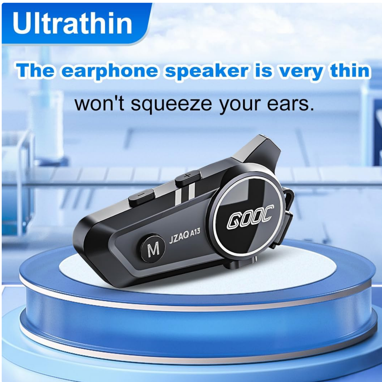
Image 5.1: The JZAQ A13 provides clear music playback with noise reduction.

After successful Bluetooth pairing, you can play music from your connected device. The system features Hi-Fi stereo sound and DSP noise reduction technology for clear audio.