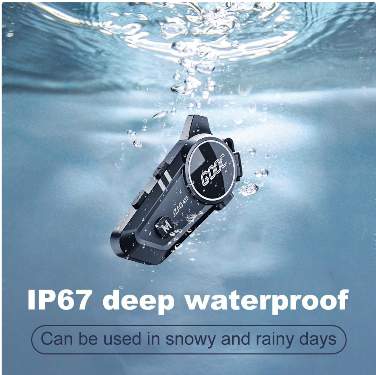
Image 6.1: The JZAQ A13 demonstrating its IP67 deep waterproof capability.

The JZAQ A13 features IPX67 deep waterproof technology with Nano coating, making it suitable for use in rainy or snowy conditions and capable of operating in temperatures as low as -20°F.