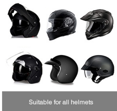
Image 4.2: Examples of various helmet types compatible with the JZAQ A13.

The JZAQ A13 is designed to be compatible with various helmet types. The speakers are ultra-thin (10mm) to ensure comfort and avoid ear pressure.