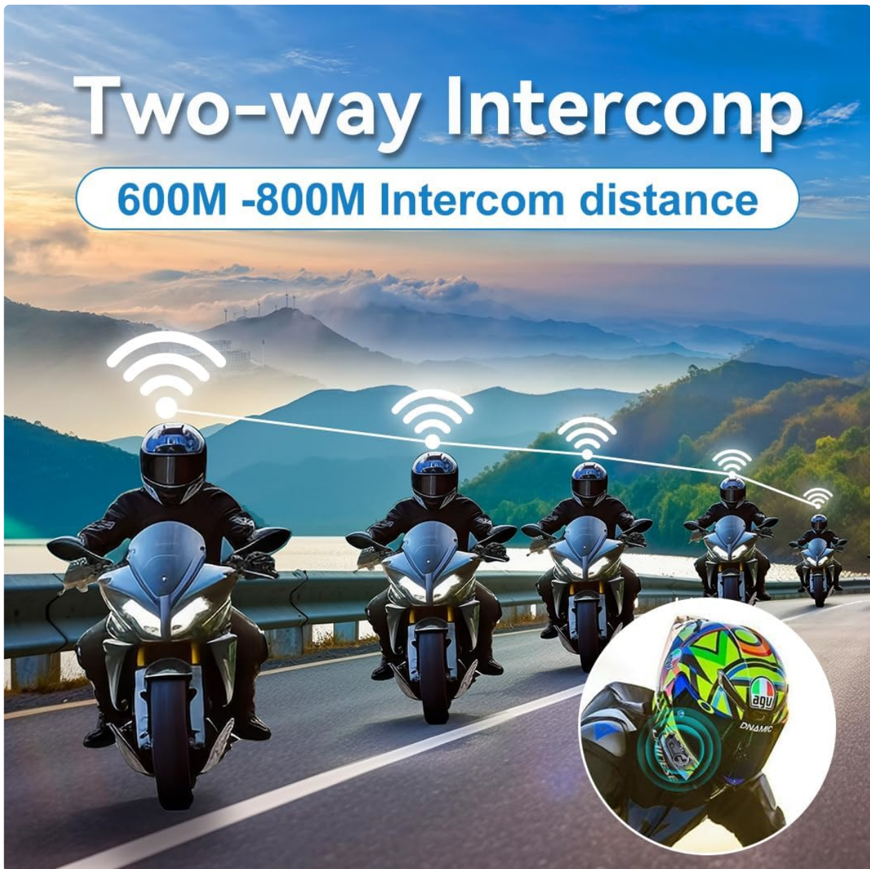
Image 5.2: Illustration of two-way intercom communication between riders.

The JZAQ A13 supports two-way intercom communication between two riders within a range of up to 200 meters. The universal pairing function allows connection with other compatible intercom systems.