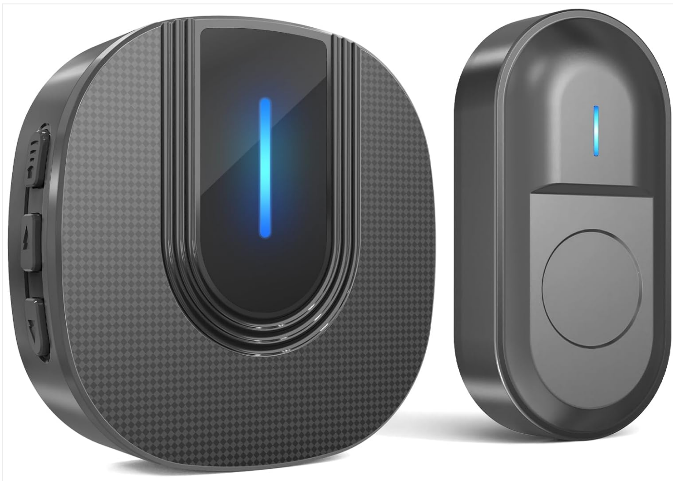
Image: A close-up view of the SURFOU Wireless Doorbell Model N9, showing both the plug-in receiver and the battery-operated transmitter. Both units are black with a textured finish and feature a blue LED indicator light.