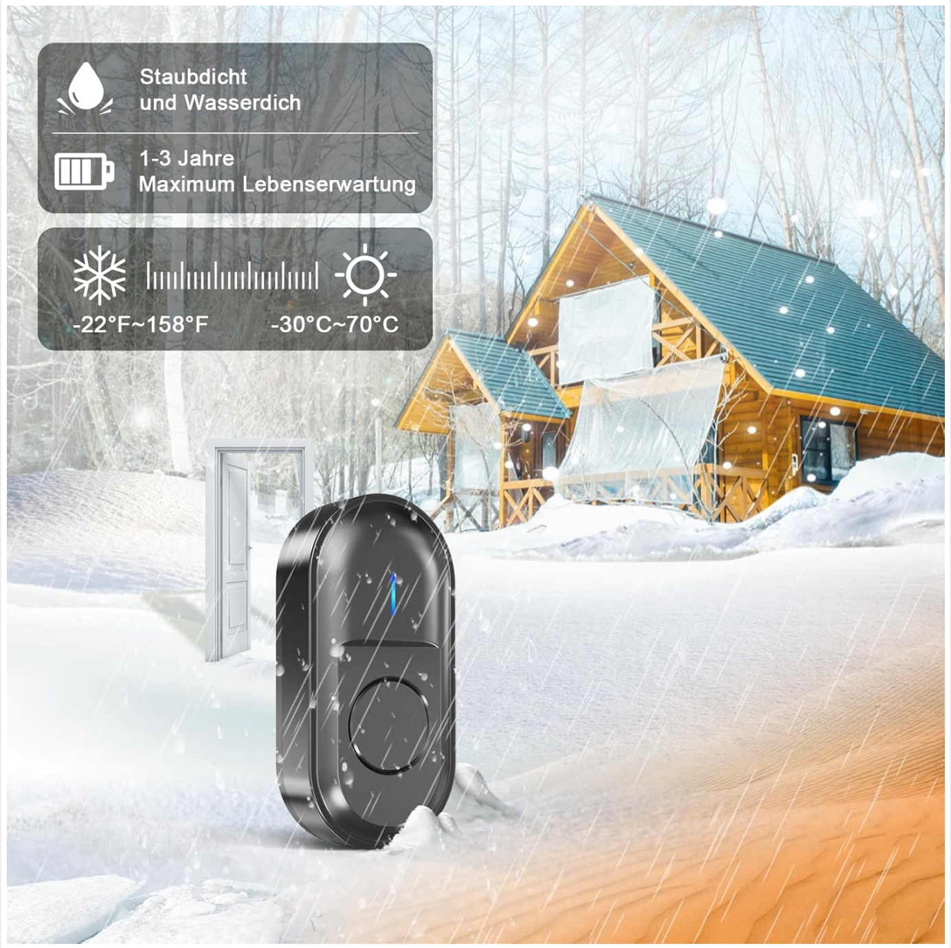
Image: The SURFOU Wireless Doorbell transmitter is depicted outdoors in both snowy and rainy weather, emphasizing its IP55 dustproof and waterproof rating. The image also displays its operational temperature range of -30°C to 70°C (-22°F to 158°F) and a battery life of 1-3 years.

The transmitter is IP55 dustproof and waterproof, designed to withstand various weather conditions. It operates reliably in temperatures ranging from -30°C to 70°C (-22°F to 158°F).