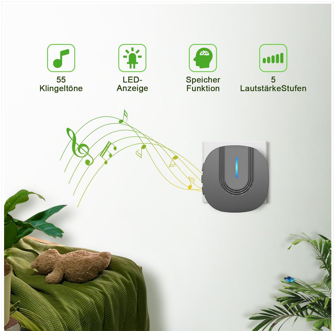
Image: The SURFOU Wireless Doorbell receiver plugged into a wall outlet, with icons indicating 55 chimes, an LED display, a memory function for settings, and 5 adjustable volume levels. Musical notes emanate from the receiver, suggesting sound output.

Press the Chime Selection Button on the side of the receiver to cycle through the 55 available melodies. Stop pressing when you hear your preferred chime. The doorbell will remember your last selected chime even after a power outage.