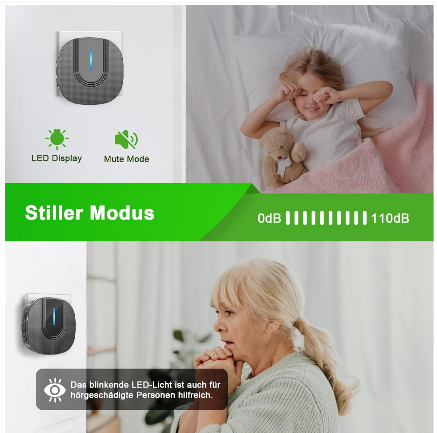
Image: The SURFOU Wireless Doorbell receiver is shown with its LED display active in mute mode. Below, an elderly person is depicted, highlighting how the blinking LED light can be helpful for individuals with hearing impairments.

for individuals with hearing impairments.