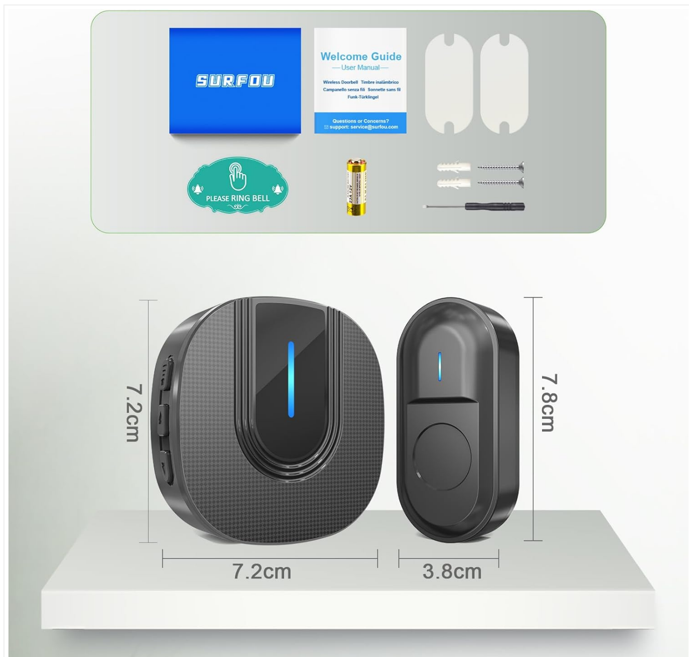
Image: Contents of the SURFOU Wireless Doorbell package, including the receiver, transmitter, battery, screwdriver, screws, adhesive tapes, and user manual. The image also displays the dimensions of the receiver (7.2cm x 7.2cm) and transmitter (7.8cm x 3.8cm).