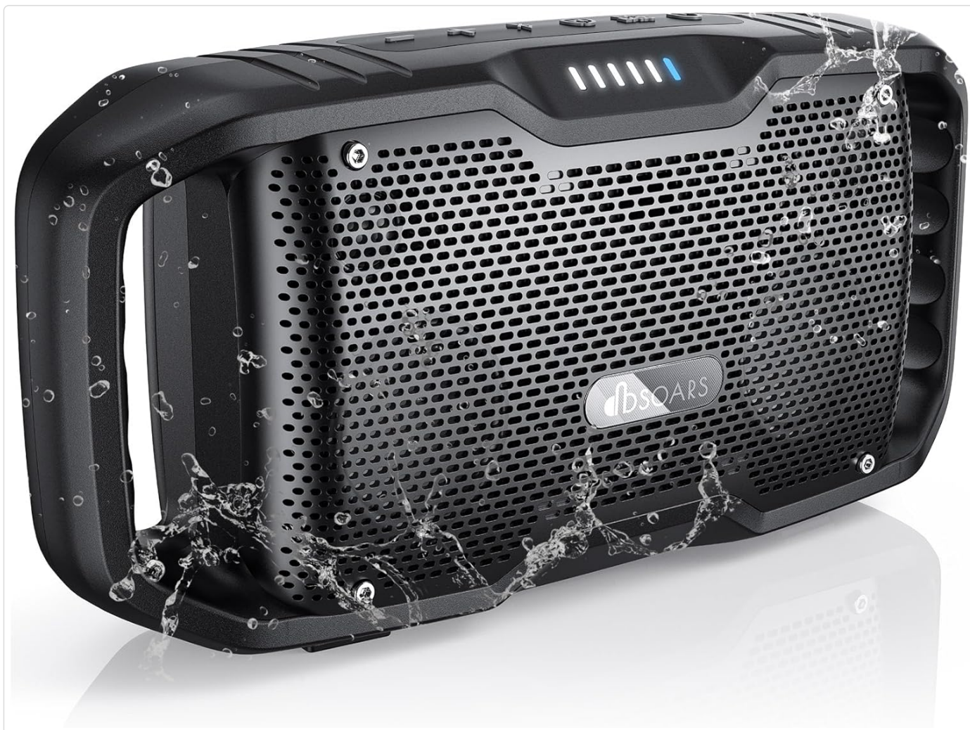
Image: The DBSOARS F2 MAX Bluetooth Speaker, showcasing its rugged design and water-resistant features.