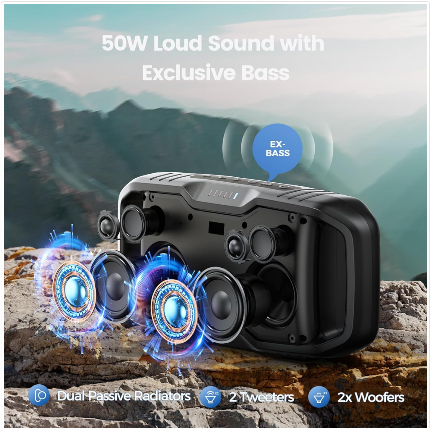
Image: An exploded view of the speaker's internal components, highlighting the dual tweeters, dual subwoofers, and dual passive radiators, along with the EX-BASS feature.