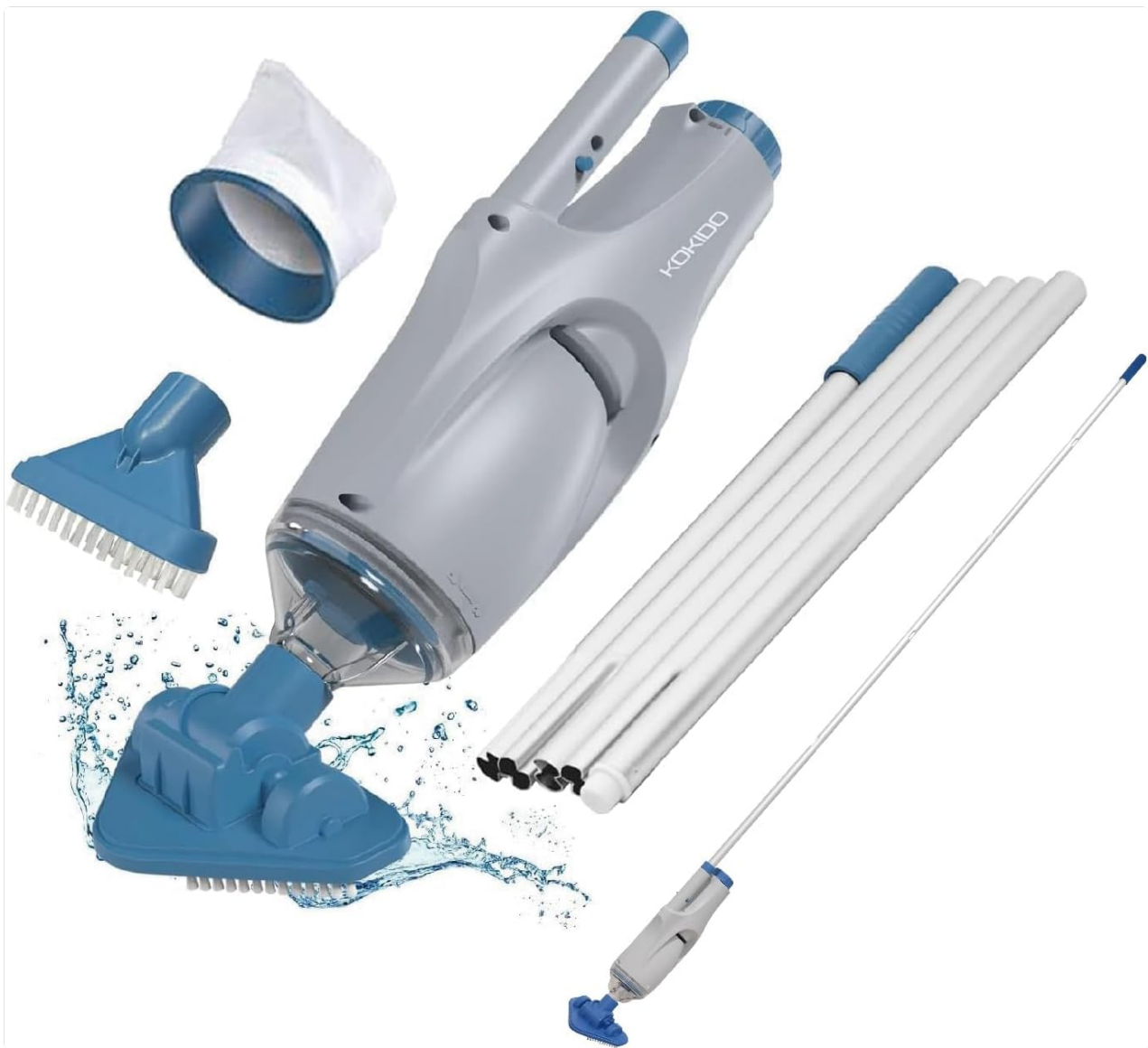
Figure 1.1: KOKIDO XTROVAC 110 Handheld Pool Vacuum with included accessories.