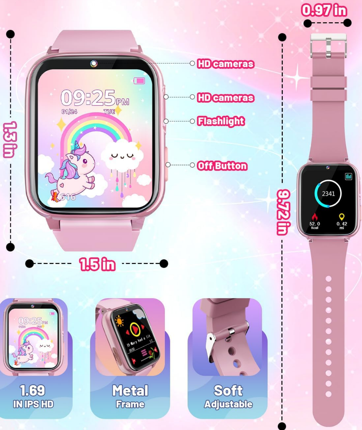
Image: Detailed diagram showing the dimensions of the watch and highlighting key components like HD cameras, flashlight, and off button.