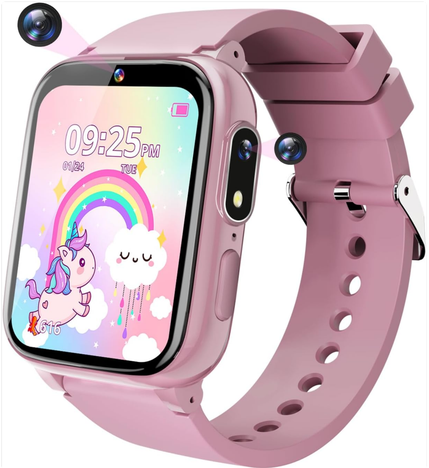
Image: The Gothwick Smart Watch for Kids in pink, showcasing its vibrant display and sleek design.