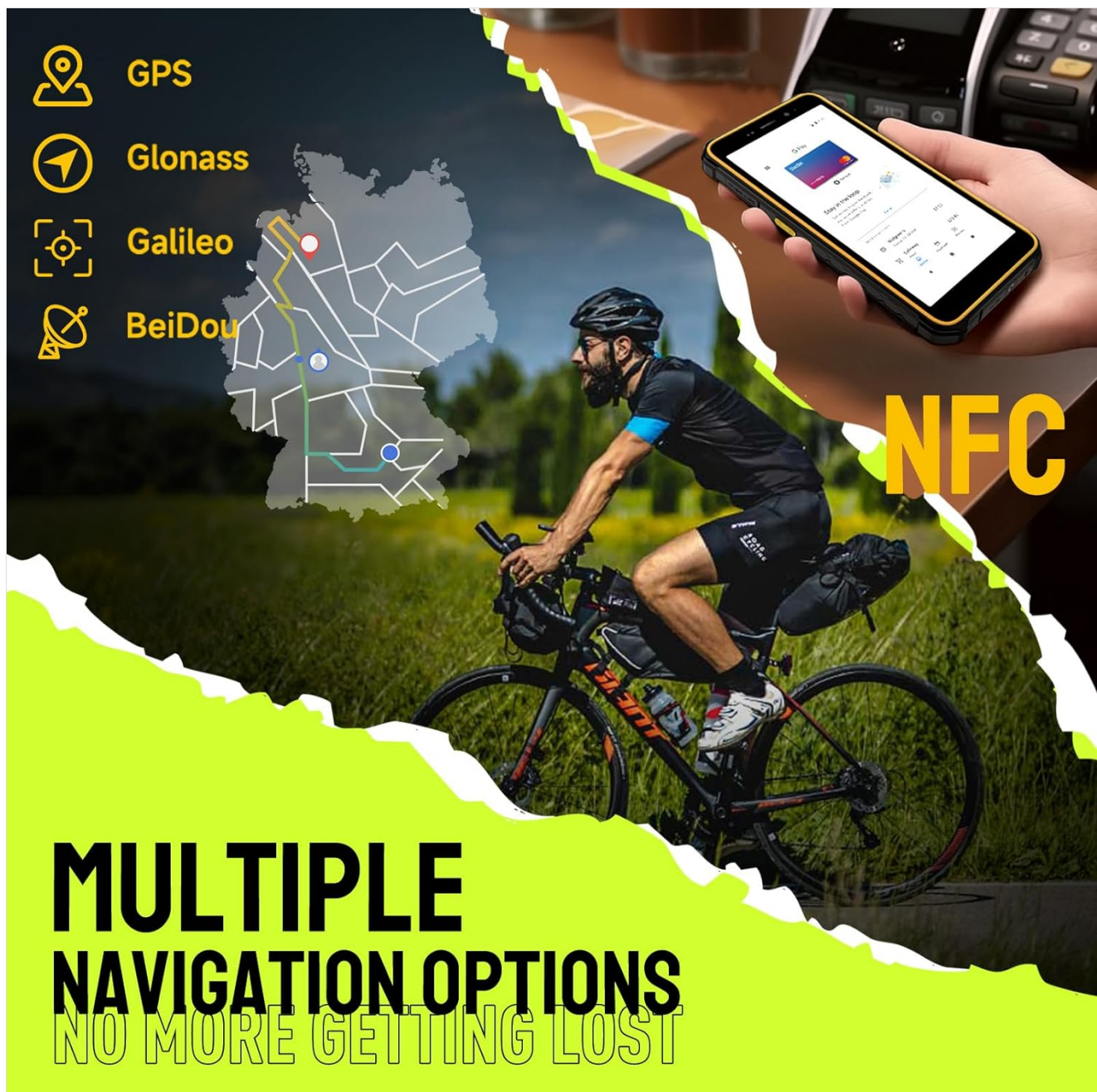
Image: A cyclist using the Ulefone Armor X12 Pro for navigation, showcasing its multi-system GPS support.