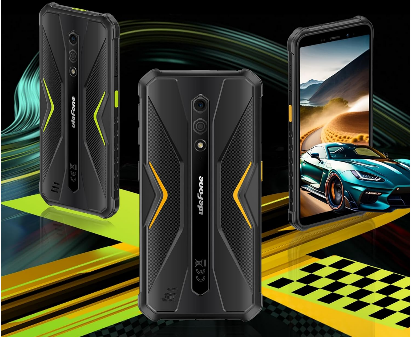
Image: The Ulefone Armor X12 Pro in a challenging environment, demonstrating its robust build and resistance to elements.