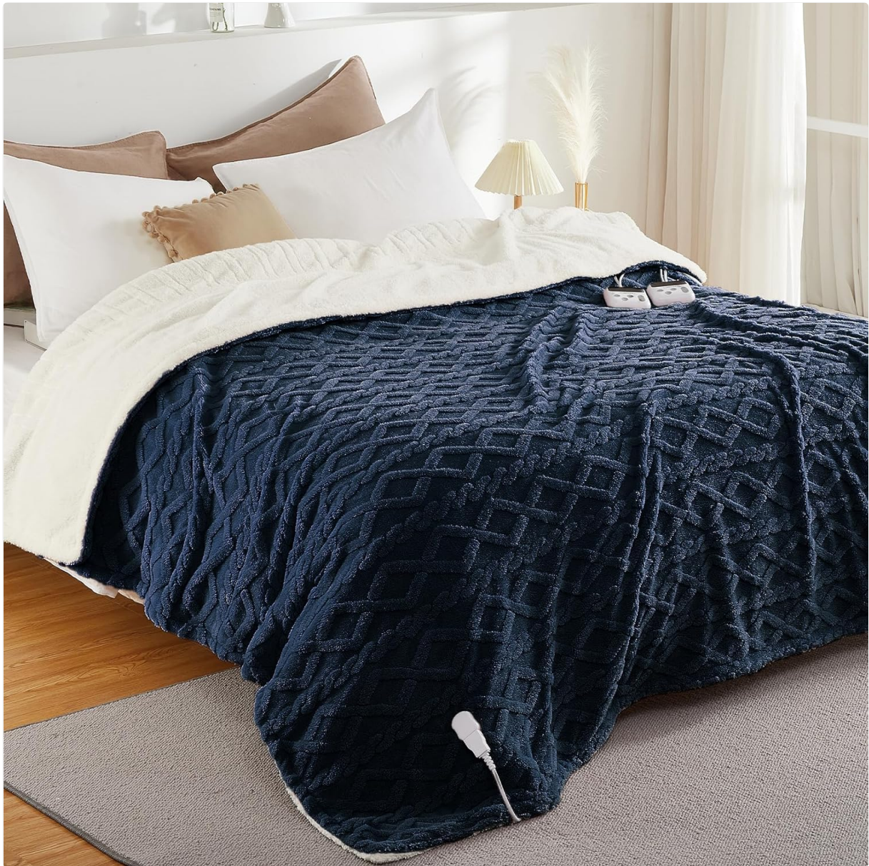
Figure 6: Overview of available sizes and cord lengths for CAROMIO electric blankets.