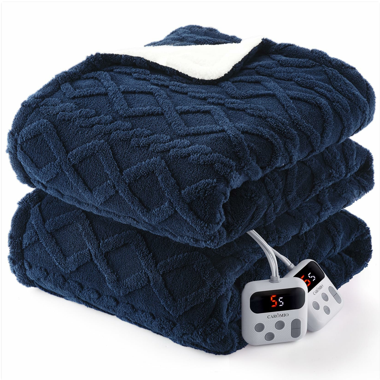
Figure 1: CARÓMIO Electric Blanket Queen Size in Navy Blue, showcasing its soft, warm, thick, and cozy features.