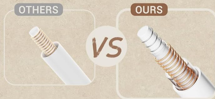
Figure 2: Internal structure of the CAROMIO Electric Blanket, highlighting the upgraded PTC/NTC heating wires for safety and fast heating.