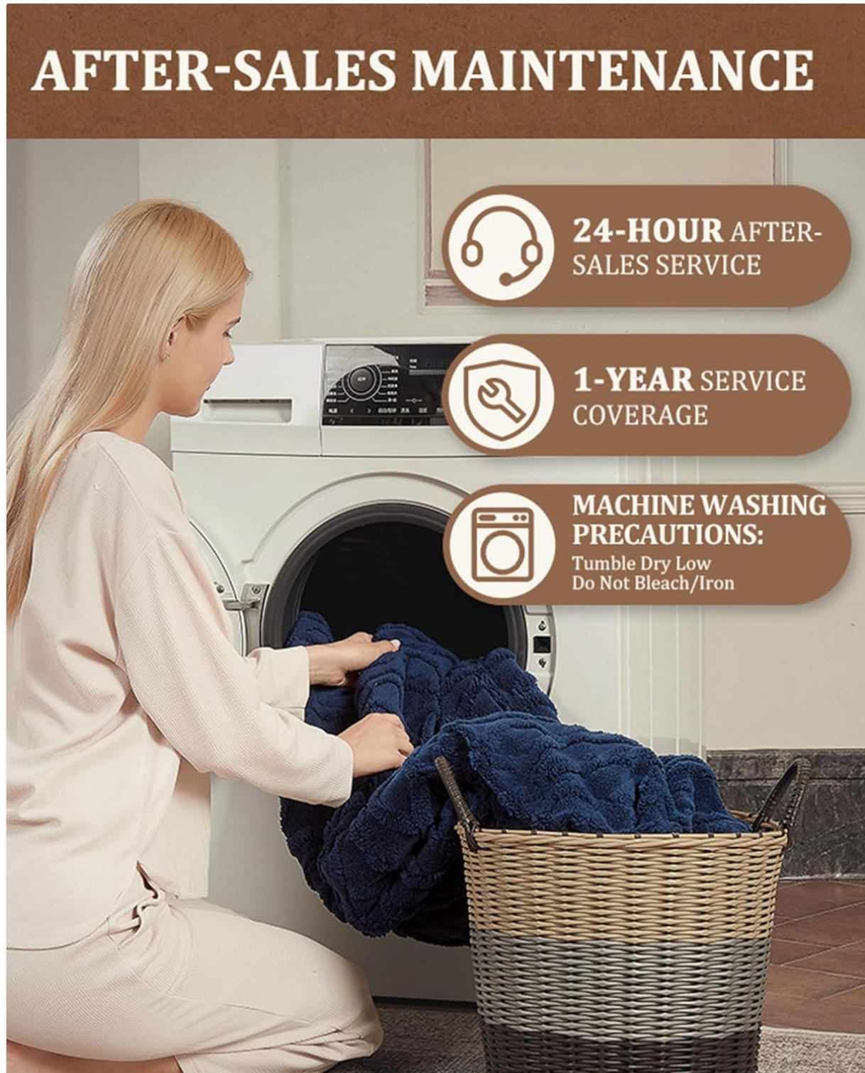
Figure 5: Instructions for machine washing the electric blanket after detaching the controller.