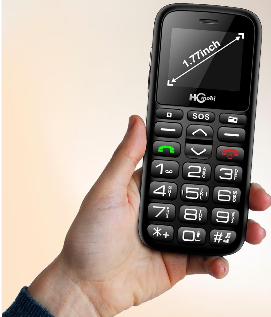
Figure 3.2: The compact design and 4G LTE network support ensure smooth and reliable communication.