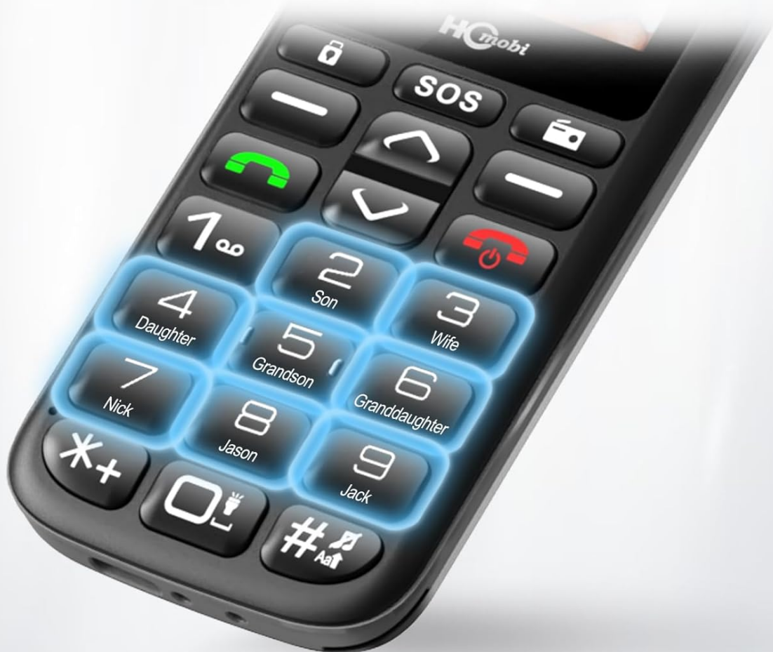
Figure 3.5: Easily set up 8 speed dial numbers for one-click calling to important contacts.