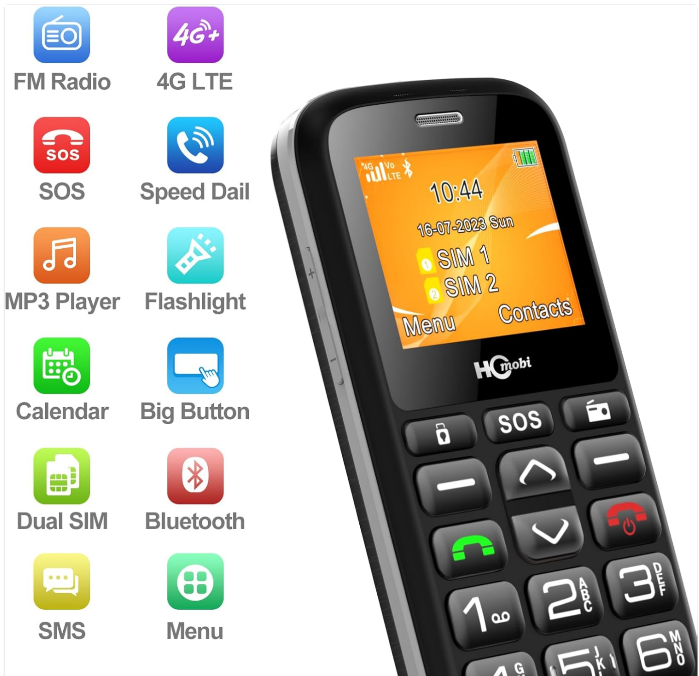
Figure 3.7: A comprehensive overview of the phone's features, including multimedia, connectivity, and accessibility options.