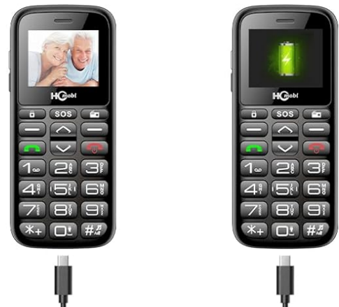
Figure 2.2: The phone can be charged conveniently using either the included charging dock or a standard Type-C USB cable.