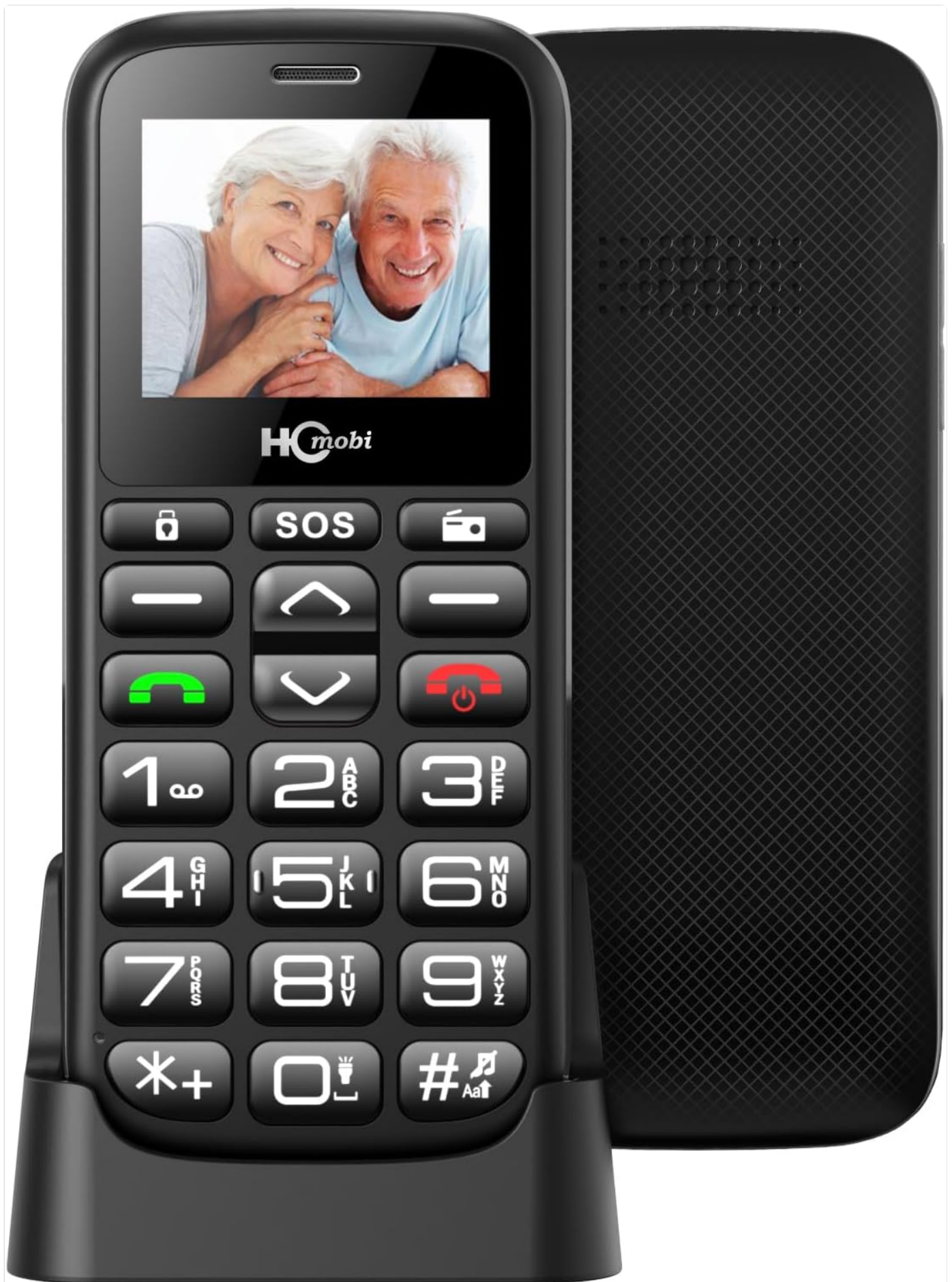
Figure 1.1: HCOMBI RS1 Big Button Mobile Phone with its charging dock.