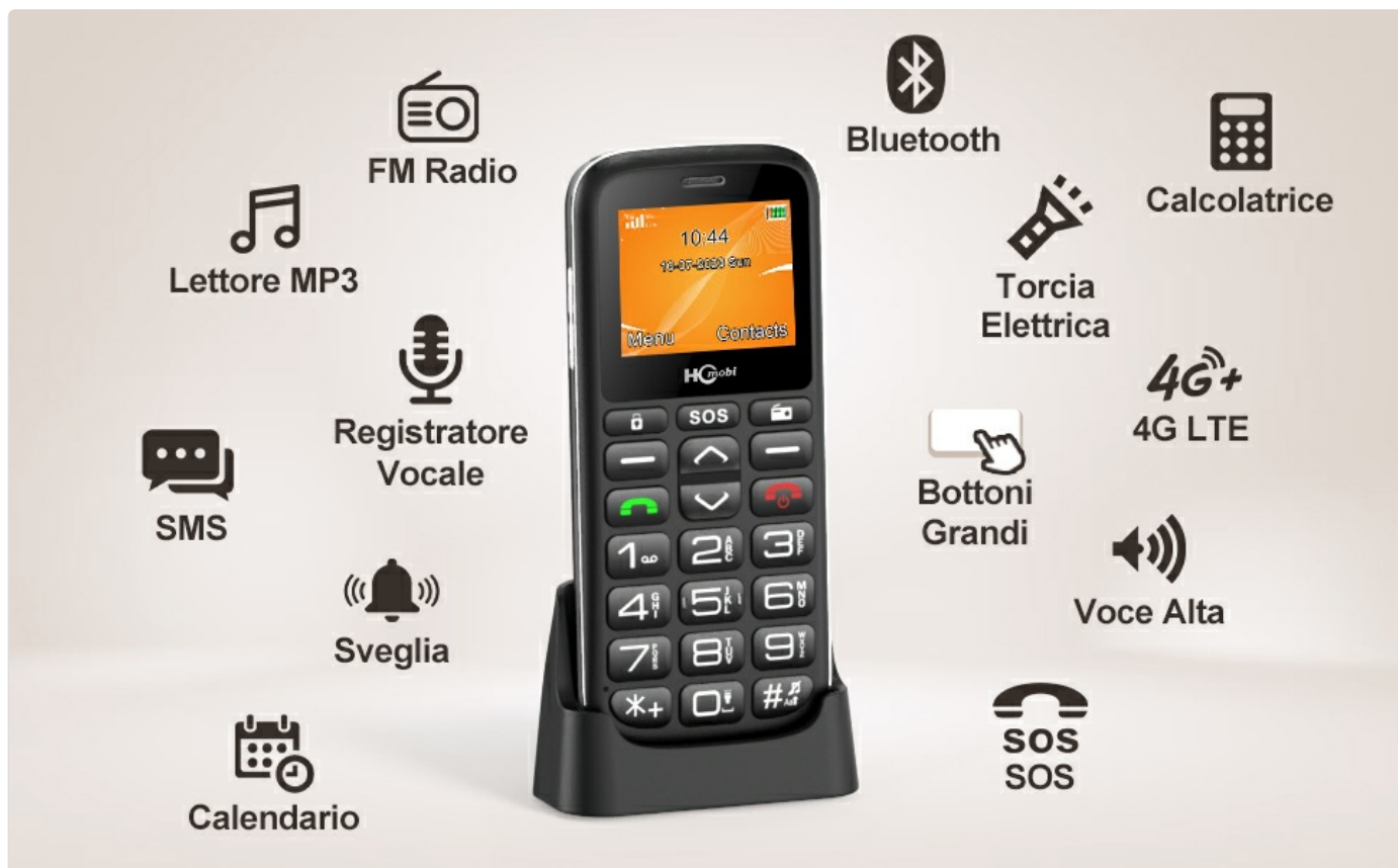
Figure 3.8: The phone offers a wide range of functionalities tailored for convenience and safety.