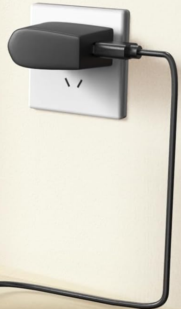
Figure 2.1: The phone supports Type-C charging and has a 1000mAh battery, offering up to 10 days standby.