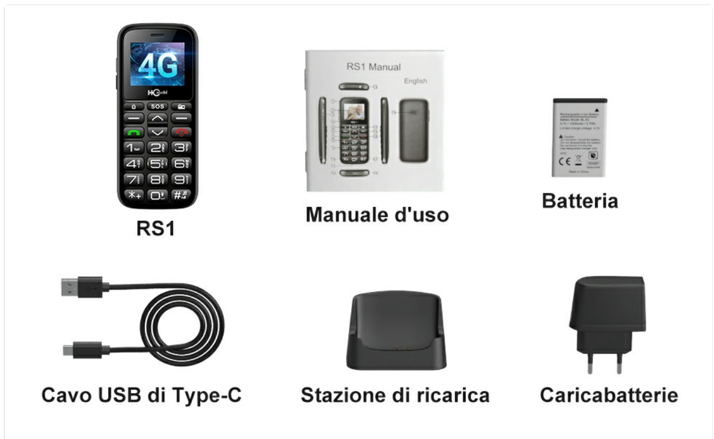
Figure 1.2: Package contents including the RS1 phone, user manual, battery, Type-C USB cable, charging dock, and charger.