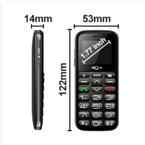
Figure 6.1: Approximate dimensions of the HCMOBI RS1 phone.