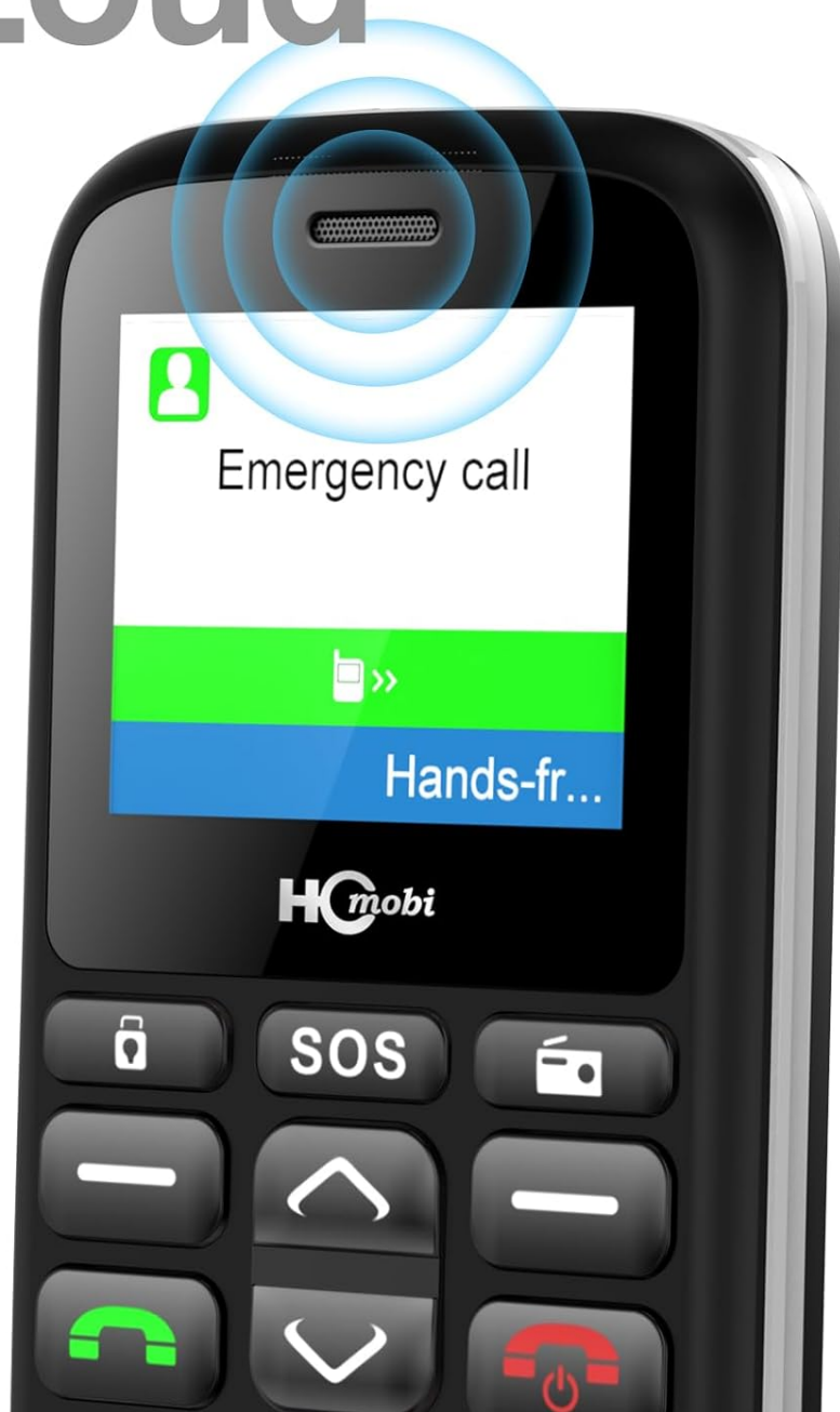
Figure 3.1: The HCOMBI RS1 provides clear and loud sound for calls, ensuring important conversations are heard.