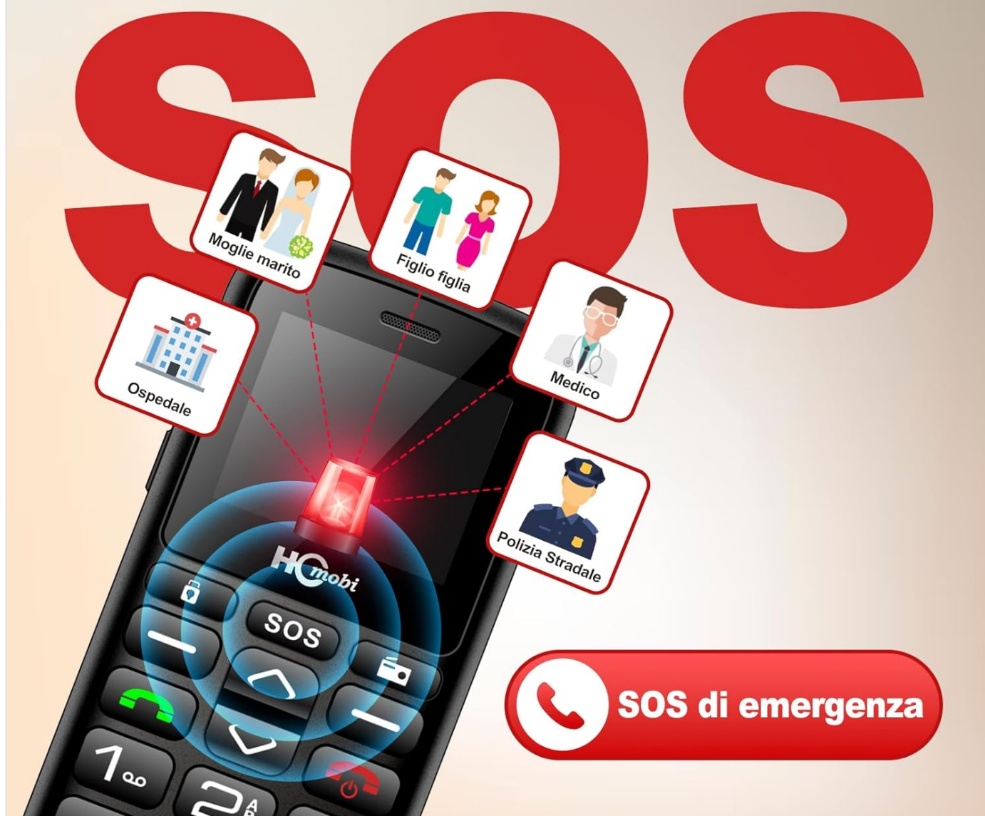
Figure 3.3: The SOS button provides one-touch access to emergency help, contacting pre-set numbers and sending alerts.