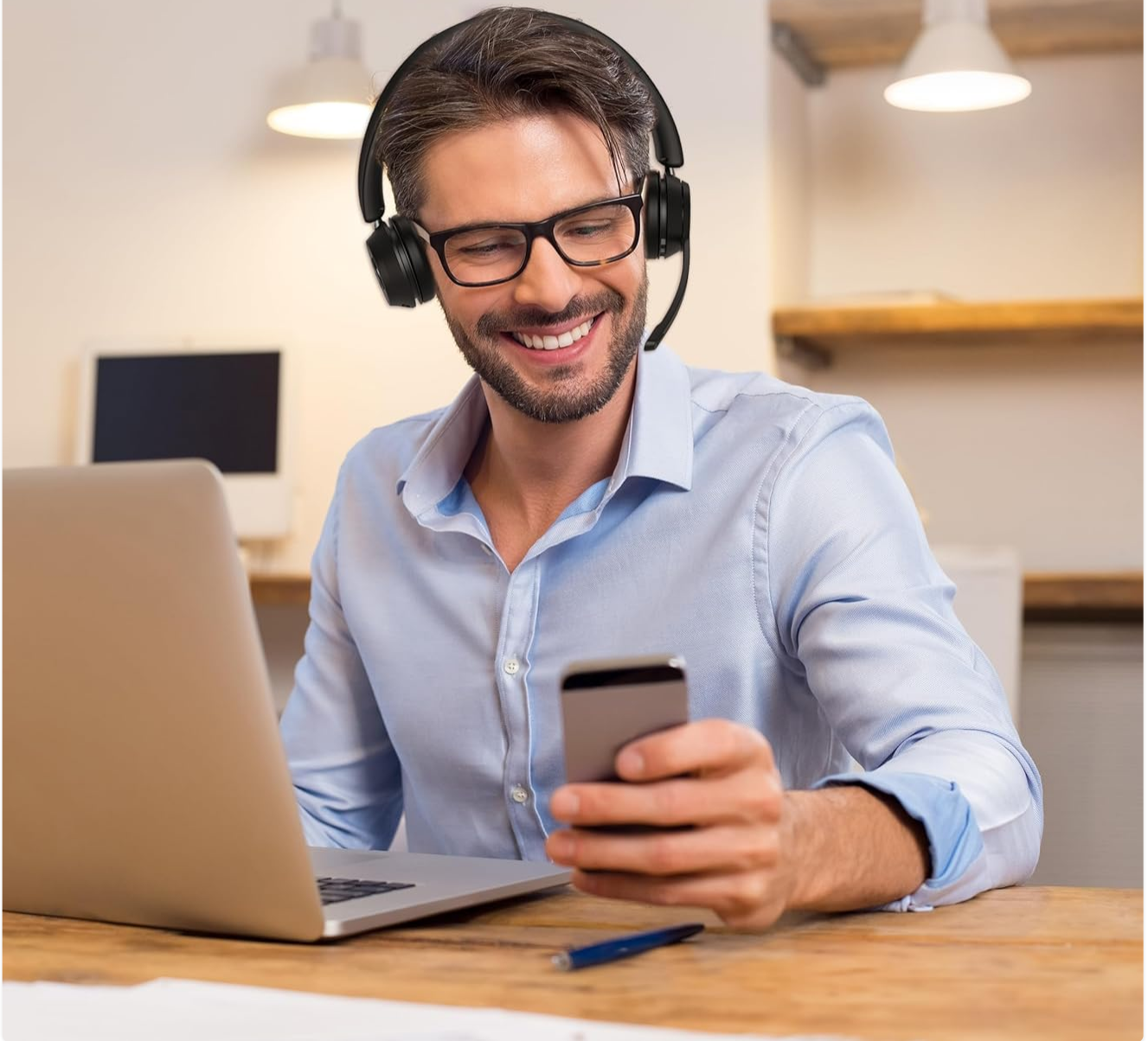
Figure 7: Dual Connectivity in Use

Connect with two Bluetooth devices at the same time, you can switch between computer and cell phone.