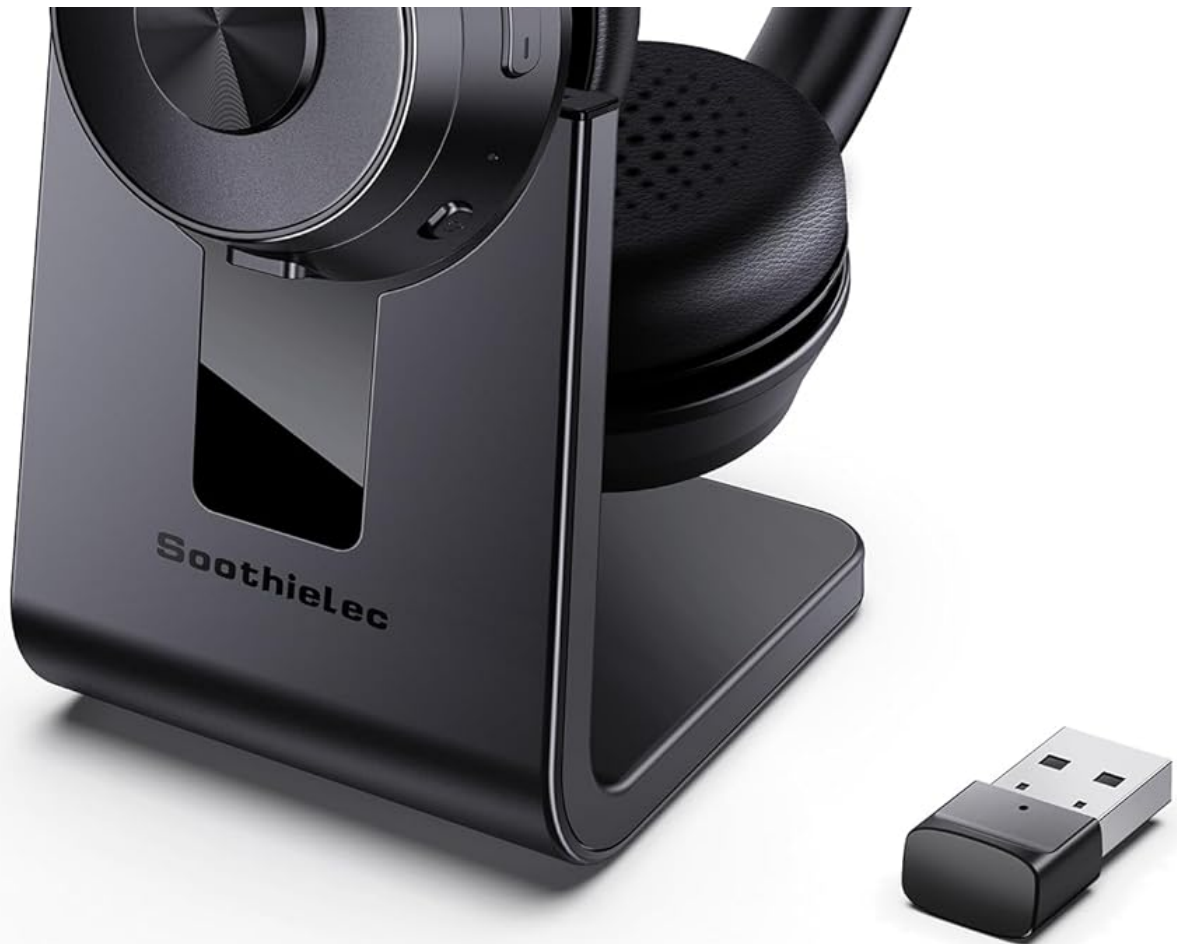
Figure 1: Soothielec KH53 Wireless Bluetooth Headset with Charging Stand