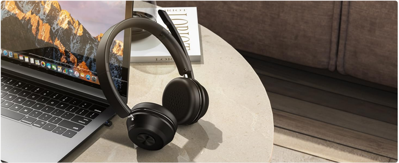
Figure 8: Mute Function in Action