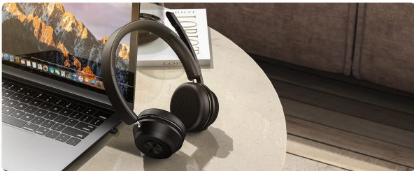
Figure 3: Microphone Mute Function