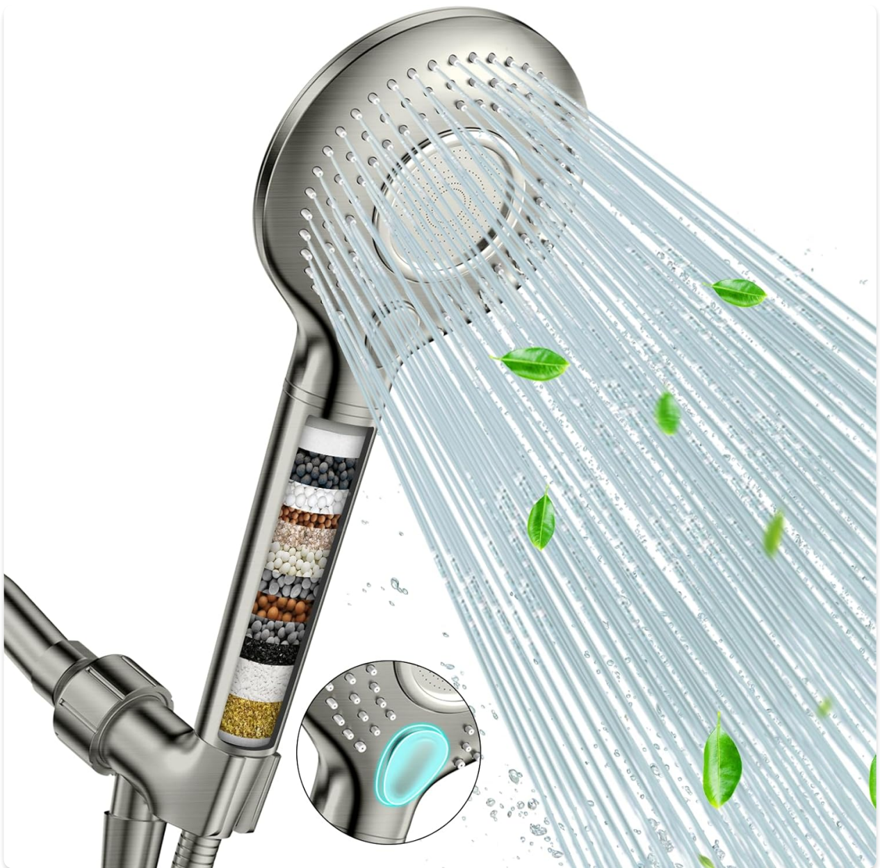
Image 1.1: The FEELSO Filtered Handheld Shower Head, showcasing its internal 15-stage filtration system and water output.