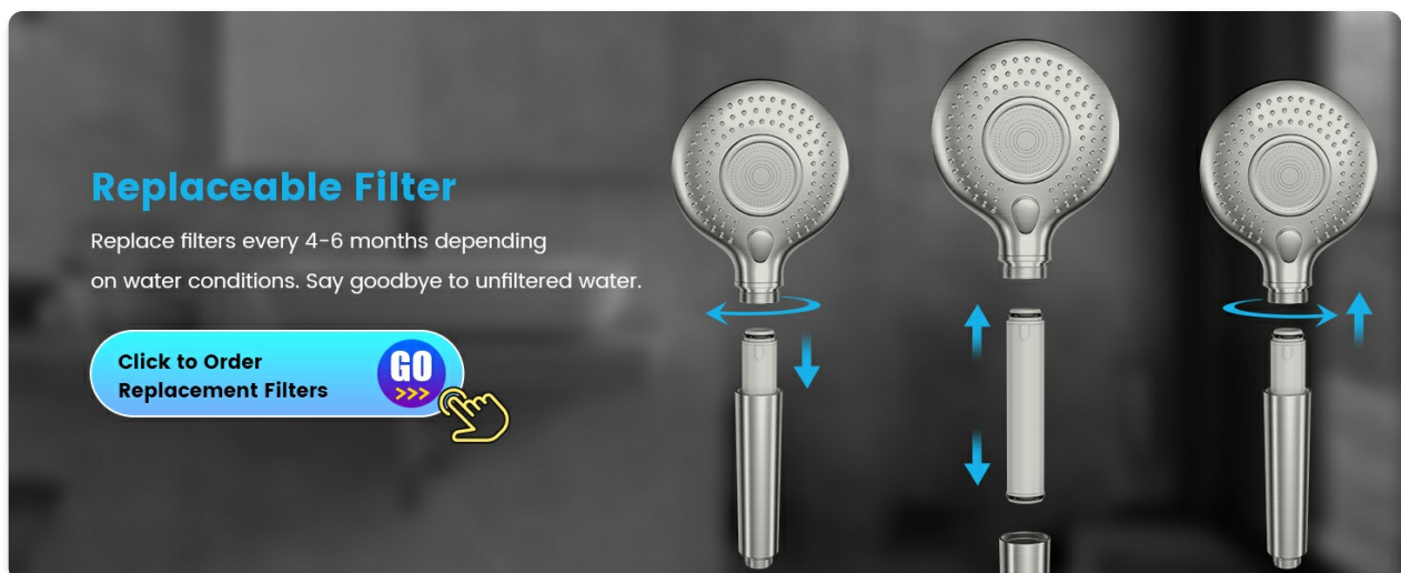
Image 6.1: Step-by-step visual guide for replacing the internal filter cartridge.