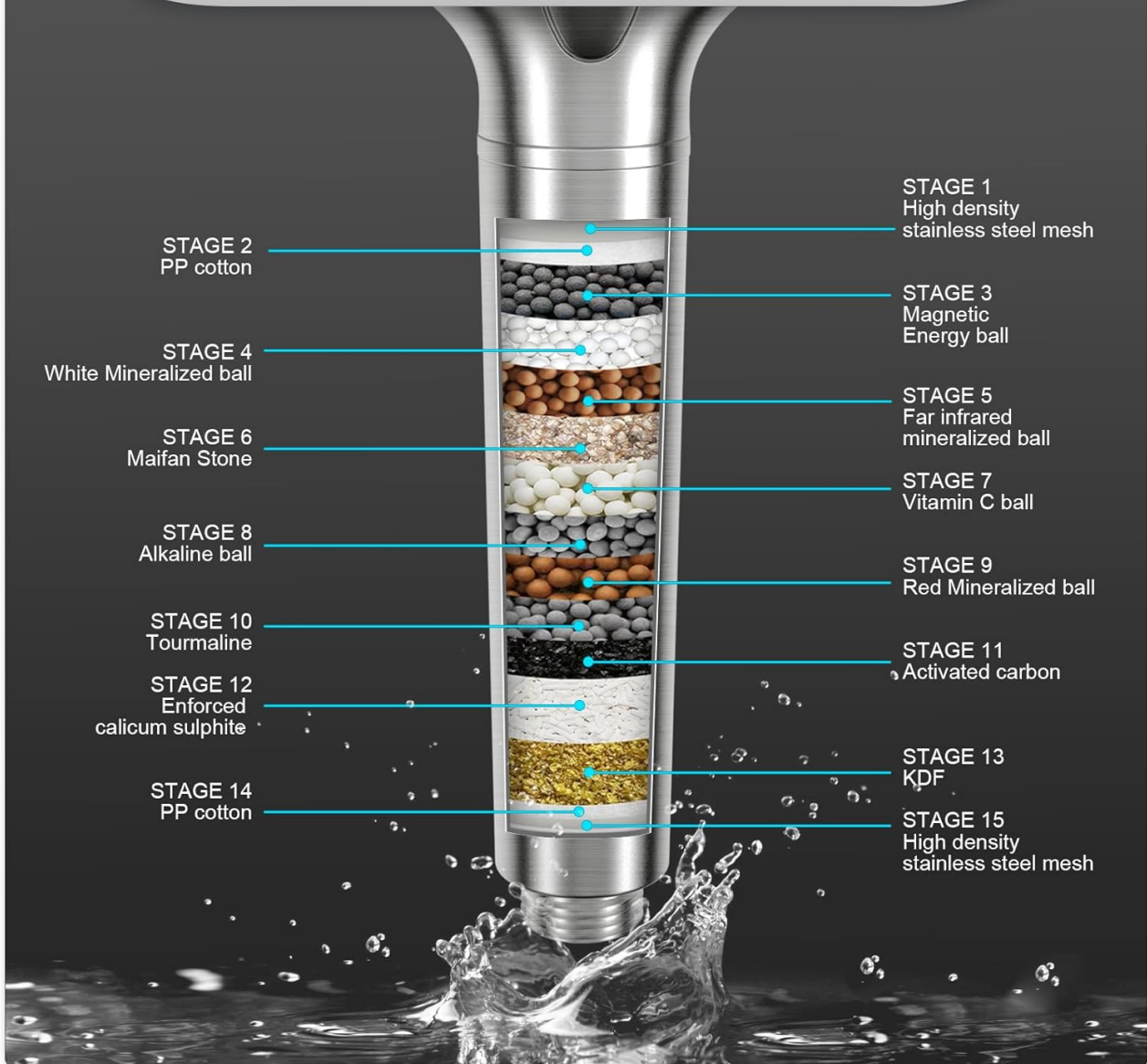
Image 2.2: An exploded view detailing each of the 15 filtration stages, including PP cotton, KDF, and mineral balls.