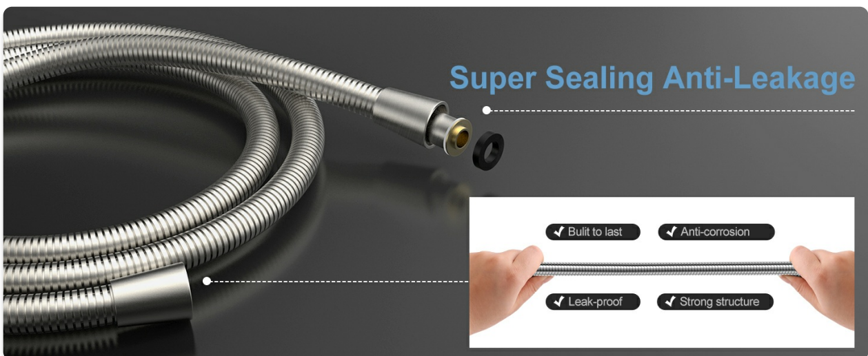
Image 4.2: The stainless steel hose, designed for durability and to prevent leaks.