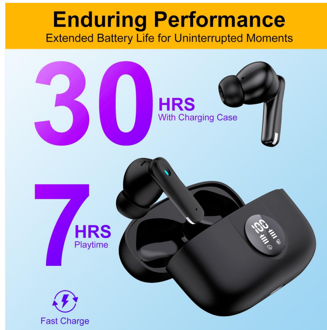
Figure 5.2: Earbud and Charging Case Battery Life.

This image highlights the extended battery performance of the earbuds, offering 7 hours of playtime and over 30 hours when combined with the charging case, along with fast charging capabilities.