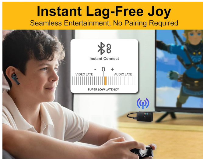
Figure 4.2: Instant, lag-free audio experience.

This image demonstrates the product's low latency technology, ensuring that audio and video are perfectly synchronized, which is crucial for gaming and media consumption.