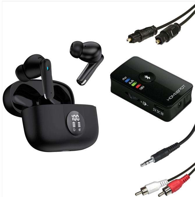
Figure 3.1: HomeSpot Earbuds and Bluetooth Transmitter.

This image provides an overview of the main product components: the HomeSpot True Wireless Earbuds within their charging case, the compact Bluetooth transmitter, and the various audio cables for connectivity.