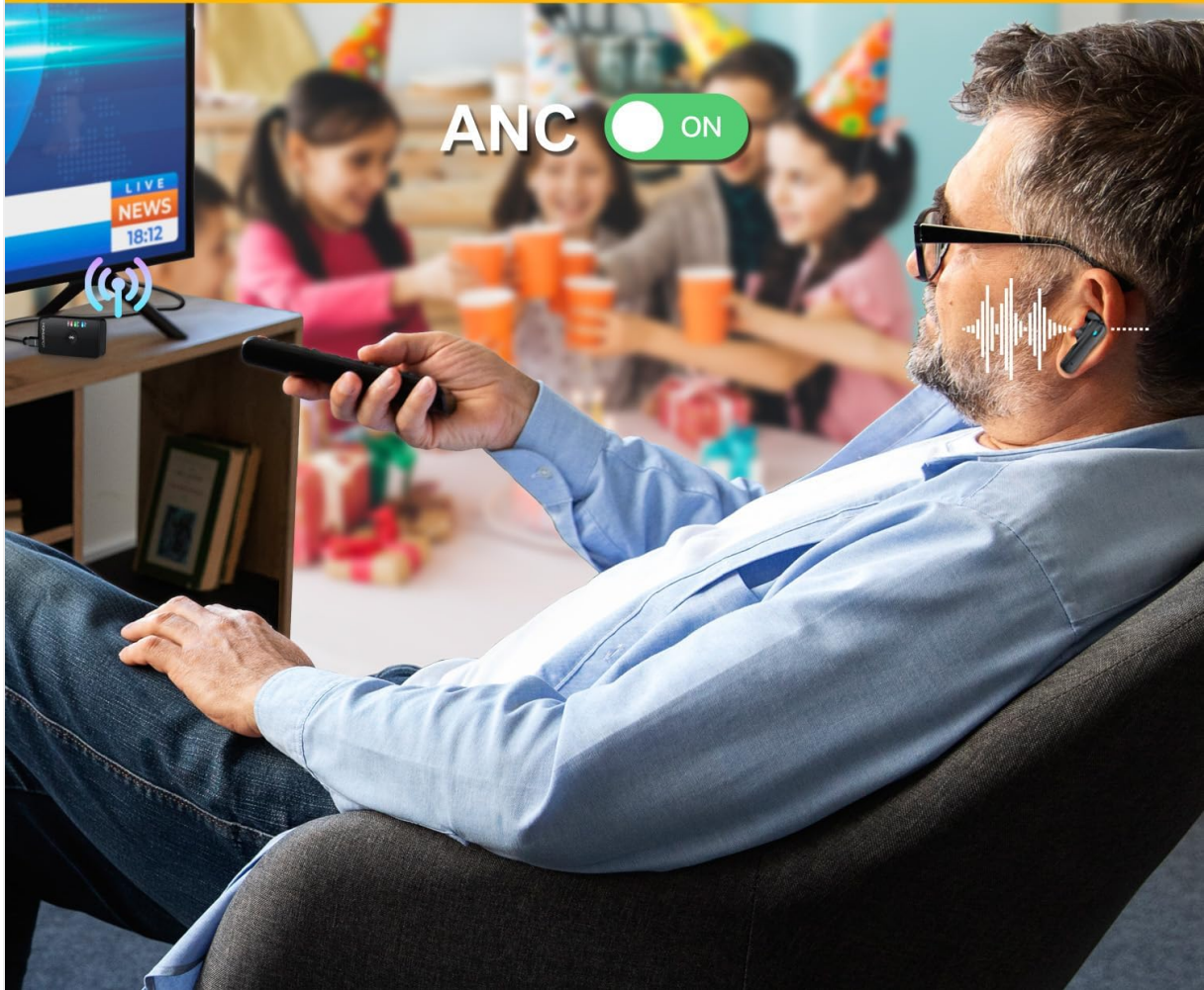
Figure 1.1: Enjoying an immersive TV experience with ANC earbuds.

Enjoy Your TV Show, No Matter the Party Vibe