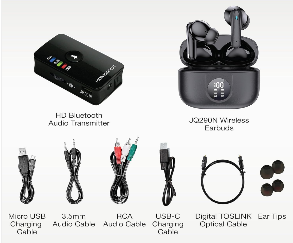
Figure 2.1: All components included in the package.

Elevate Your Audio with Every Essential Included