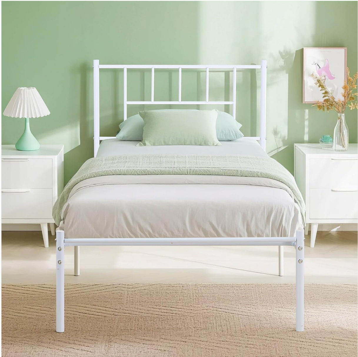
Figure 3: The VECELO Twin Metal Platform Bed Frame fully assembled, shown without a mattress, highlighting the sturdy metal slat support system.