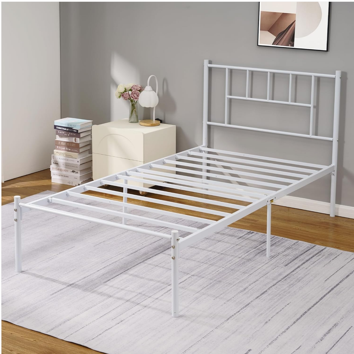
Figure 5: The bed frame in a room setting, demonstrating the ample under-bed clearance suitable for storage solutions like boxes and bins.