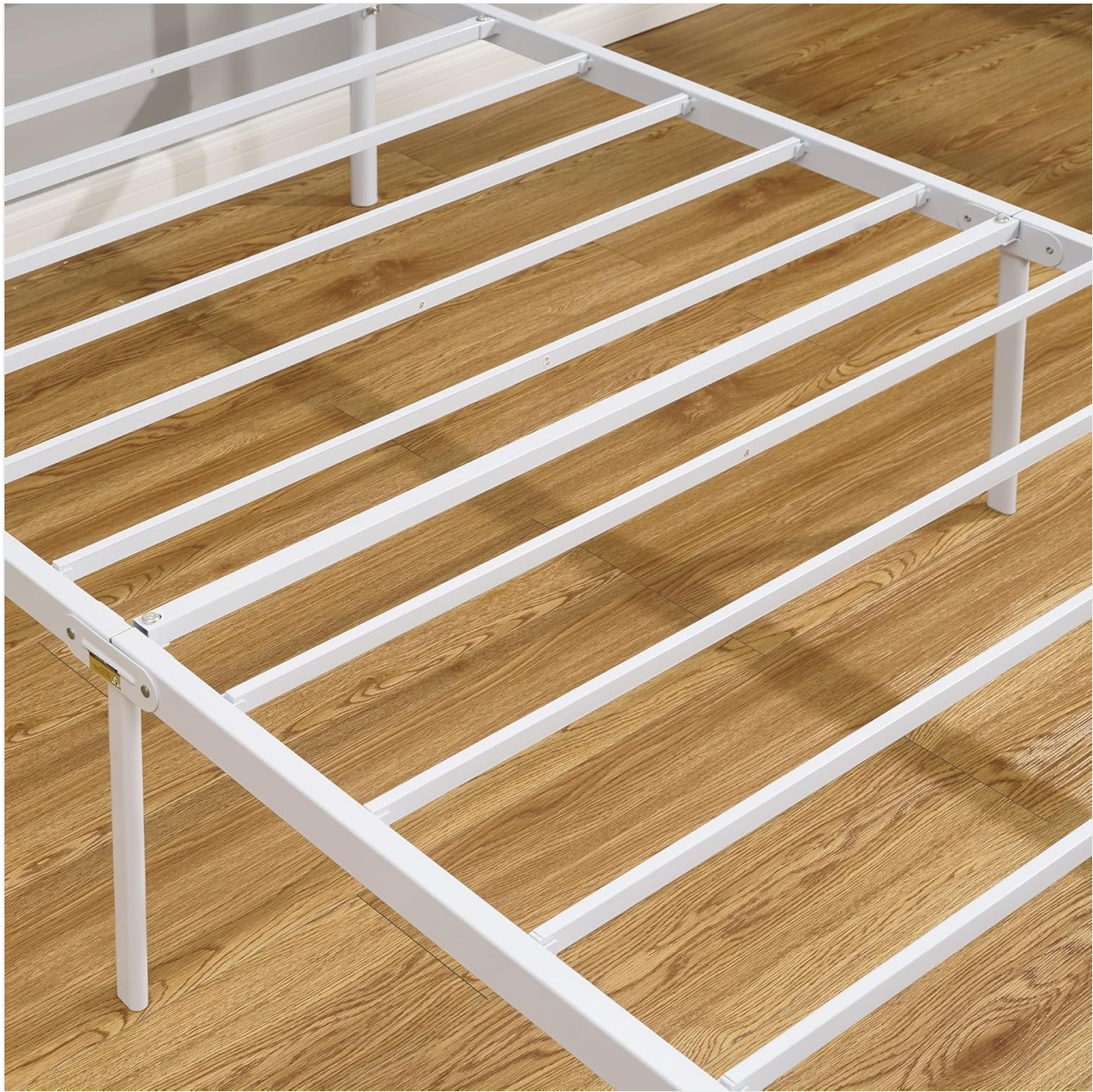
Figure 4: A detailed view of the robust metal slats and their connection points, designed for noise-free support and durability.