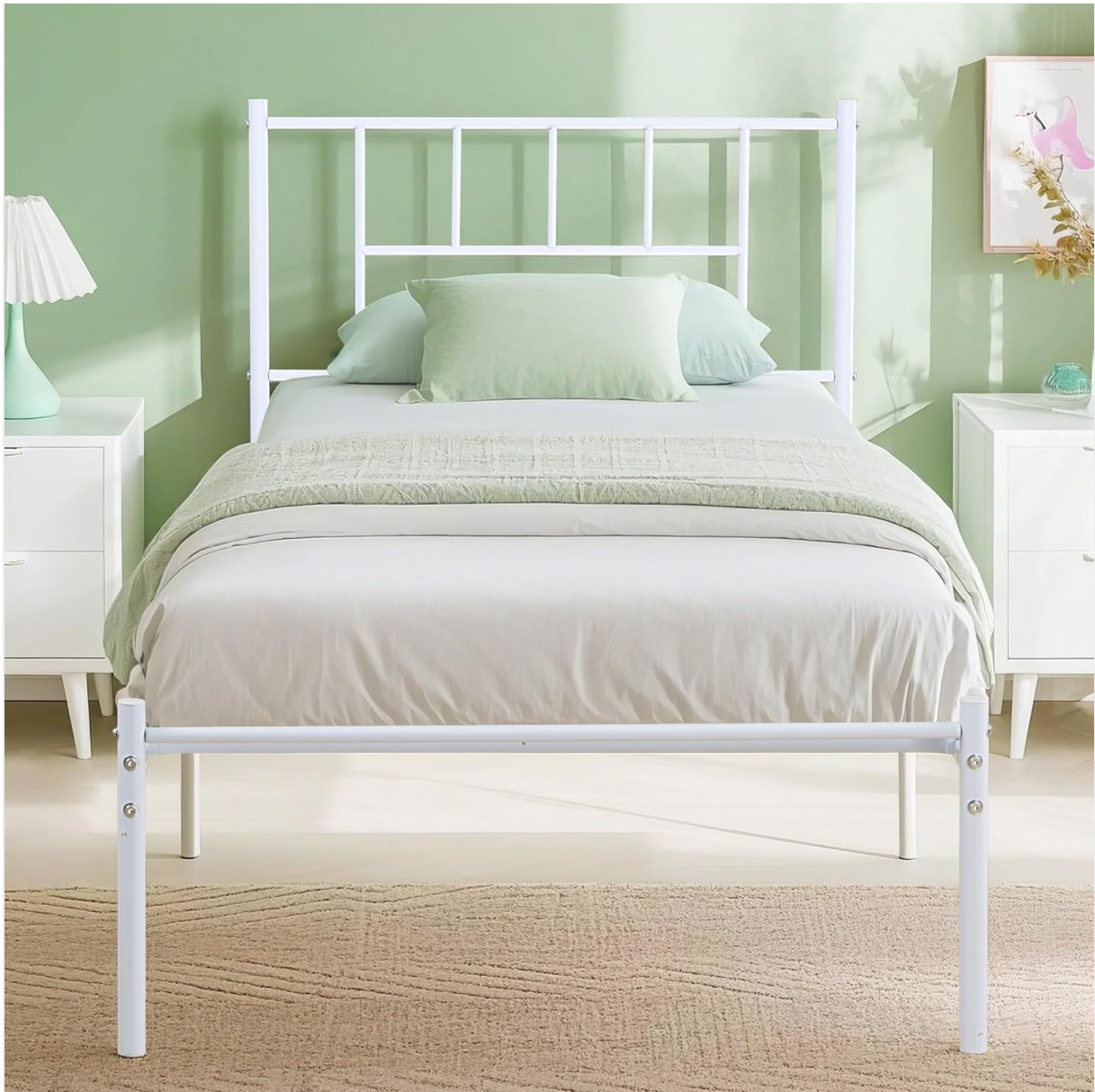
Figure 1: Fully assembled VECELO Twin Metal Platform Bed Frame in white, shown with bedding in a bedroom setting.