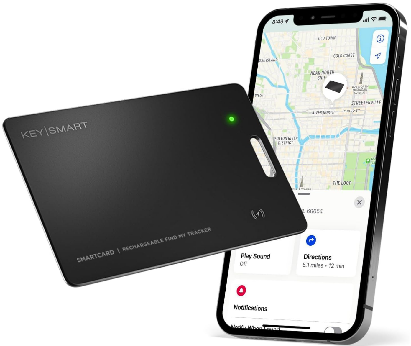
Image: The KeySmart SmartCard seamlessly integrates with the Apple Find My app, allowing you to view its location on a map.