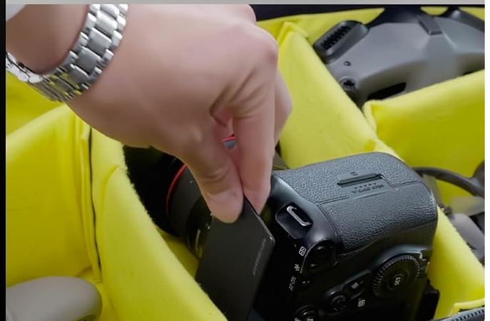
Image: The SmartCard's versatility allows it to track a wide range of personal belongings.