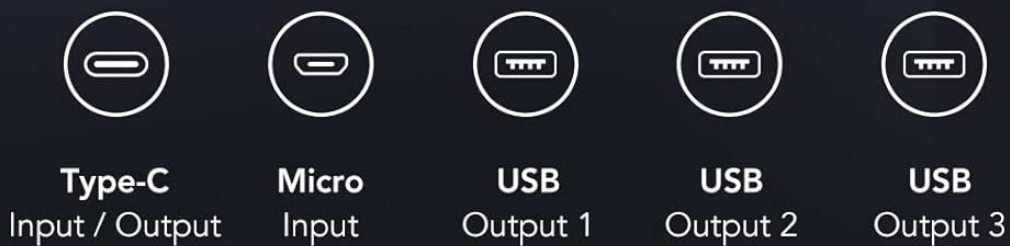
Figure 3: Close-up view of the power bank's ports, highlighting the Type-C (input/output) and Micro USB (input) ports for recharging the power bank.