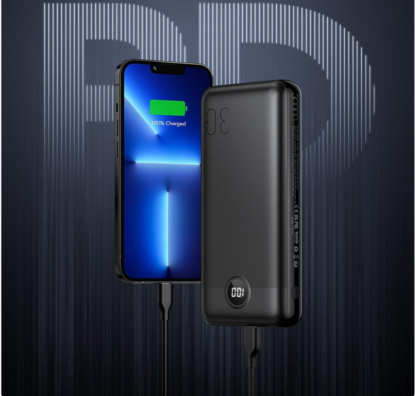
Figure 5: A smartphone connected to the power bank, illustrating the 20W fast charging capability with a visual representation of rapid power delivery.