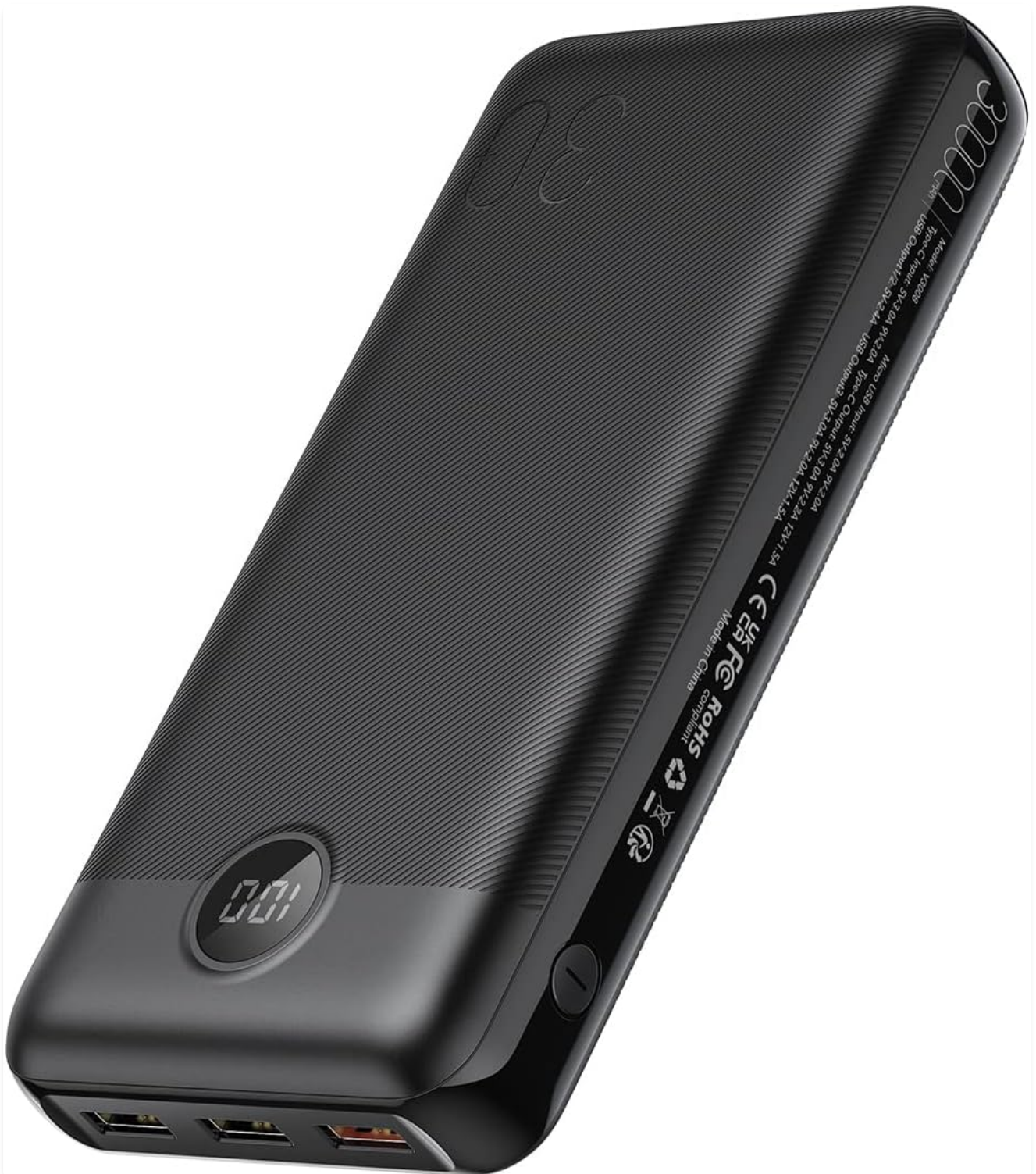
Figure 1: Front view of the VEGER 30000mAh Portable Charger, showcasing its sleek black design and digital display.