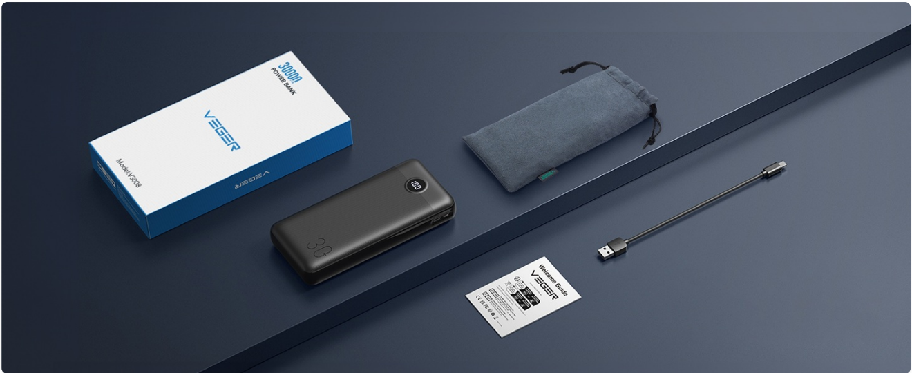
Figure 2: Illustration of the VEGER Power Bank, USB-A to USB-C cable, user manual, and mesh pouch included in the package.