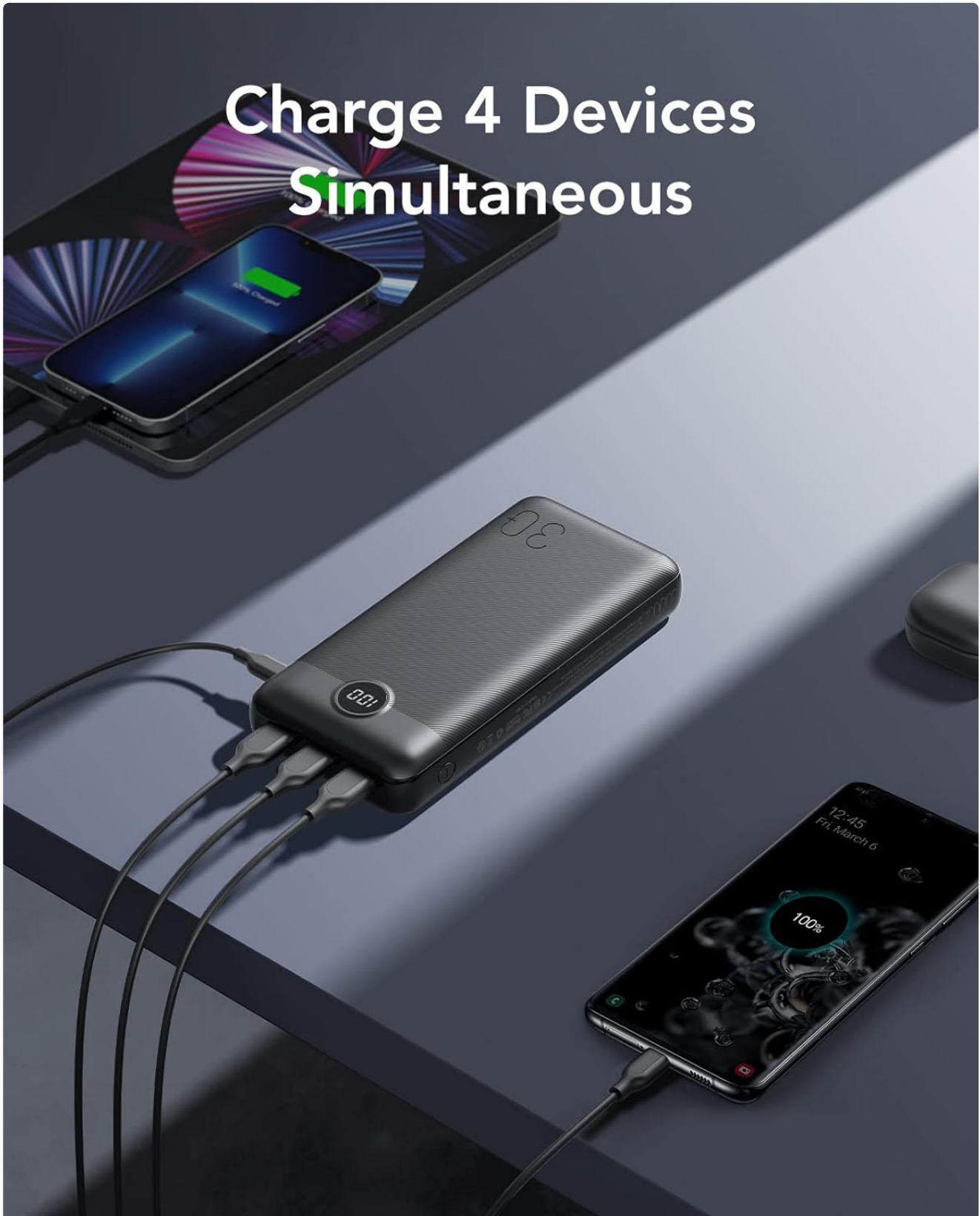
Figure 4: The power bank connected to and charging a tablet, a smartphone, and another device, demonstrating its multi-device charging capability.