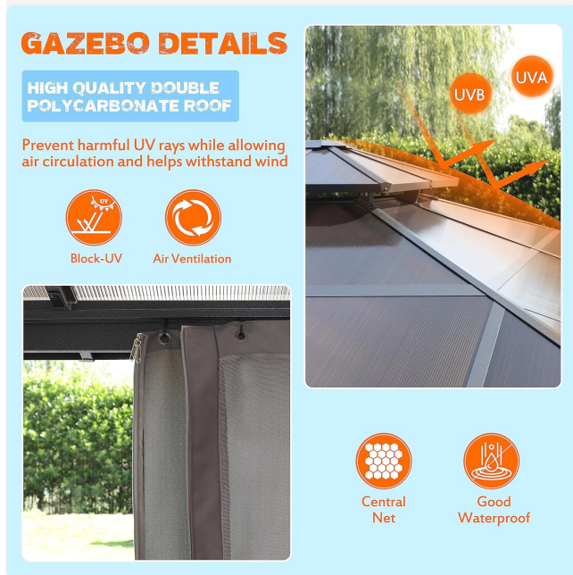
Figure 3: Roof System. Details of the polycarbonate double roof, emphasizing UV protection and ventilation.

Carefully install the polycarbonate double roof panels. These panels are designed for impact resistance, UV protection, and excellent lighting. The ventilated roof design ensures proper air circulation.