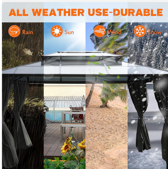
Figure 5: All-Weather Durability. The gazebo is built to withstand various weather conditions.

The gazebo is designed for multi-season use, offering protection from sun, rain, and light snow. The sloping roof ensures rapid drainage during rainy days.