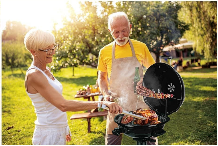
Image: The Techwood Electric Grill in use, highlighting its double-layer design for cooking various foods simultaneously.