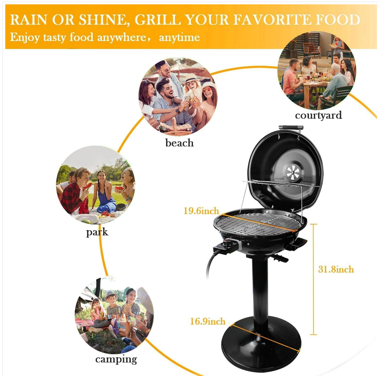
Image: The Techwood Electric Grill set up outdoors, demonstrating its use for a barbecue party with various foods on the grates.