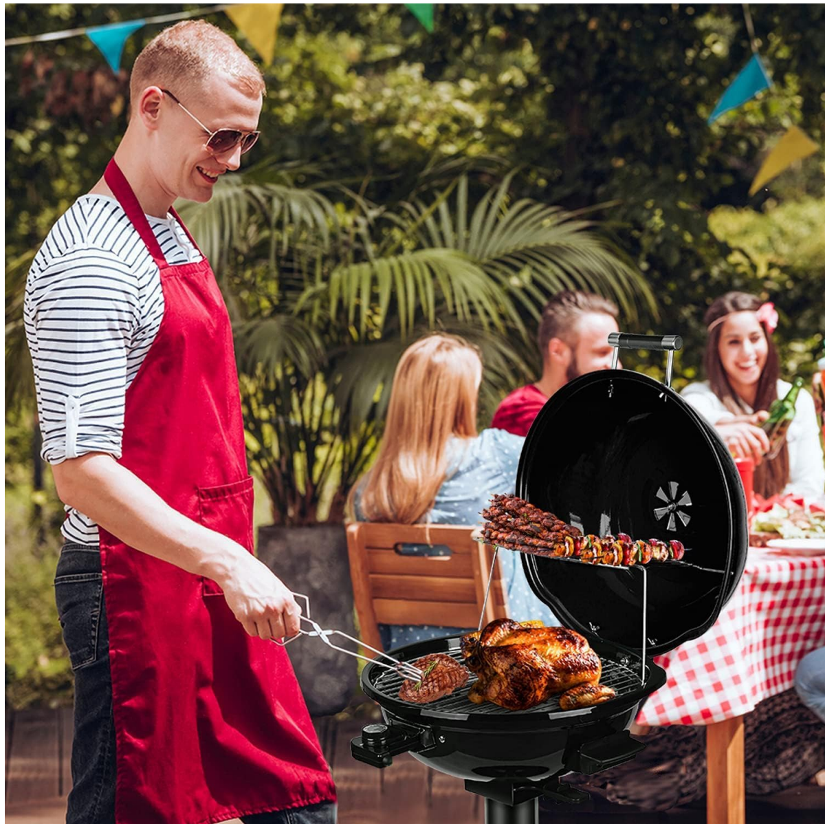
Image: The grill loaded with different types of food, showcasing its high capacity for cooking multiple items simultaneously.