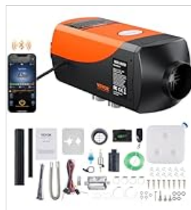
Figure 3.2: Detailed view of the VEVOR diesel heater's package contents, showing the main unit and various installation accessories.