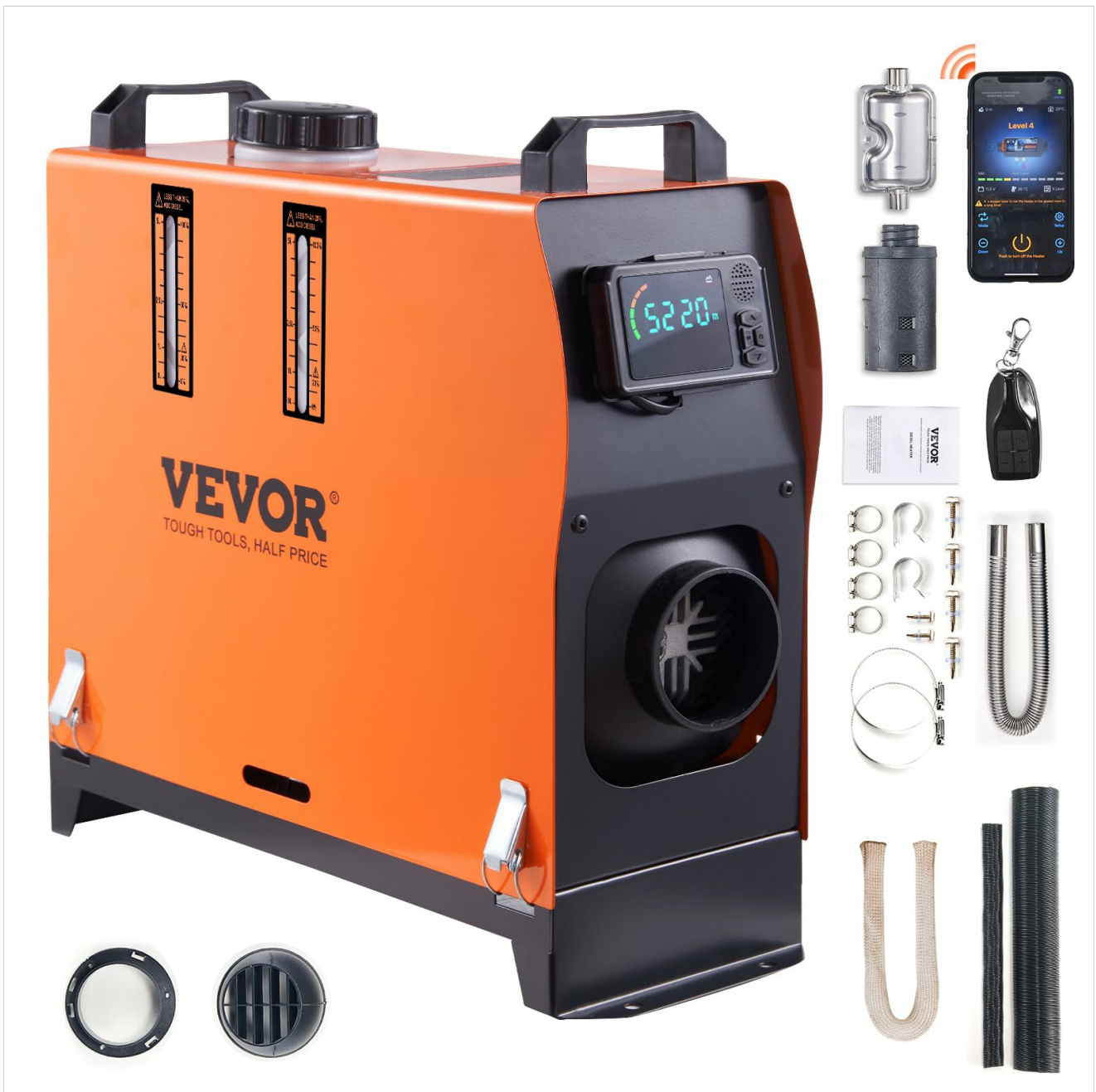
Figure 5.2: VEVOR Portable All-in-One Diesel Heater. This image highlights the compact and integrated design of the heater, ready for use.