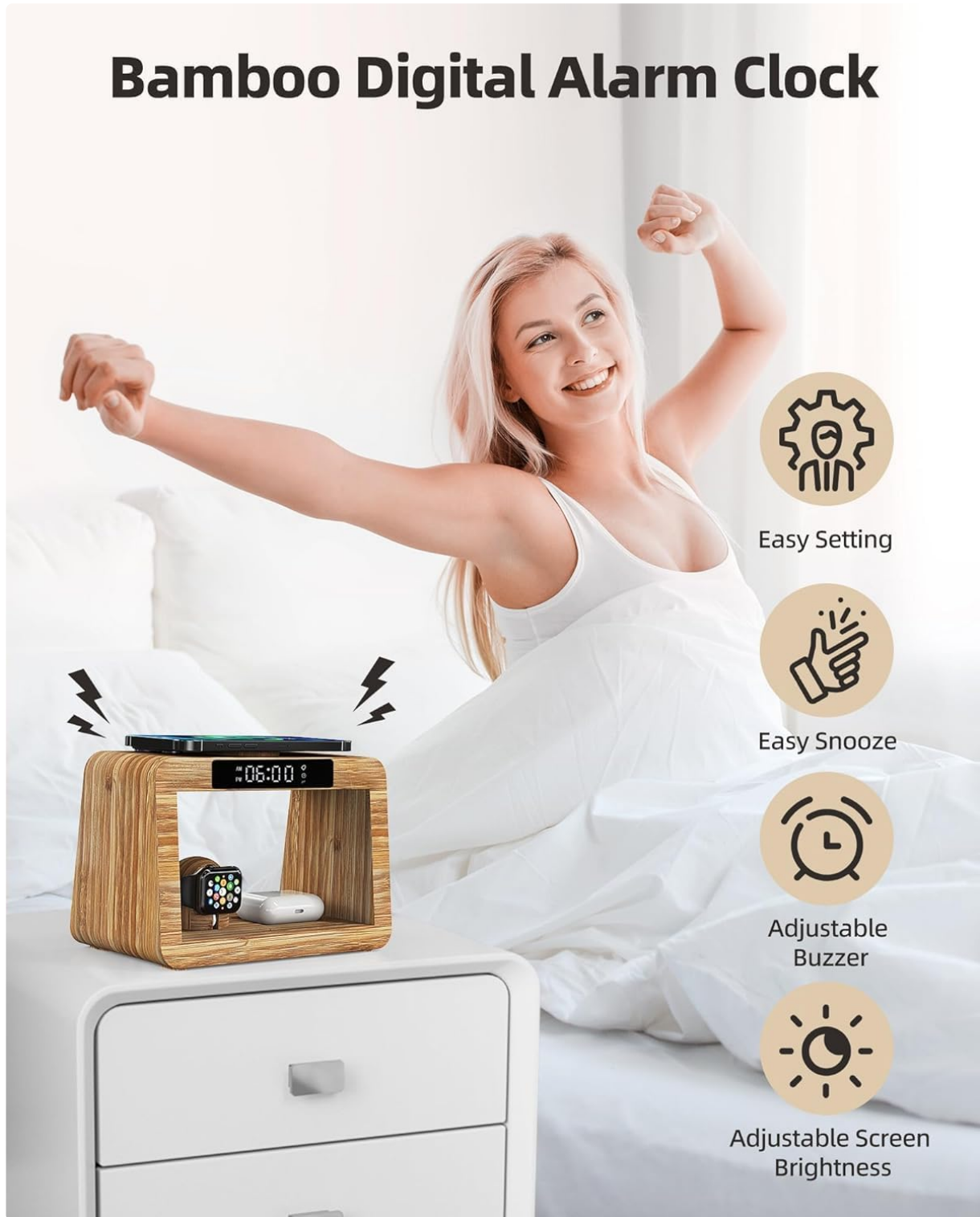
Figure 4: Digital alarm clock features including easy setting and adjustable buzzer.