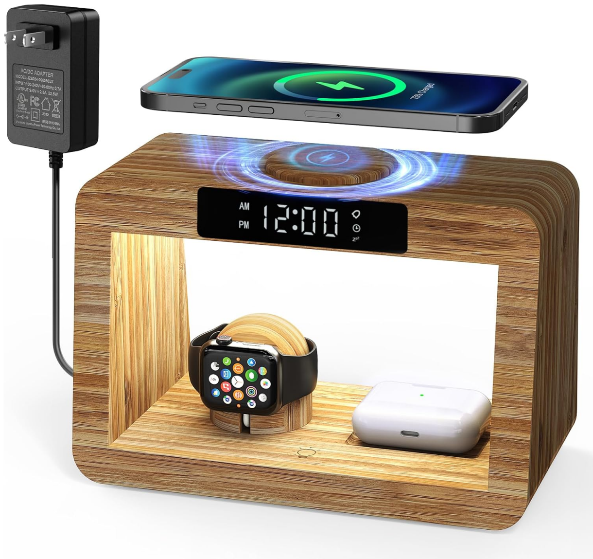
Figure 1: Alltripal Bamboo Wireless Charging Station with devices charging.