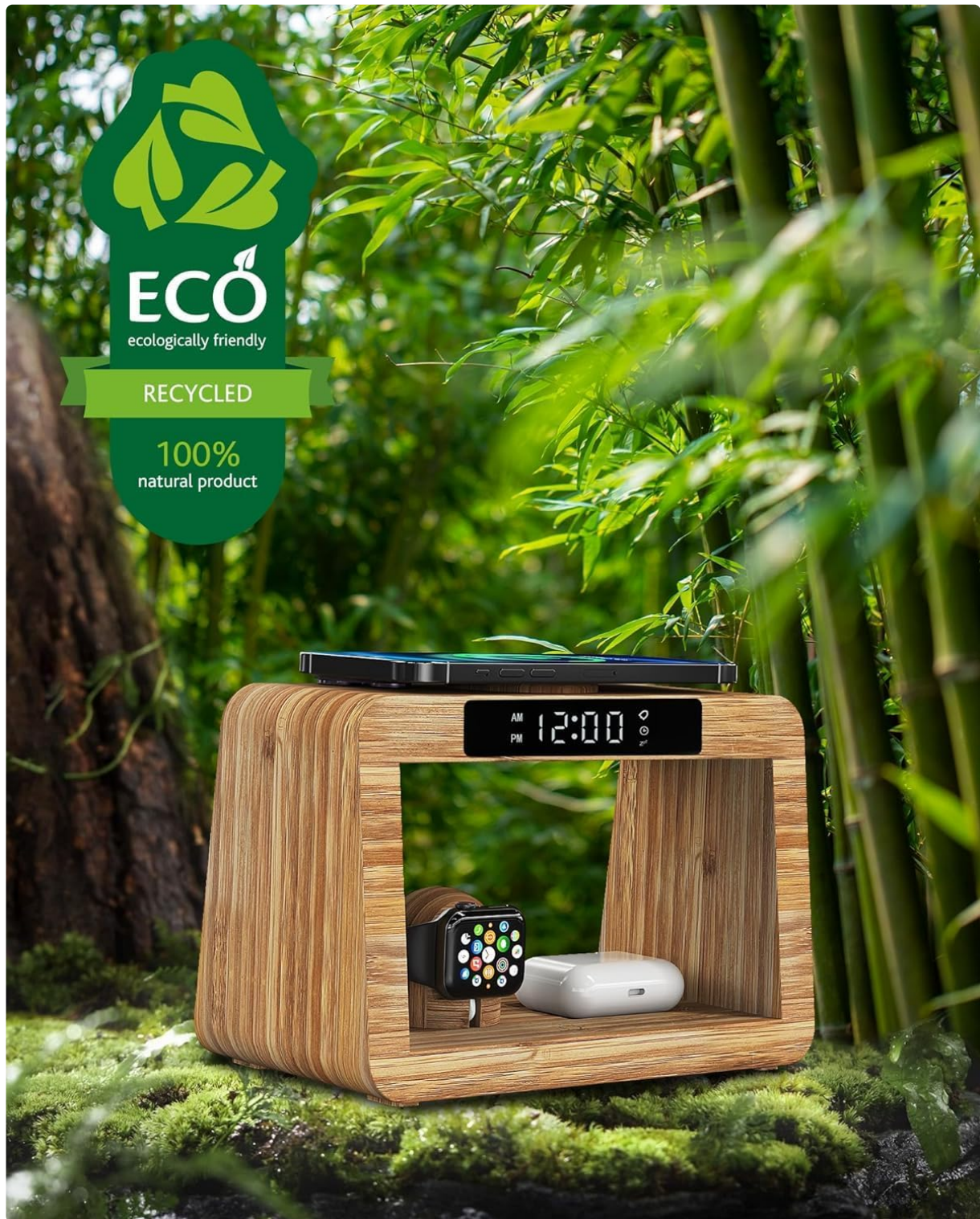
Figure 3: Universal compatibility for various Apple devices.

For best charging results, remove any thick phone cases before placing your smartphone on the wireless charging pad.