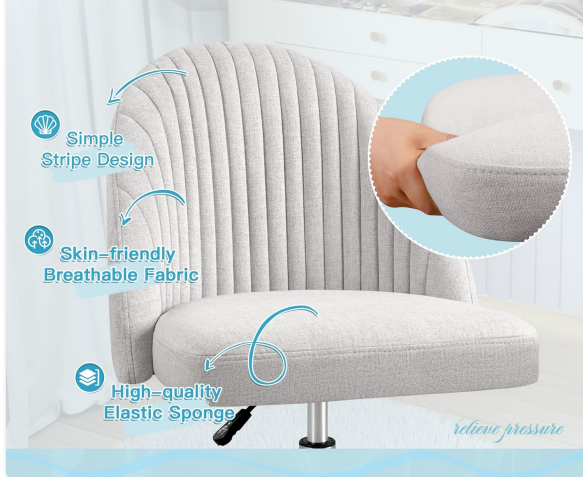
Image: Close-up of the comfortable padded seat and supportive backrest.