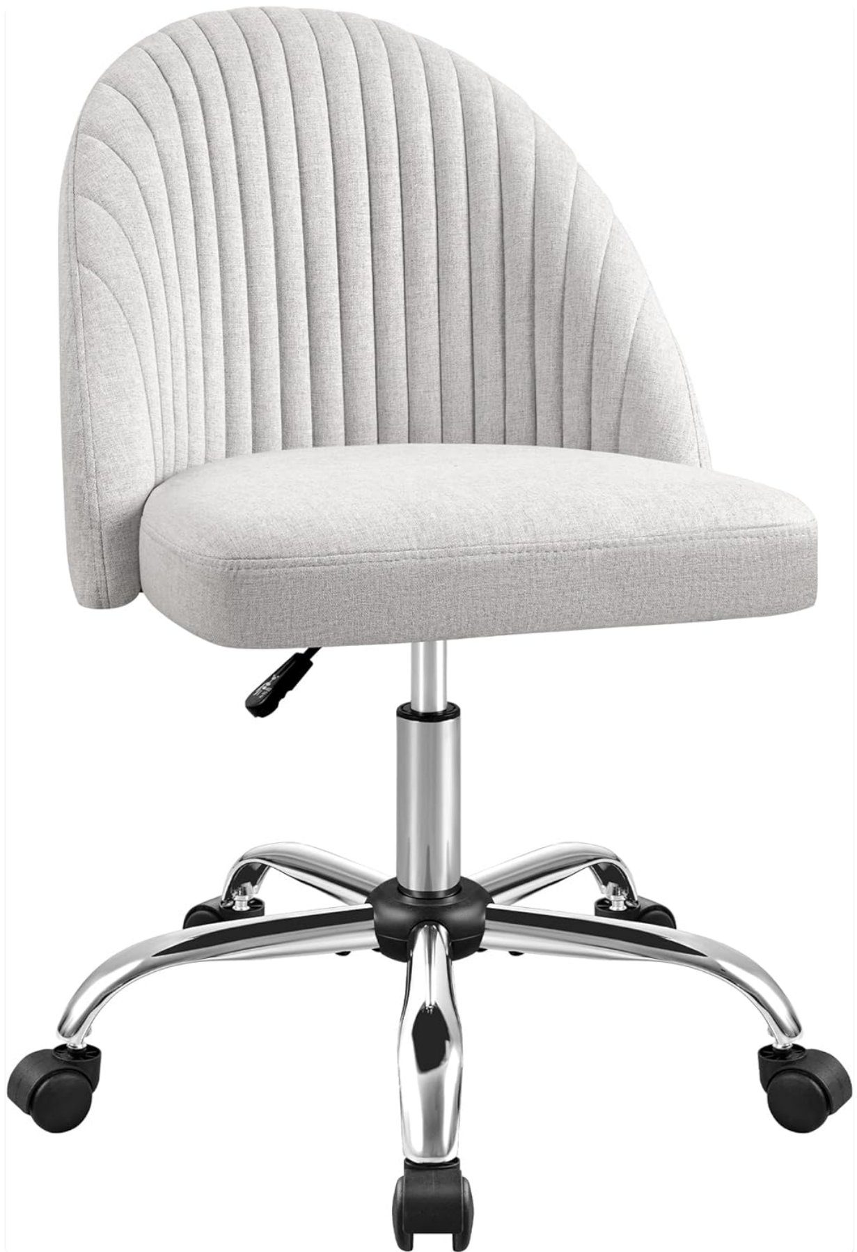
Image: The Furniwell Armless Adjustable Swivel Desk Chair in Grey Fabric, showcasing its modern design and compact form.