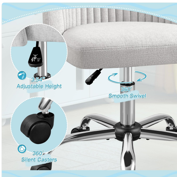
Image: Features including adjustable height, 360° smooth swivel, and silent casters.