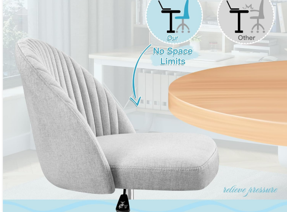
Image: The ergonomic armless design for better space saving.