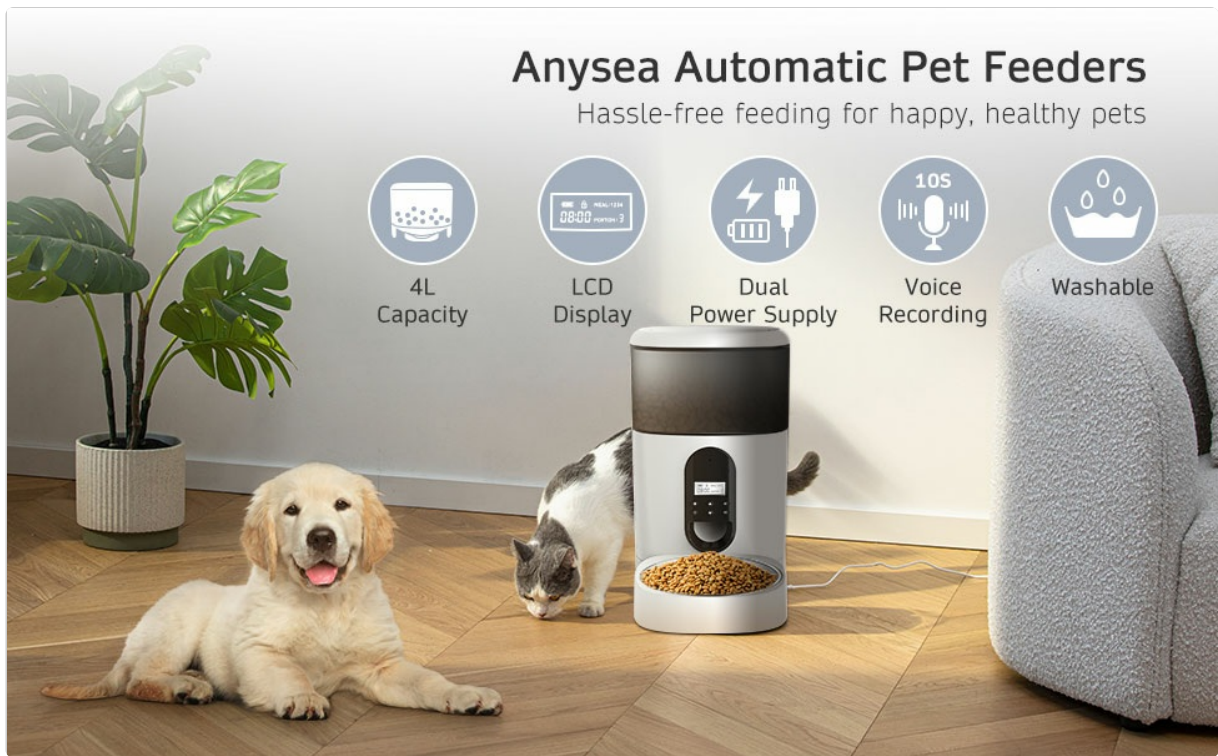
Image 1.2: Overview of the Anysea Automatic Pet Feeder's key features and design.