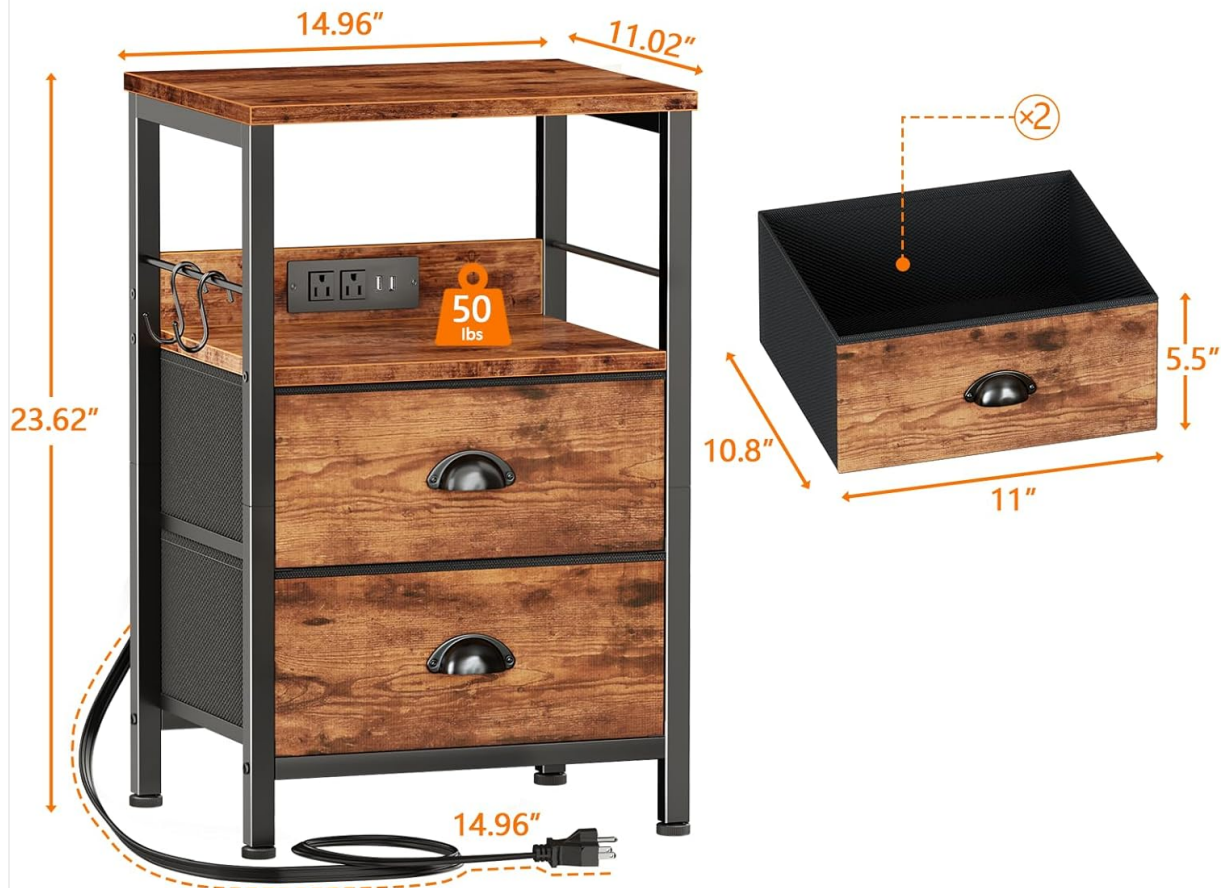
Figure 1: Exploded view of table components and dimensions.

This image illustrates the individual parts of the end table, including the wooden panels, metal frame, fabric drawers, and the charging station. Key dimensions are also indicated.