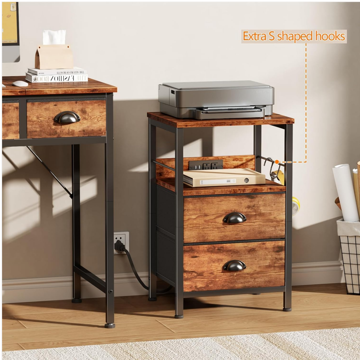
Figure 5: End table showcasing the S-shaped hooks and top shelf usage.

This image illustrates the versatility of the end table, showing a printer on the top surface and the S-shaped hooks in use for hanging items.