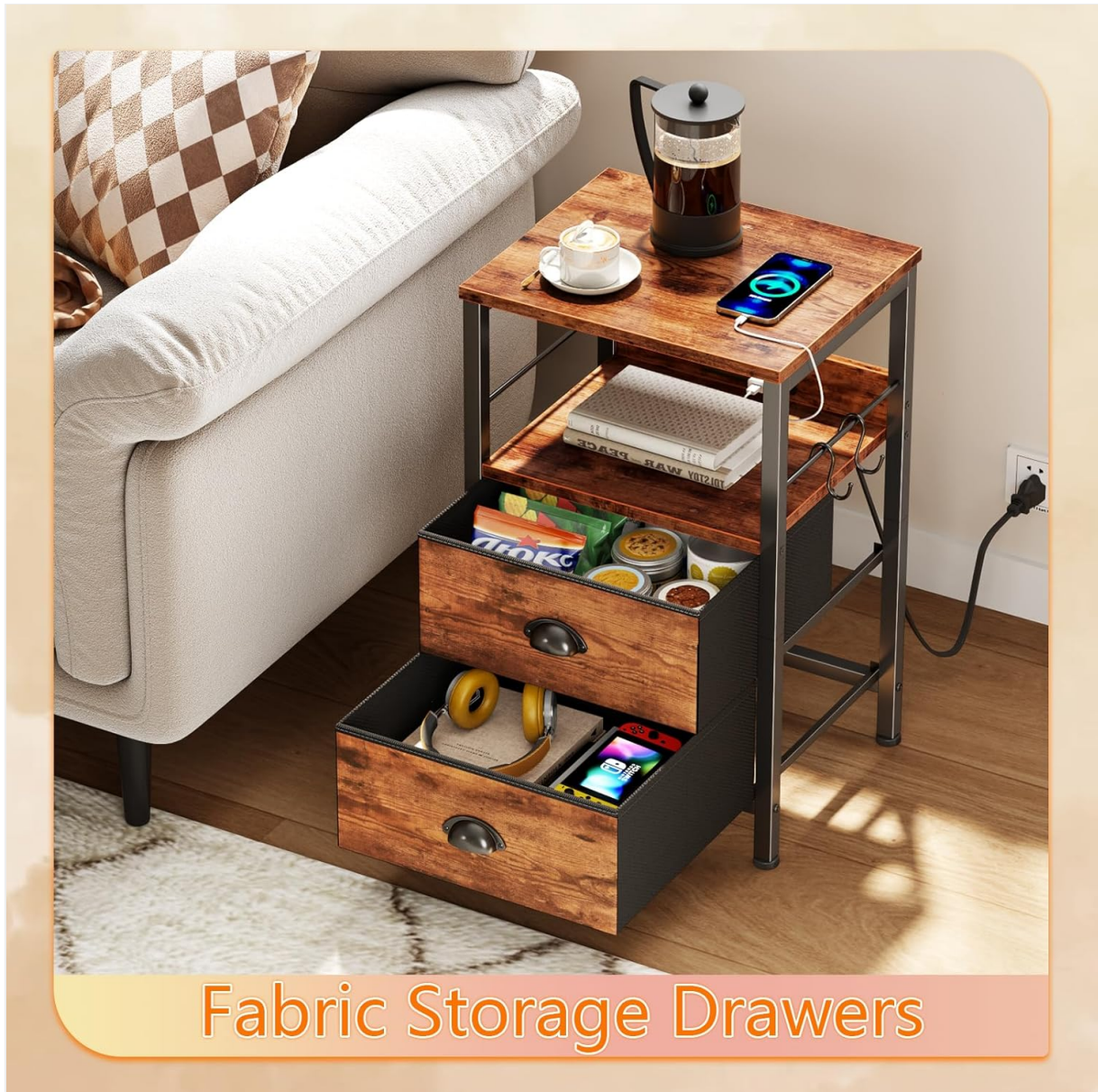
Figure 4: Fabric storage drawers in use.

This image shows the two fabric drawers partially open, demonstrating their storage capacity for various household items.