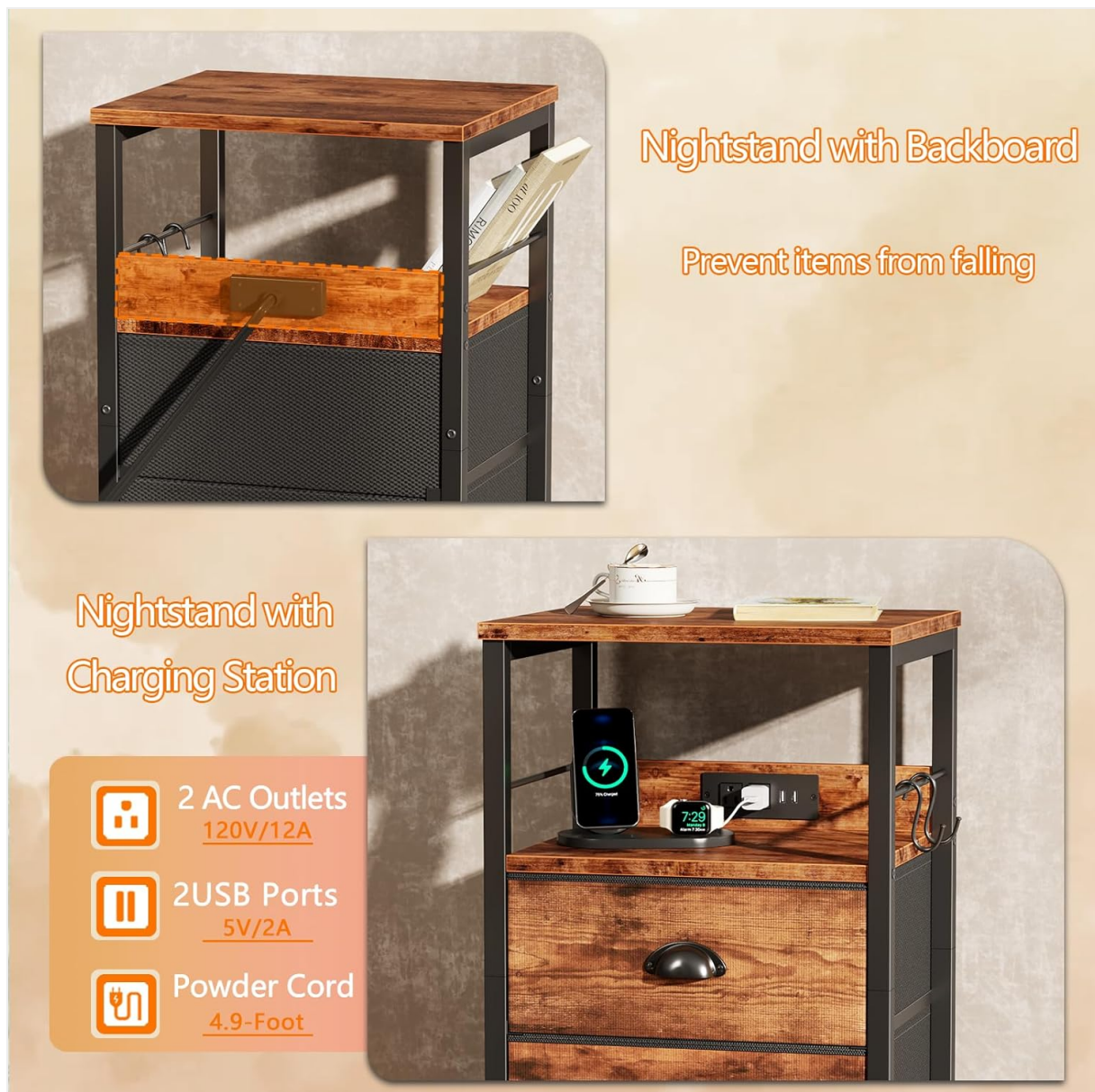
Figure 3: Detail of the charging station and its features.

This image highlights the charging station, showing the two AC outlets, two USB ports, and the power cord, emphasizing its convenient and safe placement.