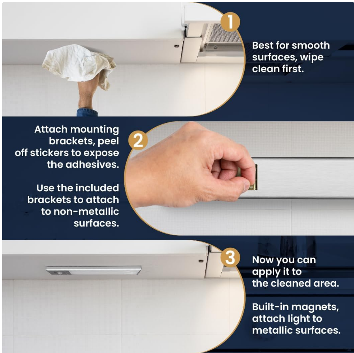
Figure 1: Installation steps for the VYANLIGHT LED light bar.