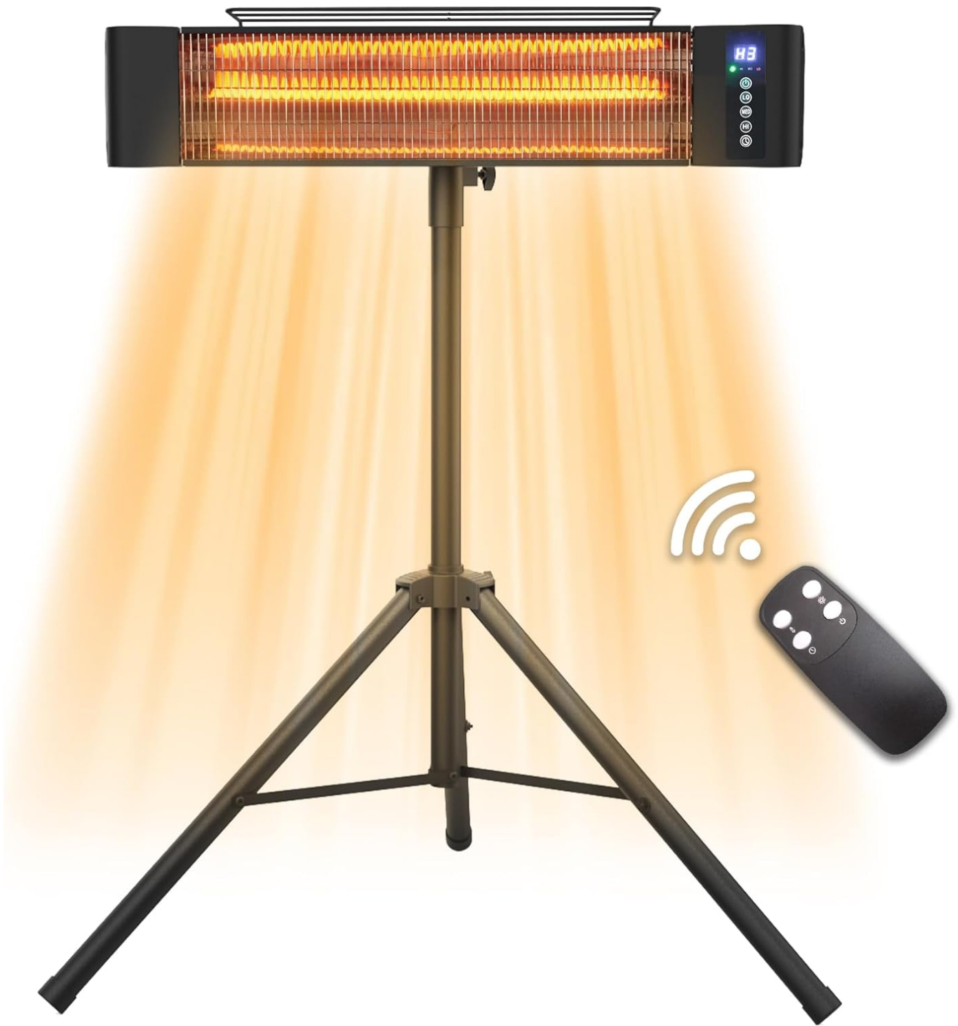
The WEWARM HT8006N Infrared Outdoor Heater on its adjustable tripod stand, showcasing its sleek design and included remote control. This image highlights the product's readiness for immediate use in an outdoor setting.