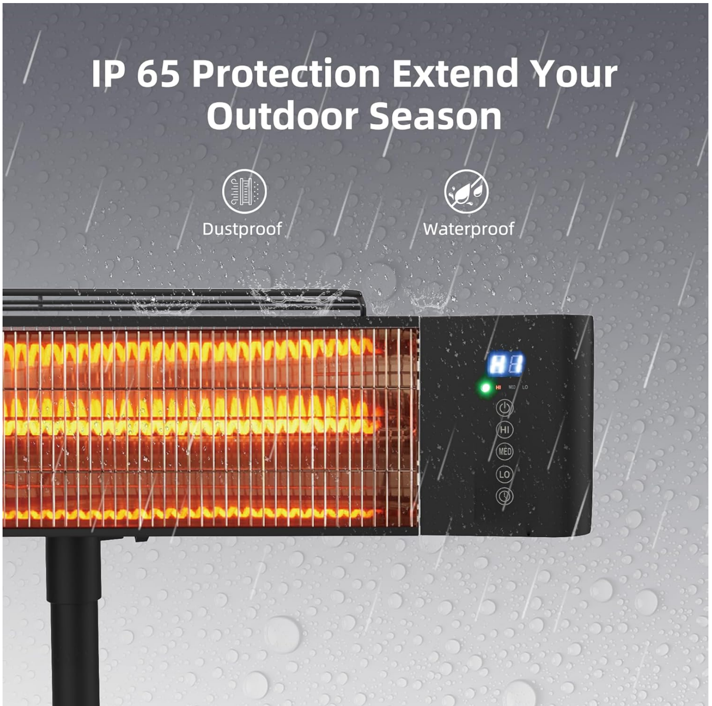
Close-up of the heater's control panel with water droplets, illustrating its IP65 dustproof and waterproof rating for enhanced durability and safety in outdoor environments.