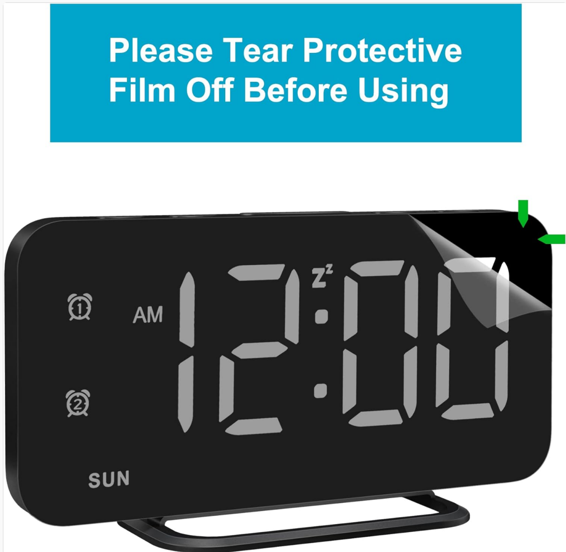
Image 2: A hand removing the protective film from the clock's mirror surface, revealing the digital display underneath.