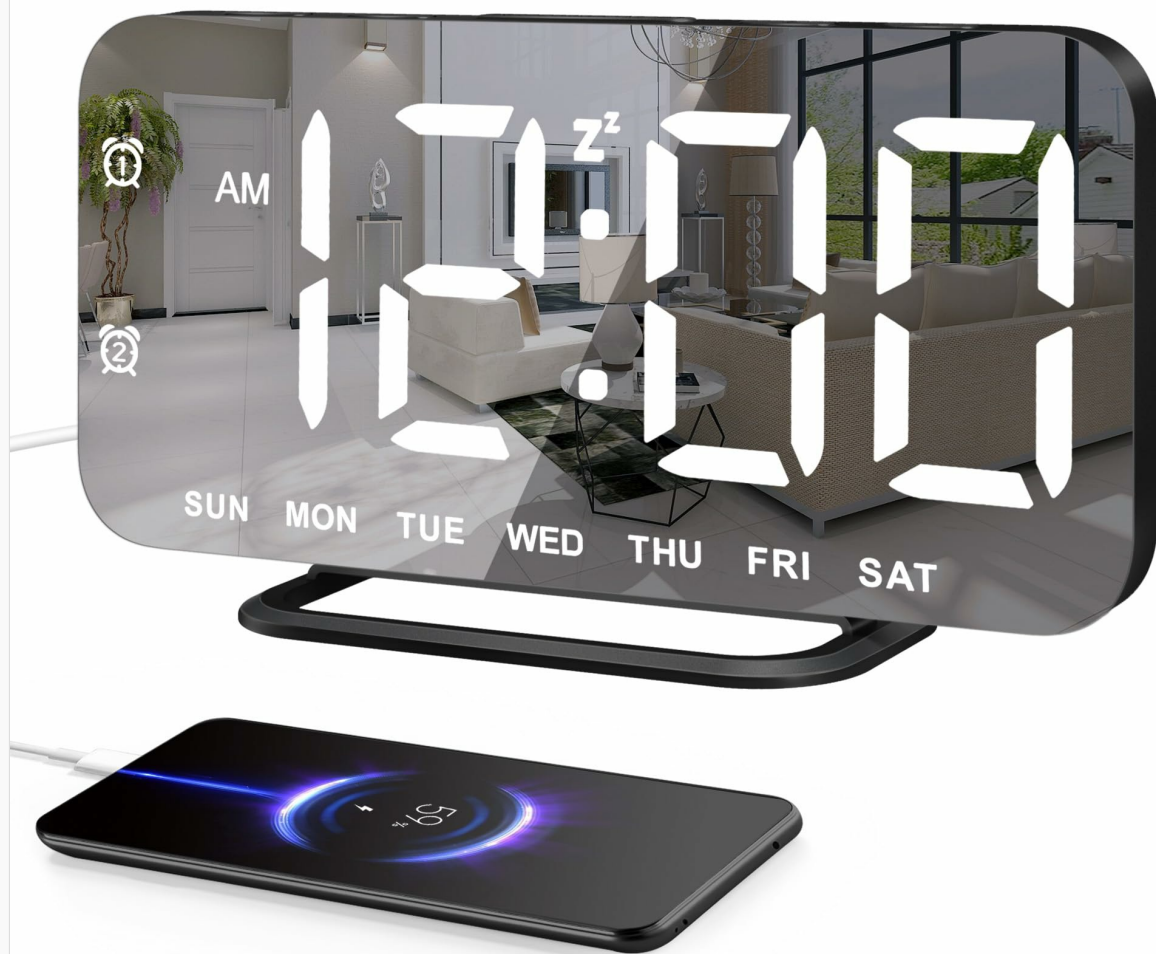
Image 6: The clock's 7-inch mirror surface being used for makeup, demonstrating its dual functionality.