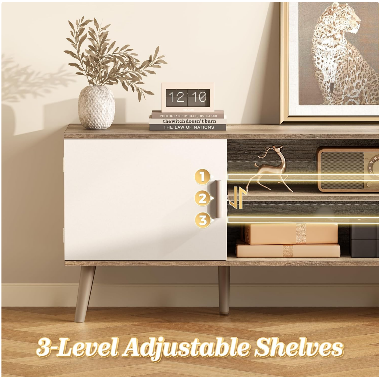
Image: Detail of the adjustable middle shelf, showing three possible height settings for flexible storage.