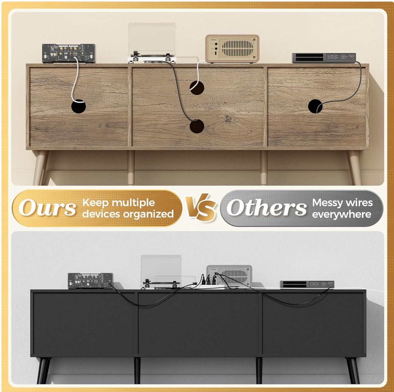
Image: The back of the TV stand featuring multiple cord holes to help organize and manage cables from electronic devices.

The TV stand includes four cord holes located on the back panel of the open compartments. Utilize these holes to route power cables and audio/video wires, keeping them organized and out of sight. This helps prevent tangled cables and maintains a clean aesthetic.