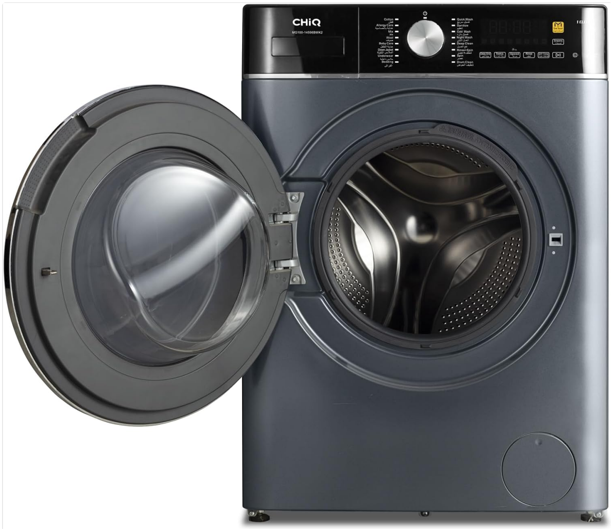
Figure 3.2: Front view of the washer with the door open, revealing the stainless steel drum.