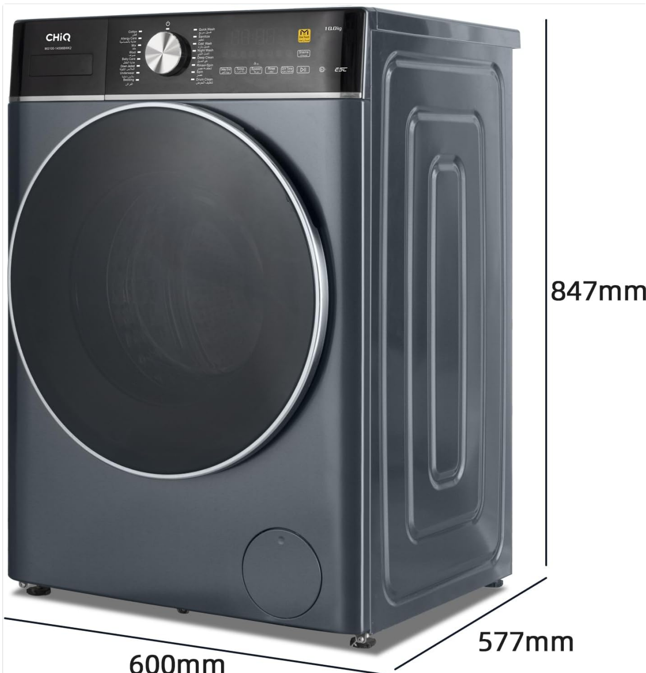
Figure 3.3: Side view of the washer illustrating its compact dimensions: 600mm width, 577mm depth, and 847mm height.