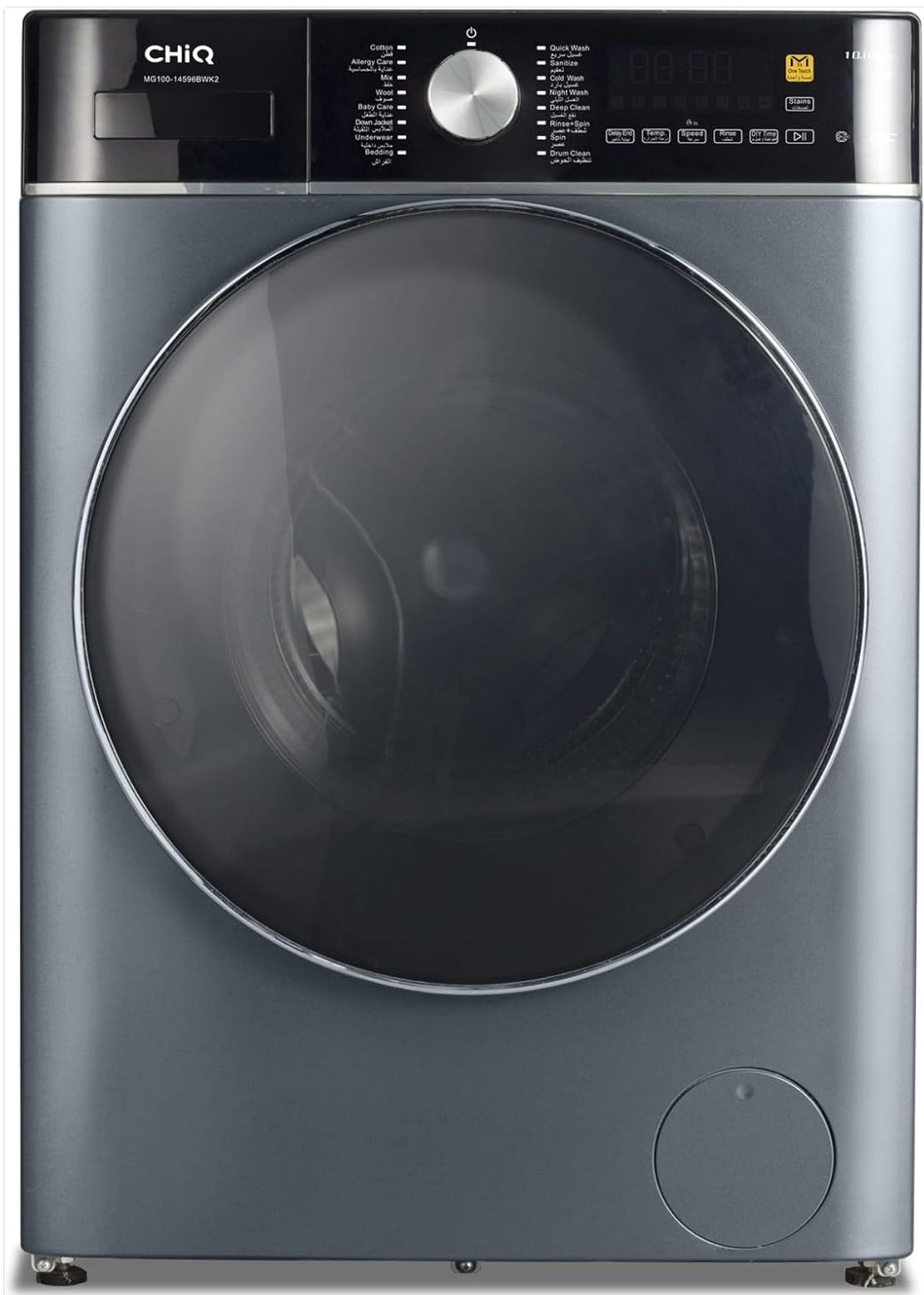
Figure 3.1: Front view of the CHiQ Space Pro Front Load Washer, showing the control panel, detergent dispenser, and large front-loading door.