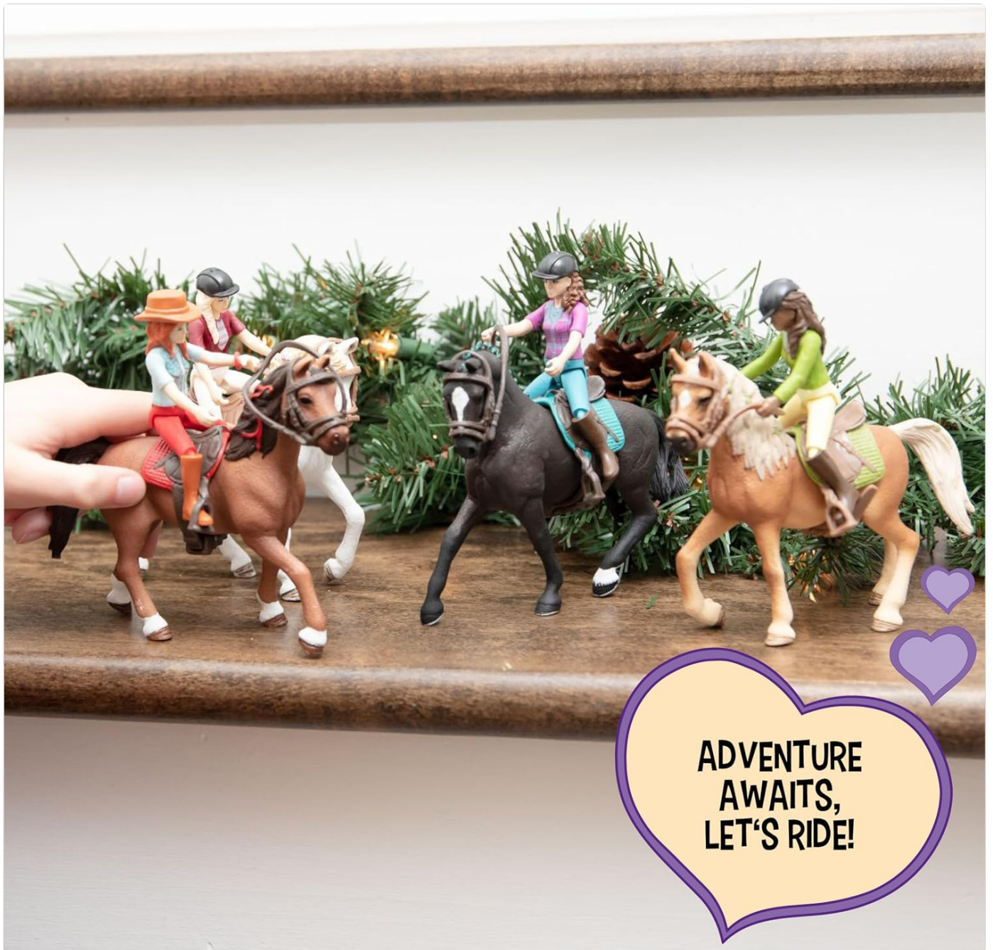
Image 2.2.1: Overview of the Schleich Horse Club Rider Playset components, including horses, riders, and accessories.