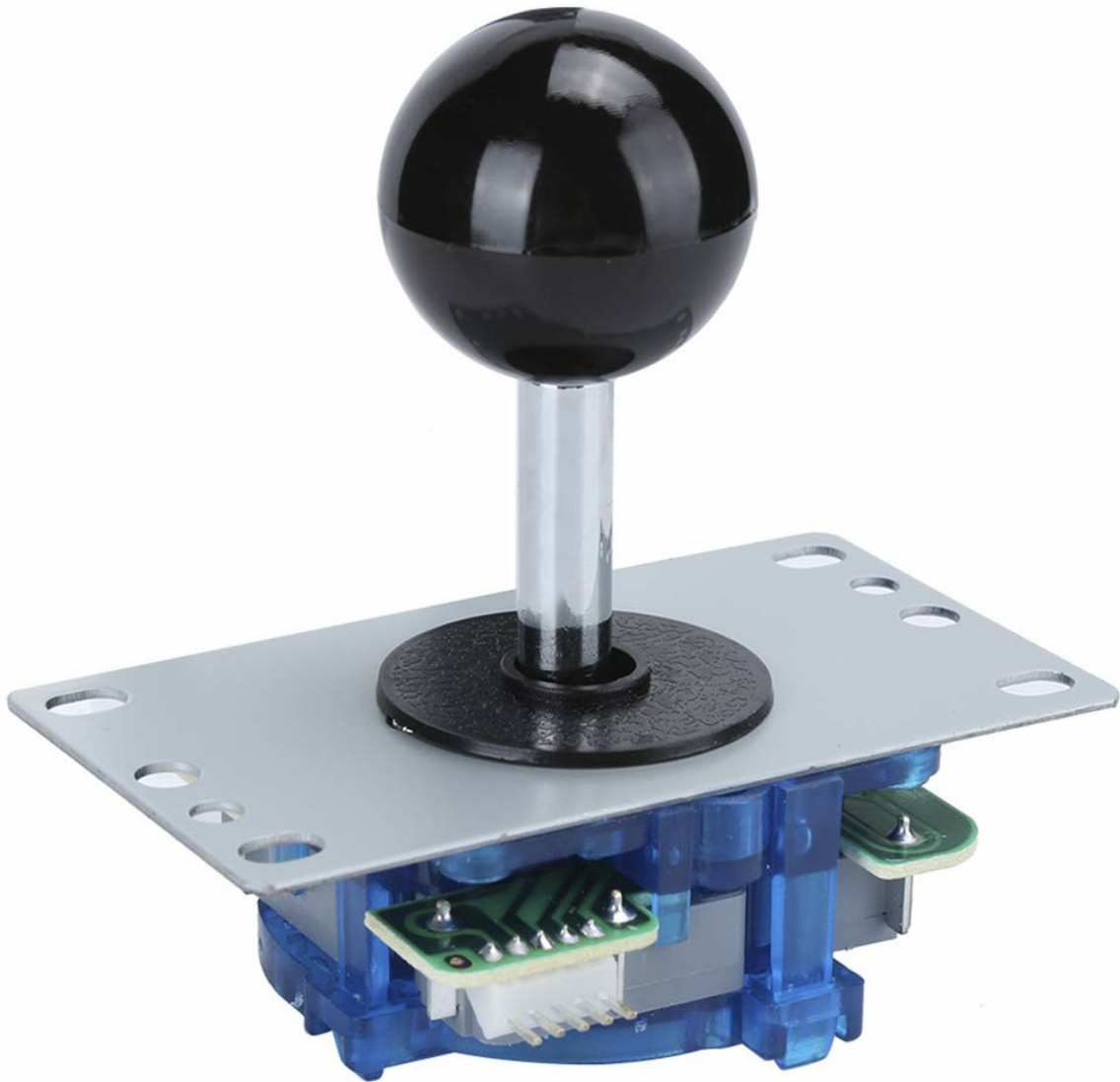
Image 3.1: The Bewinner JX-009 Game Console Joystick, showcasing the main unit and its accompanying cable and small parts.