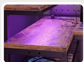
Figure 2.1: Detail of the integrated power outlets and USB ports.