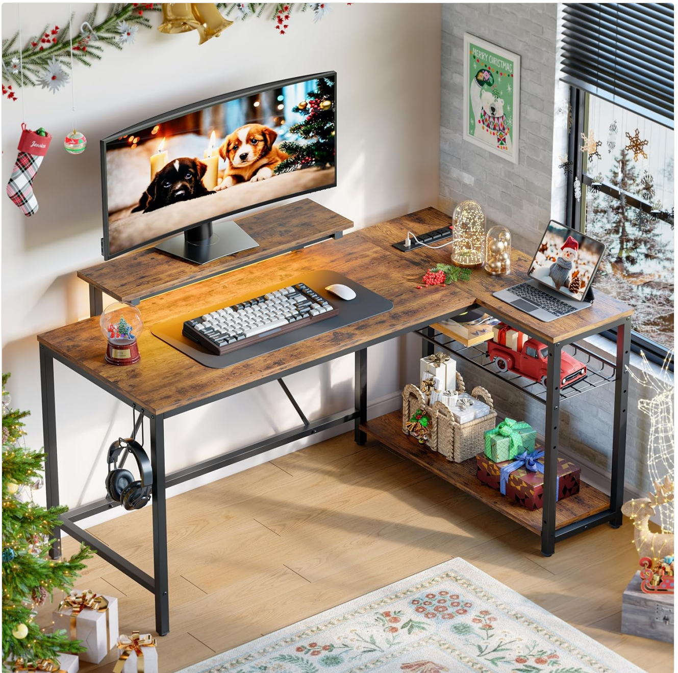
Figure 1.1: Overview of the Bestier 58 Inch L-Shaped Desk in Rustic Brown.