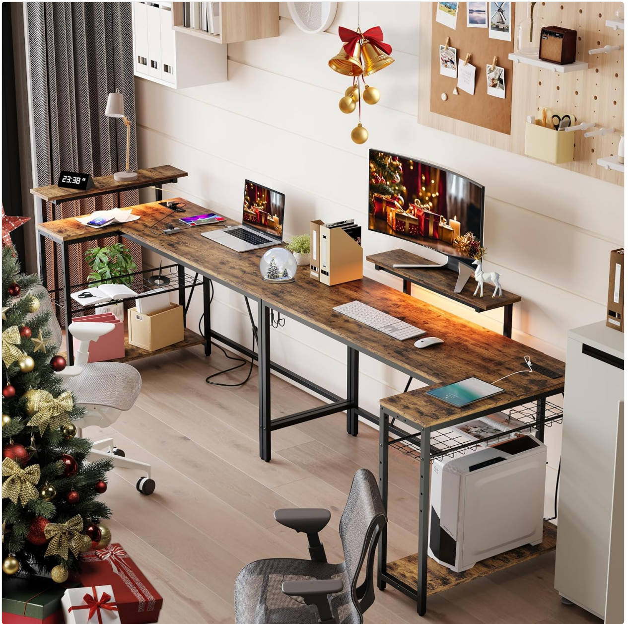
Figure 2.2: Various reversible configurations of the desk.