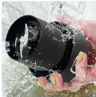
Image: Hand-washing the blade assembly.

Proper cleaning ensures hygiene and extends the life of your blender.