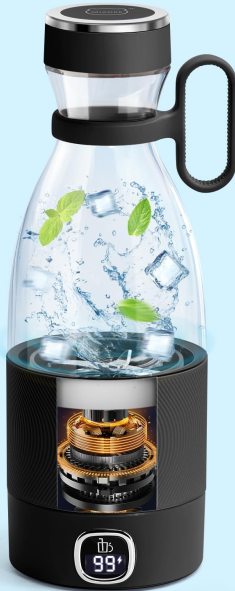
Image: Various methods for charging the blender via USB.