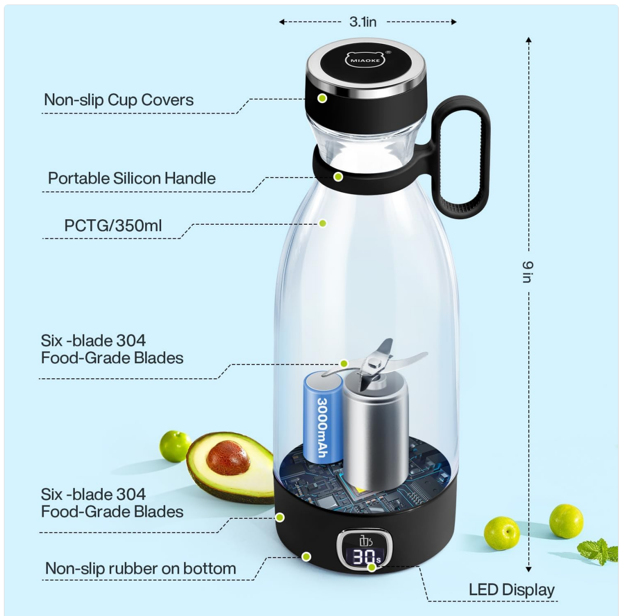
Image: Detailed diagram of the blender's components.