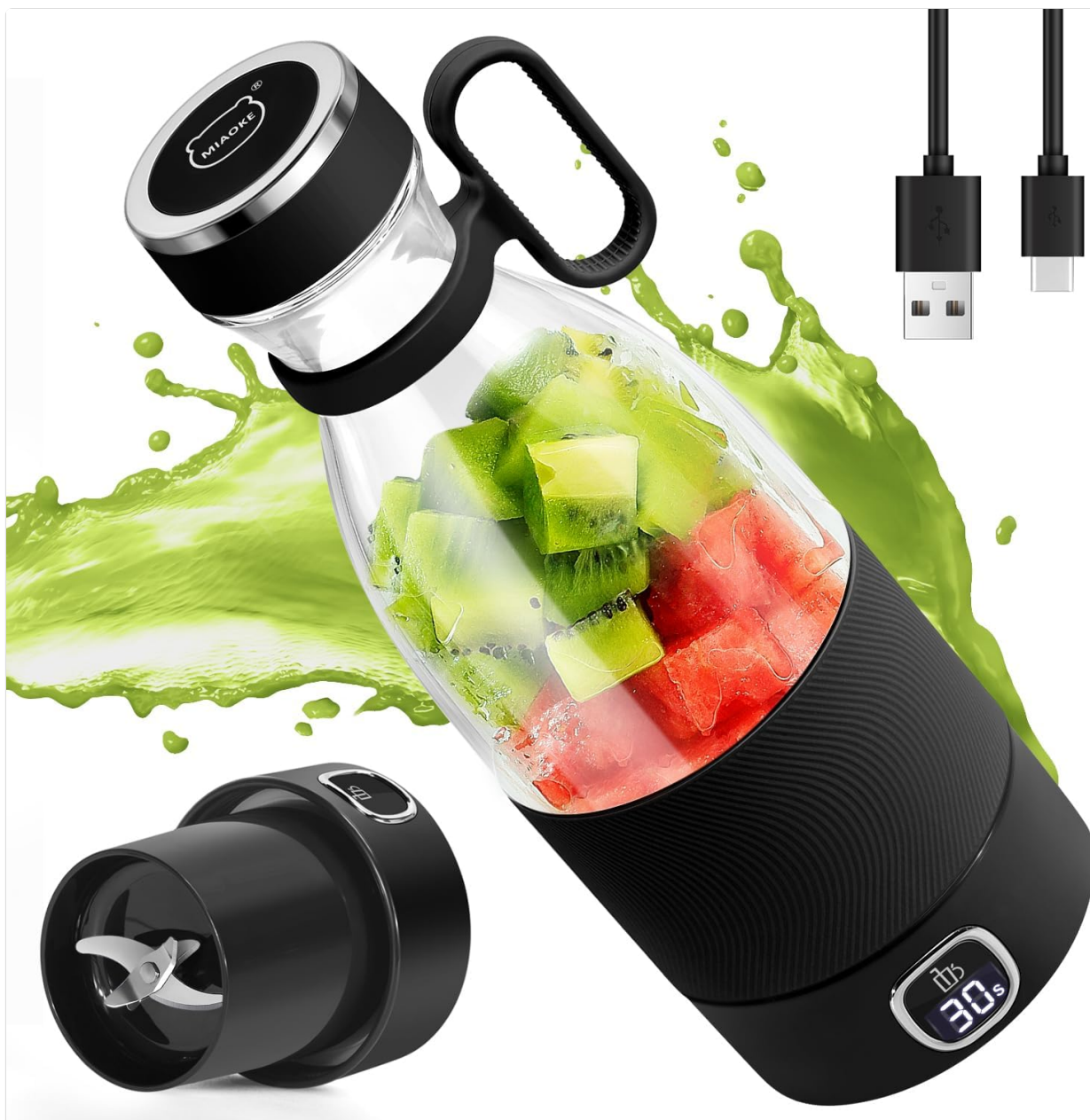
Image: MIAOKE Portable Blender with fruit, illustrating its design and included USB-C cable.