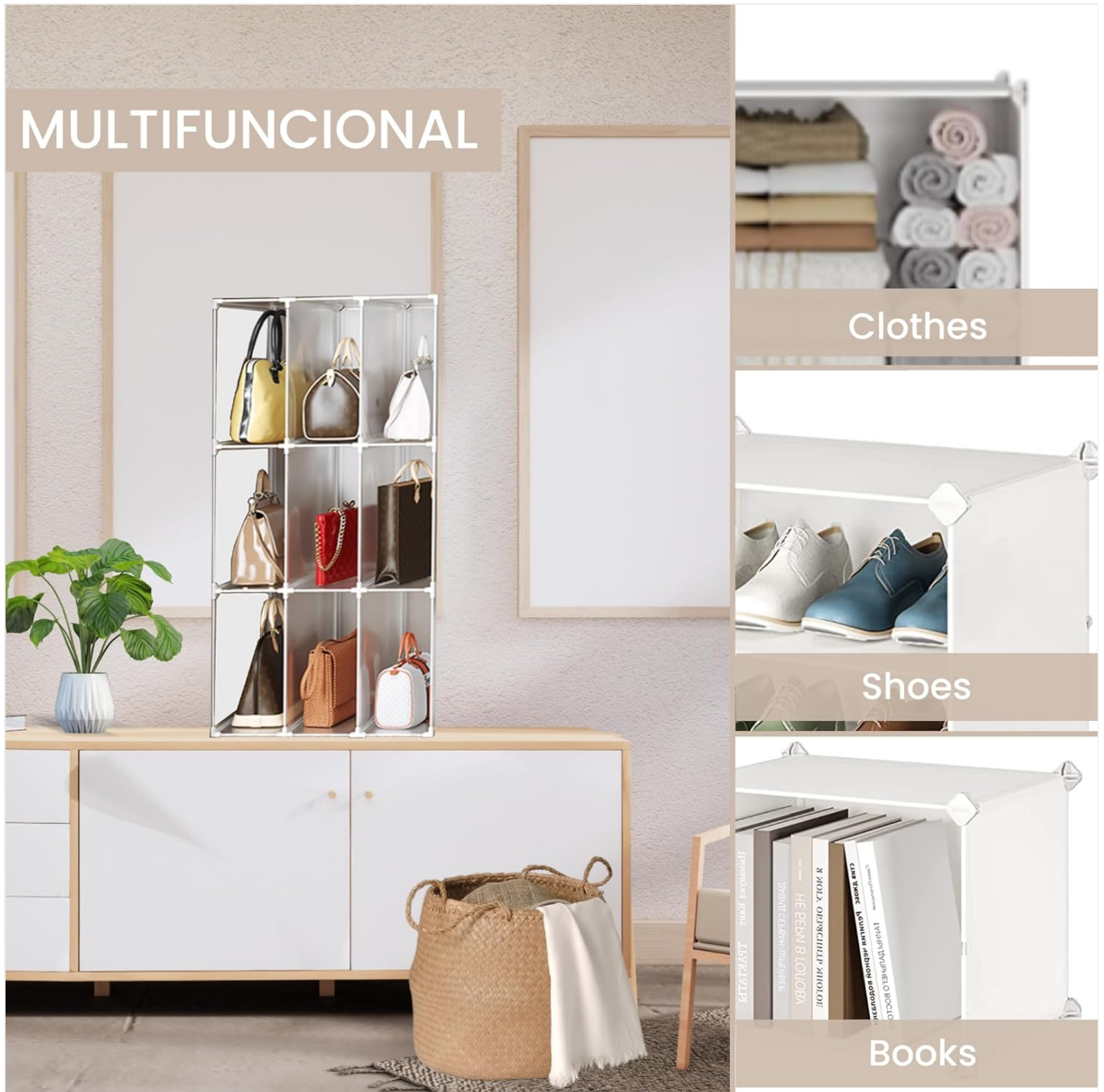
Image: Examples of the organizer's versatility, storing different types of items like clothing, footwear, and books.