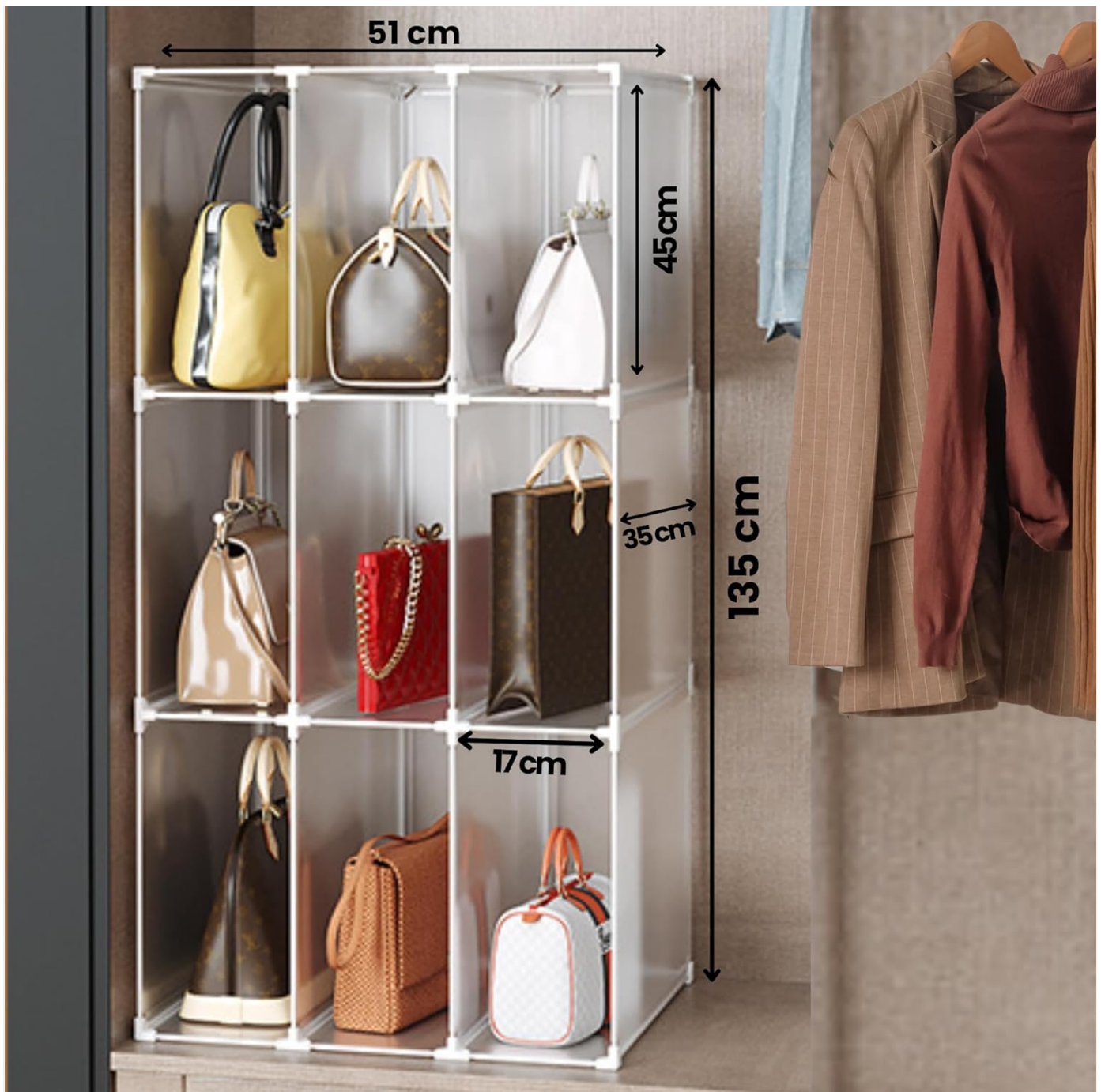
Image: Dimensional overview of the assembled 9-module organizer, indicating its overall size.