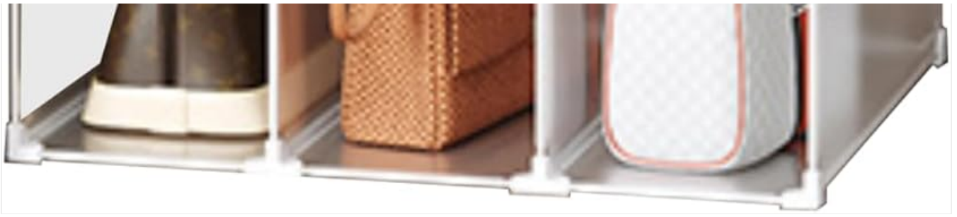
Image: The modular organizer showcasing its capacity for storing multiple handbags.