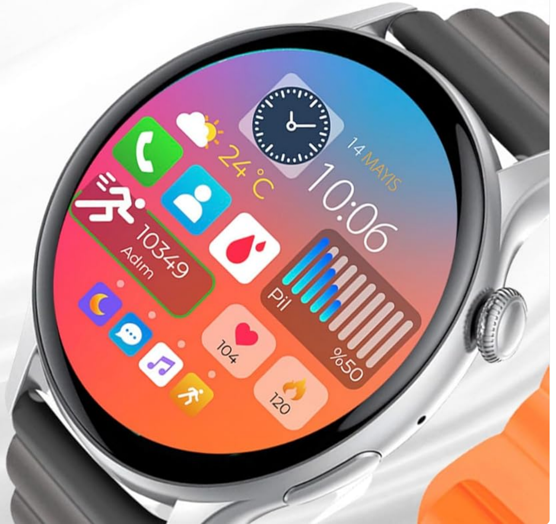
The Spovan AtlasX Mate's interface displaying a range of application icons for quick access to features like calls, weather, and health