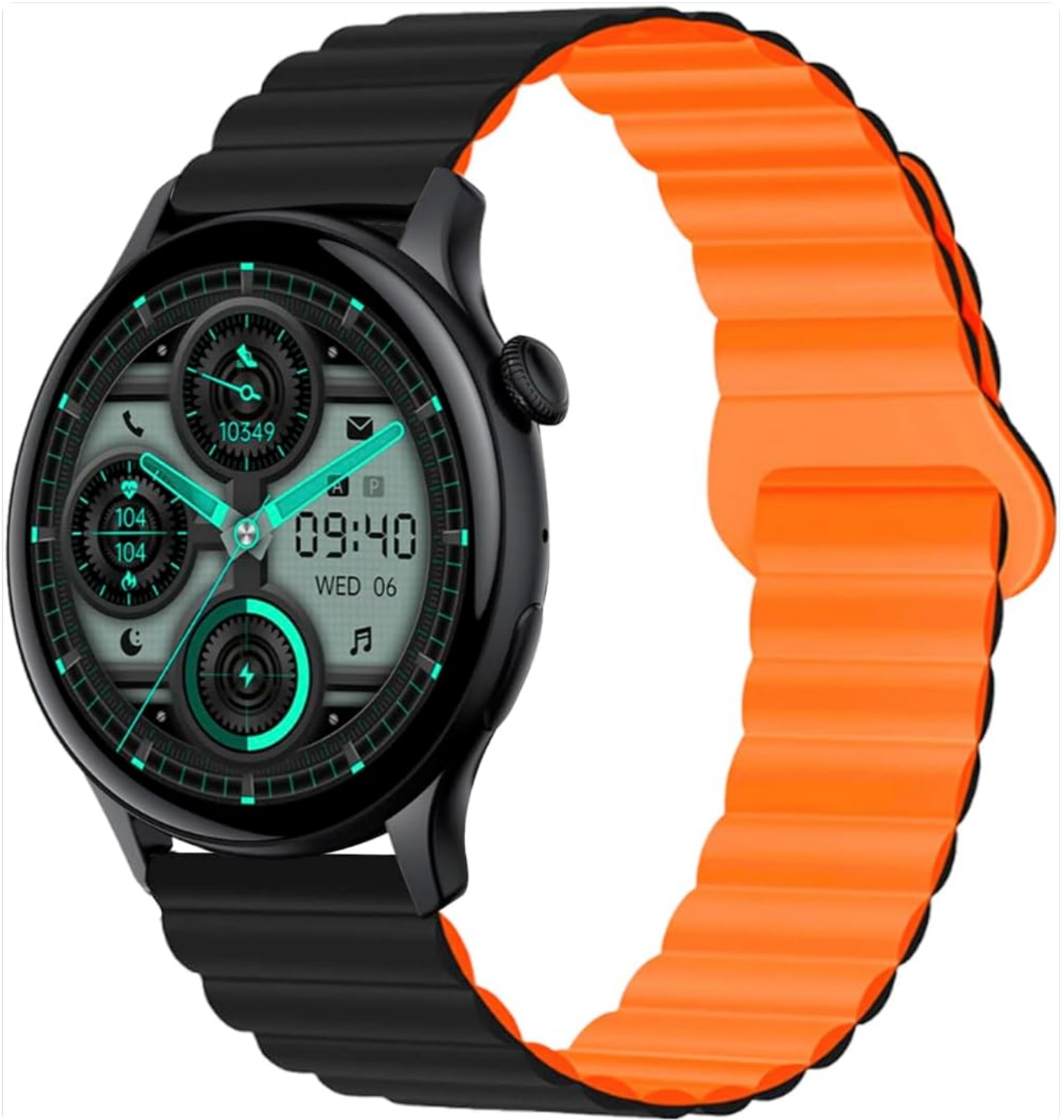
The Spovan AtlasX Mate smartwatch showing the visual representation of its active voice assistant feature.

The Spovan AtlasX Mate integrates with voice assistants. For iOS, it's compatible with Siri, and for Android, it works with Google Assistant. Activate the voice assistant through the watch's menu or a designated gesture/button press, then speak your commands.