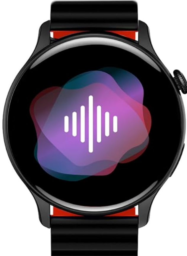
A detailed view of the Spovan AtlasX Mate's magnetic strap, highlighting its design.