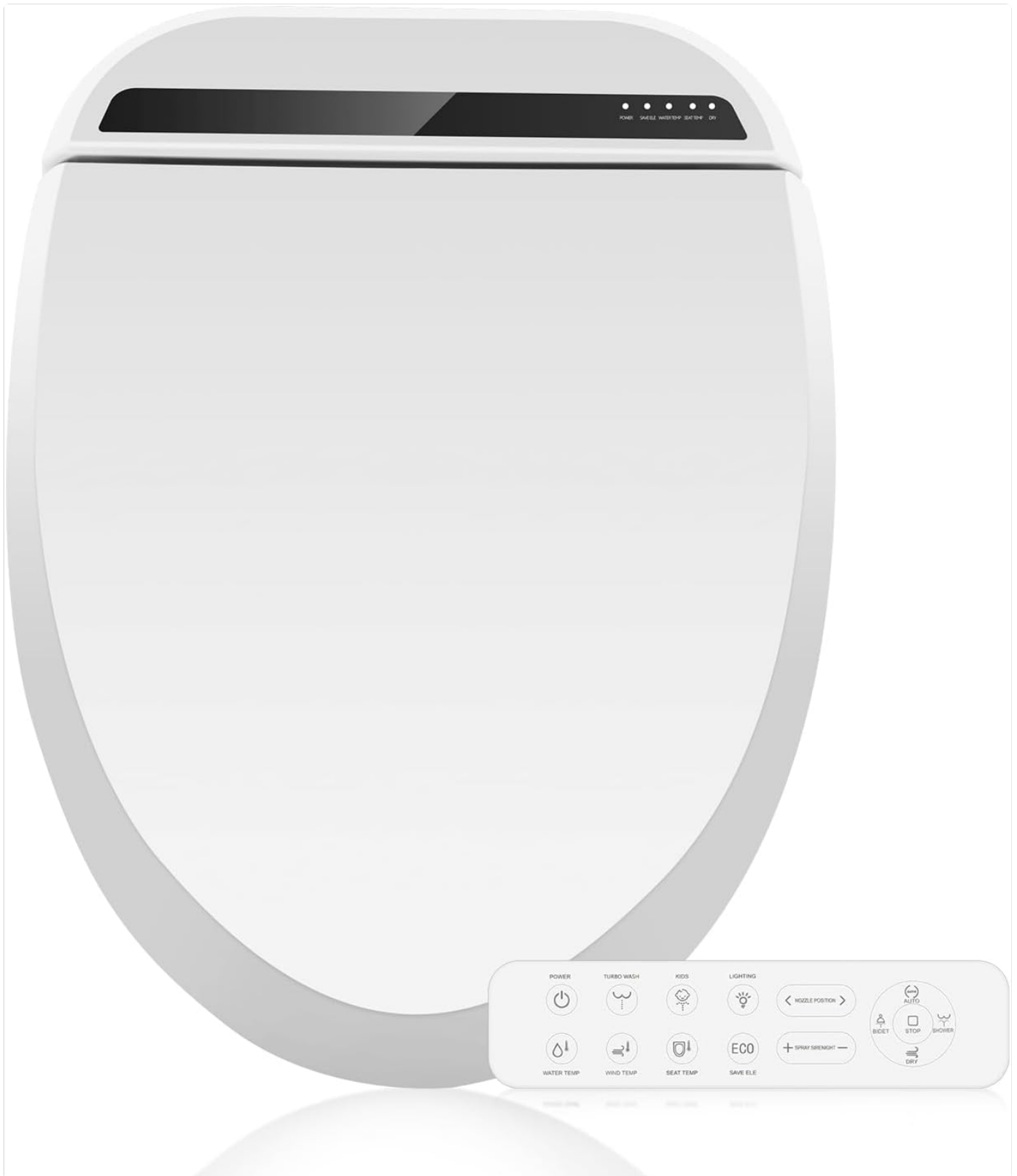
Image: Front view of the Puluomis Smart Bidet Toilet Seat with its wireless remote control. The seat is white and has a sleek, modern design.