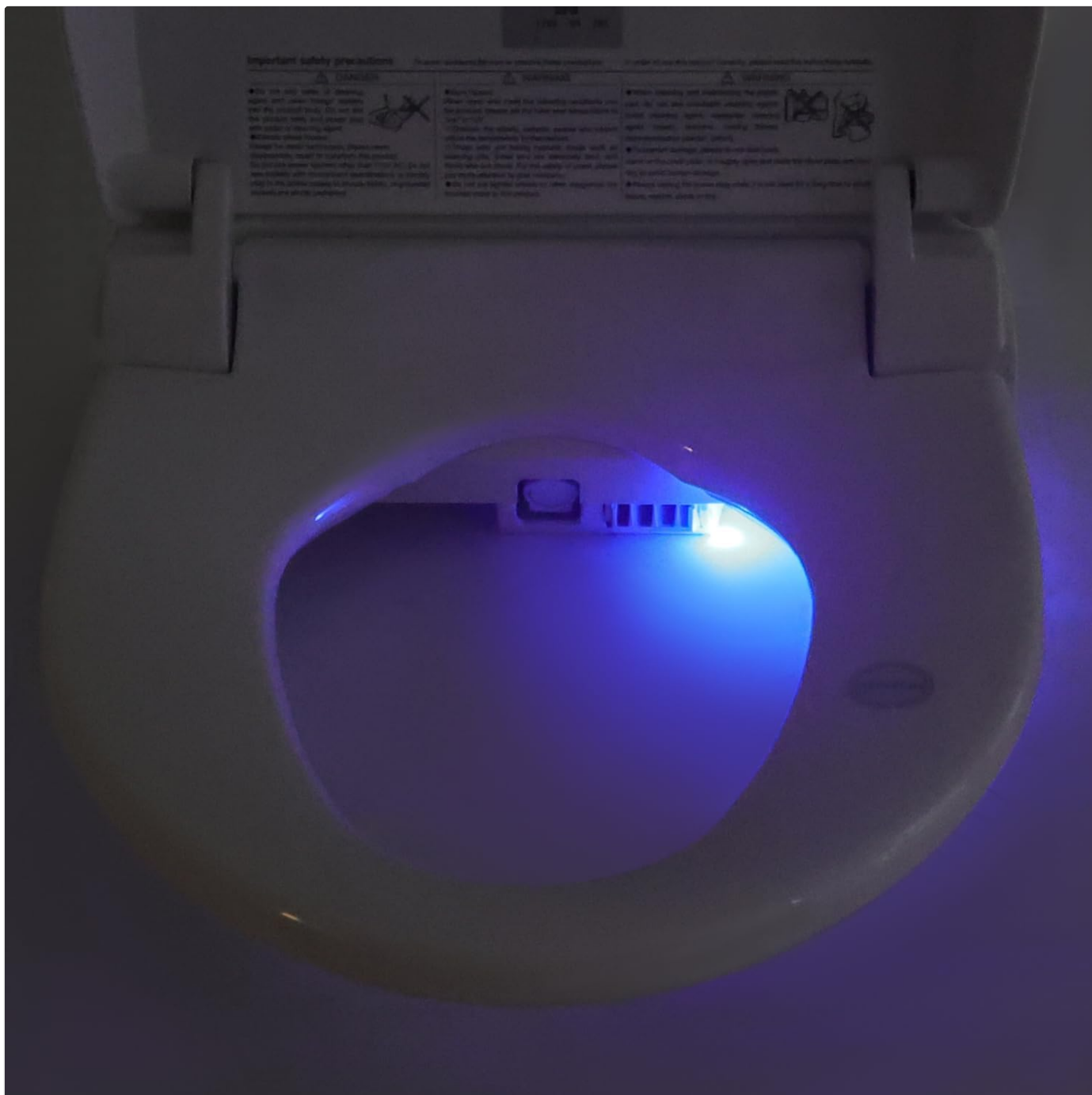
Image: The bidet seat with its soft blue LED night light illuminated, providing visibility in the dark without needing to turn on bright bathroom lights.