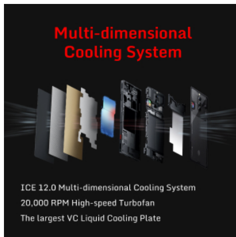
Image: Exploded view illustrating the components of the Multi-dimensional Cooling System, including the turbofan and liquid cooling plate.