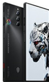
Image: The REDMAGIC 8S Pro projecting its screen at 120 FPS to a larger external display.