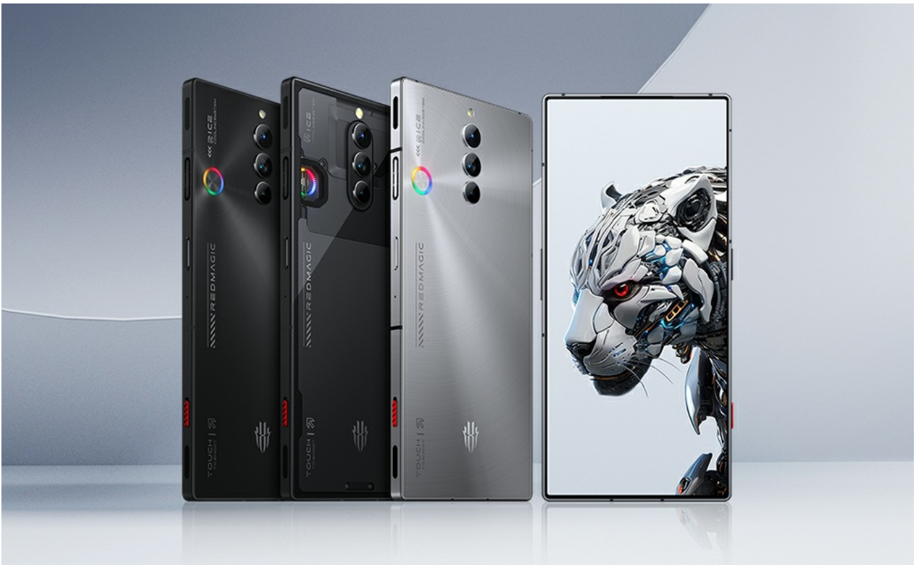
Image: The 6.8-inch UDC Full AMOLED screen specifications, highlighting its 120Hz refresh rate, 960Hz touch sampling rate, 2480x1116 resolution, and 1300 nits peak brightness.