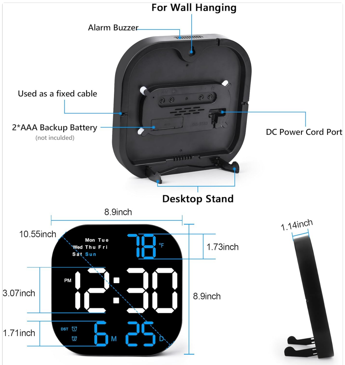
Image: Rear view of the clock showing the alarm buzzer, fixed cable, 2*AAA backup battery compartment, DC power cord port, desktop stand, and wall hanging slot, along with product dimensions.