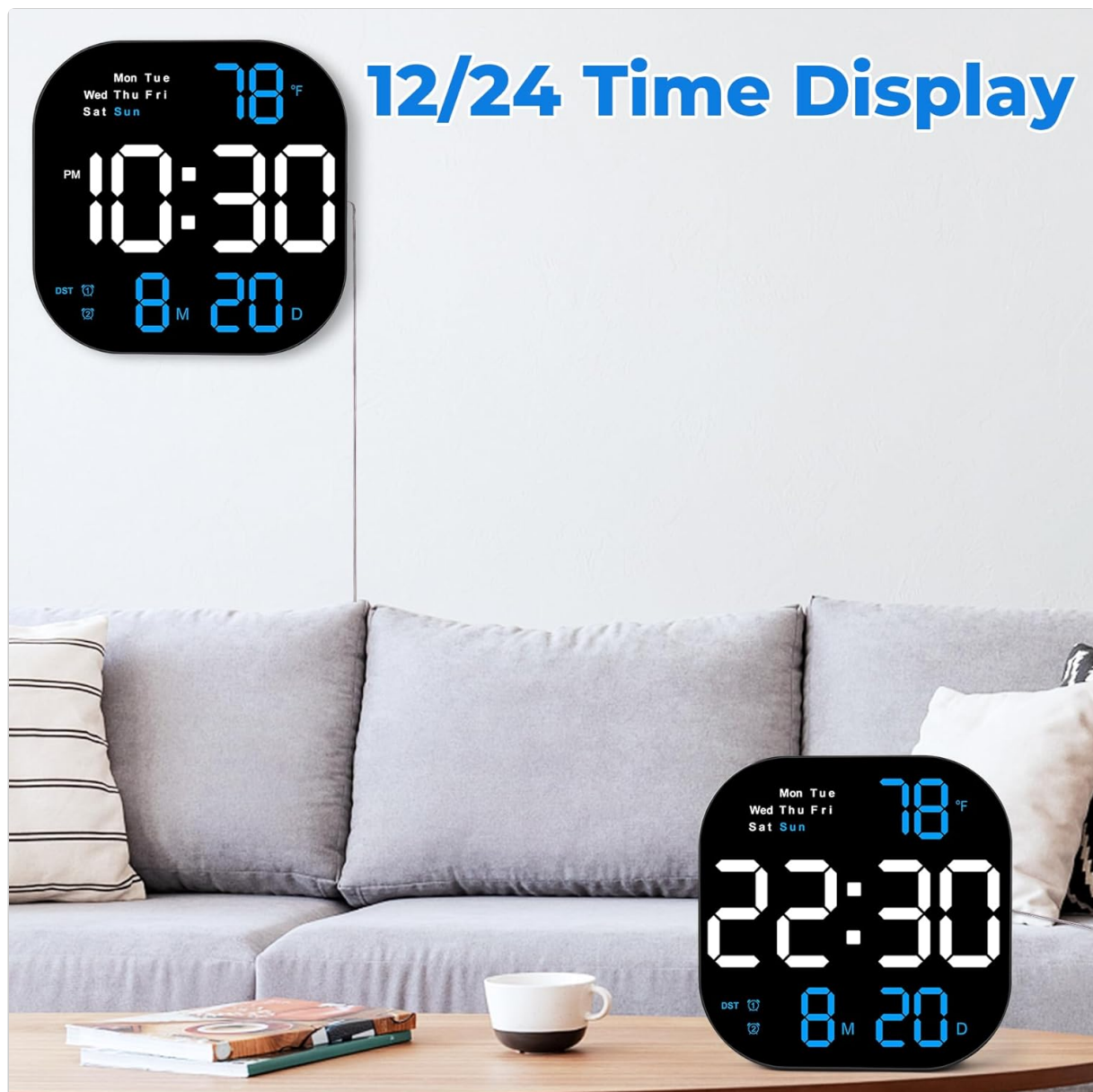
Image: Examples of the clock displaying time in both 12-hour (with PM indicator) and 24-hour formats.