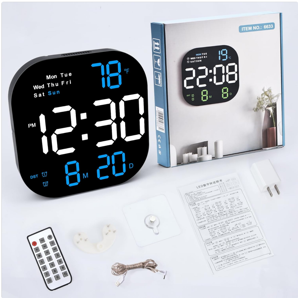
Image: The product packaging showing the clock, remote control, power adapter, and user manual.