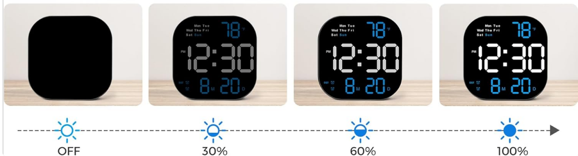
Image: The digital clock must be plugged into a power source to display information.