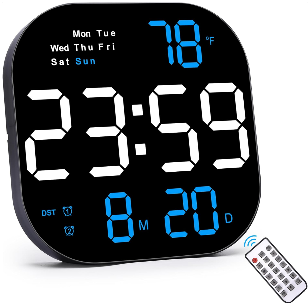
Image: The SZELAM LED Digital Wall Clock displaying time, date, day of the week, and temperature, along with its remote control.