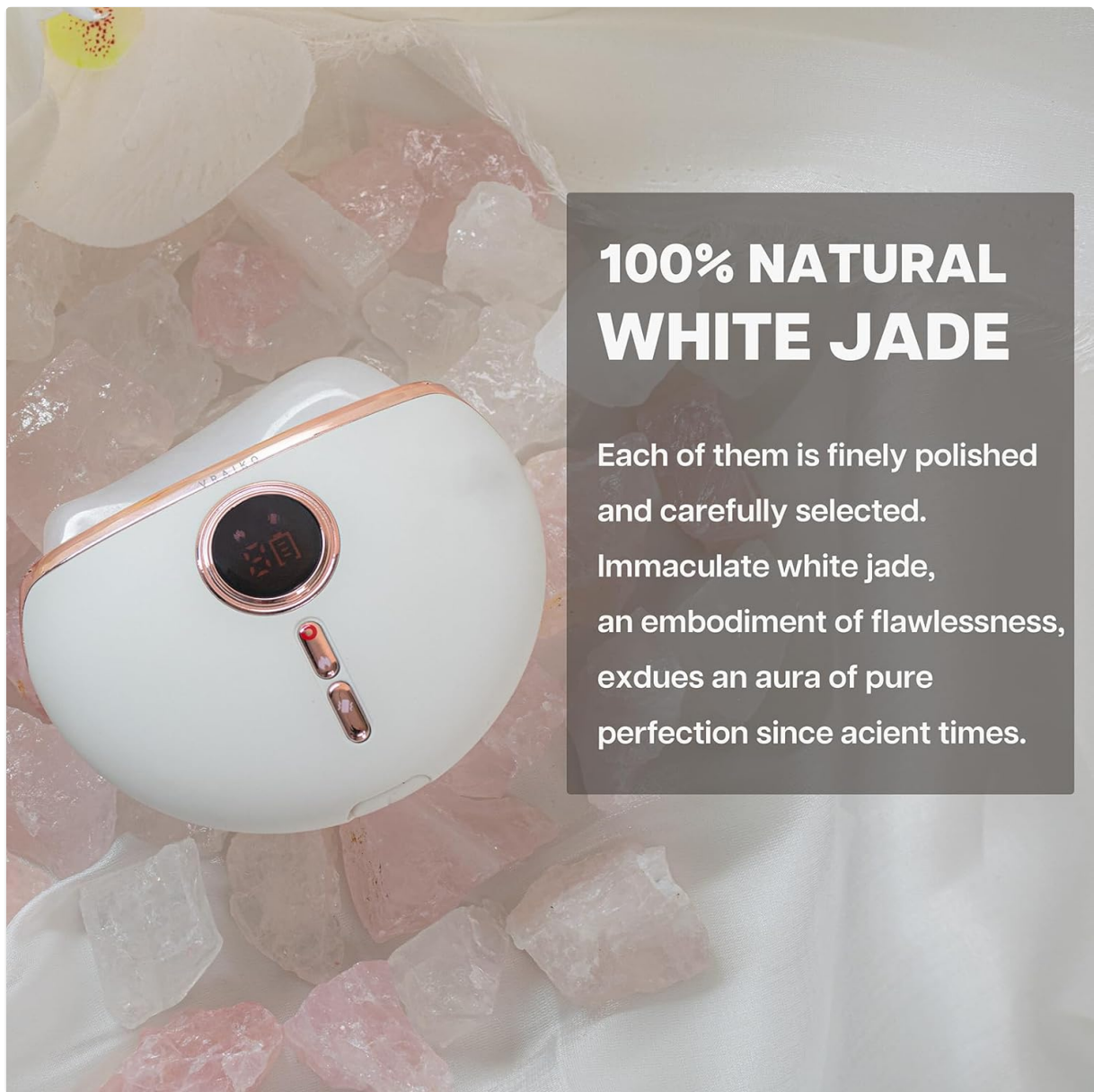
Figure 3: 100% Natural White Jade. The device is shown surrounded by raw white jade, illustrating its primary material.