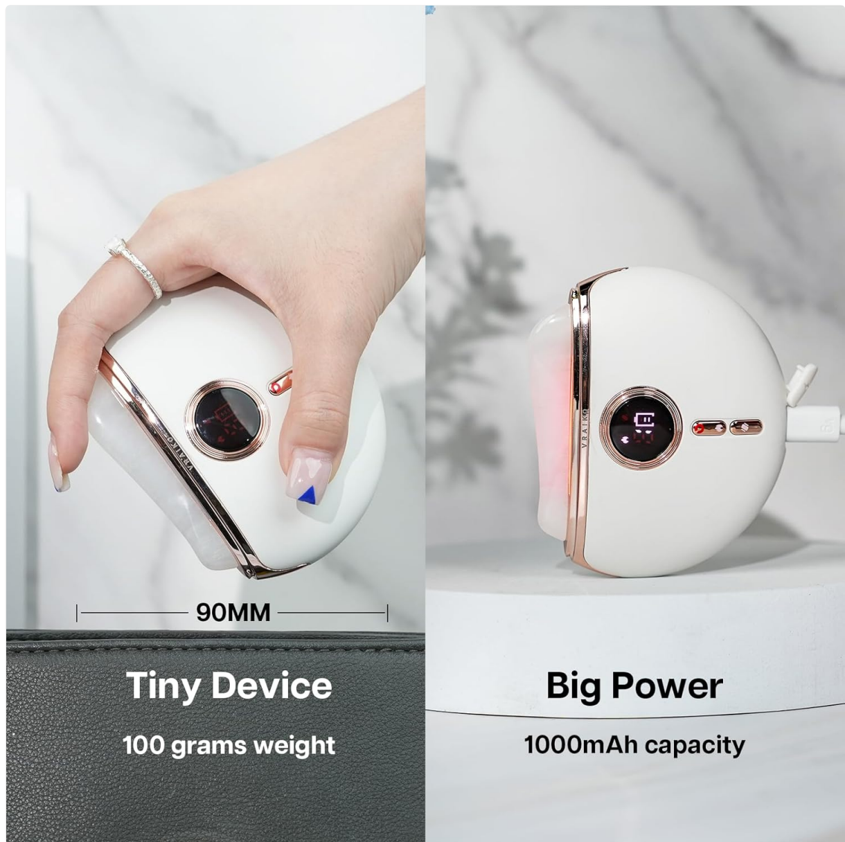
Figure 6: Device Dimensions and Power. This image illustrates the compact size and battery capacity of the VRAIKO Aurora device.